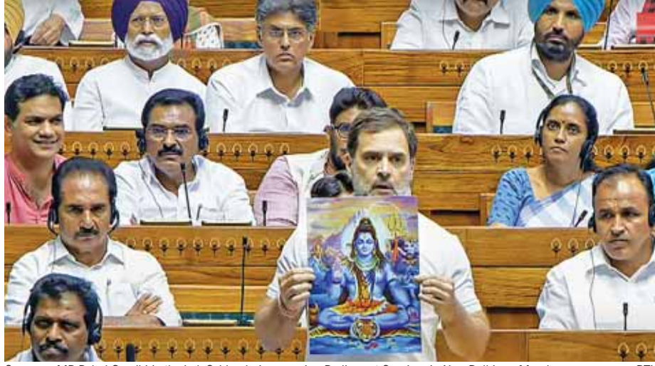
Congress MP Rahul Gandhi in the Lok Sabha during ongoing Parliament Session, in New Delhi, on Monday

The Opposition parties, led by Rahul Gandhi in the Lok Sabha and Mallikarjun Kharge in the Rajya Sabha, fired a salvo at the BJP and Prime Minister Narendra Modi, who is in his third tenure, by "provoking" and then "prompting" the top Cabinet Ministers from the BJP, including Modi, Amit Shah, and Rajnath Singh, to respond and retort to the statements made by Congress leaders in Parliament. Amid several rounds of interruptions, references to the Rule Books, Parliamentary conventions etc, a brief 'clash' between Speaker Om Birla and Rahul and a few Opposition leaders was also observed apparently catapulting a tough Opposition to resonate in Parliament after a hiatus of one decade. In his maiden speech as LoP in Lok Sabha, Rahul triggered a row when he said those who call themselves Hindus are engaged in "violence and hate" round the clock. Rahul said leaders of the ruling party are not Hindus as they engage in "violence and hate" round the clock, drawing massive protests from the Treasury Benches. He, however, hit back at