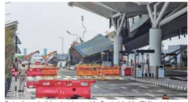
Restoration and relief work underway at the Terminal-1 of the IGI Airport where a canopy collapsed amid heavy rain in New Delhi

Aviation Ram Mohan Naidu on Monday visited the Airport Operations Control Centre (AOCC) at the Indira Gandhi International Airport (IGI) and held a meeting with senior officials from the Ministry of Civil Aviation, DGCA, BCAS, DIAL, and airline operators where he took stock of the operations. The meeting focused on reviewing current operations and passenger handling following the transition of flights from Terminal 1 to Terminals 2 and 3. According to the Ministry, a comprehensive assessment was conducted, involving