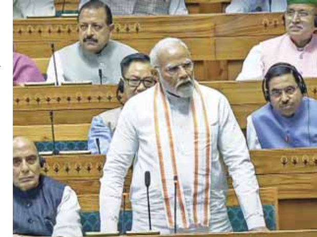
Prime Minister Narendra Modi speaks in the Lok Sabha during ongoing Parliament Session, in New Delhi, on Monday

Prime Minister Narendra Modi termed "serious" the remarks made by Leader of Opposition in Lok Sabha, Rahul Gandhi, by calling the entire Hindu society violent and he, along with Home Minister Amit Shah and other Ministers, demanded an apology from the Congress leader. Intervening during Rahul's speech, Modi said, "This issue is very serious. Calling the entire Hindu community violent is a serious issue." Besides Modi, who intervened twice, at least five Cabinet Ministers also interjected during Rahul's speech with Shah demanding his apology for painting the Hindu community as violent. The second intervention by Modi came when Rahul alleged that Ministers do not greet him due to the fear of Modi, the Prime Minister said democracy and the Constitution have taught him to take the Leader of Opposition seriously. Shah said the ruckus created by the Opposition cannot drown the fact that the words — "those who call themselves Hindus indulge in violence" — were used in the House. Shah spoke of the