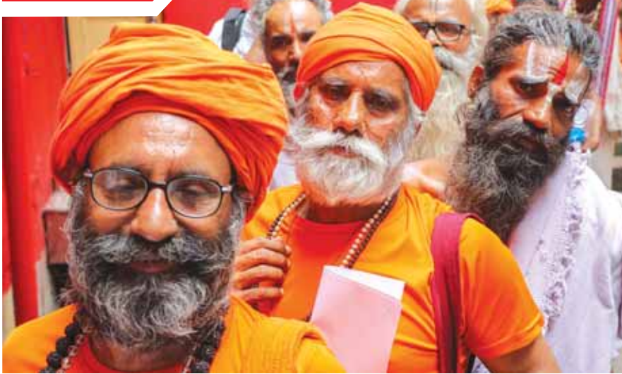
Pilgrims wait in a queue to get themselves registered for the annual Amarnath Yatra, in Jammu