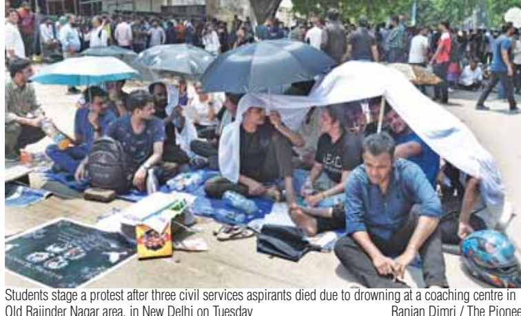
Students stage a protest after three civil services aspirants died due to drowning at a coaching centre in Old Rajinder Nagar area, in New Delhi on Tuesday

Days after three IAS aspirants died in rain-induced flood in the basement of Rau's coaching centre, an enquiry report by the Delhi Chief Secretary on Tuesday highlighted that the institute had completely blocked the drainage system and, unlike other similarly placed properties, had not constructed a barrier wall to prevent water from entering the building. Meanwhile, students continued to protest for the third consecutive day against the Municipal Corporation of Delhi (MCD) and Rau's management. One of the protesting students said ten IAS aspirants have started an indefinite hunger strike demanding compensation of ₹five crore to the victims' families. In his report to the Delhi Minister Atishi, Naresh Kumar has mentioned that the property users in the area have constructed ramps over the entire width of the plot, thereby blocking the entry of storm water during heavy rain into the existing drainage system for the sake of convenience. "The opening in the shape of the manhole over the drainage system has also been covered with finishing items, thus leaving no scope for cleaning of the drains. They have covered the existing, built up section