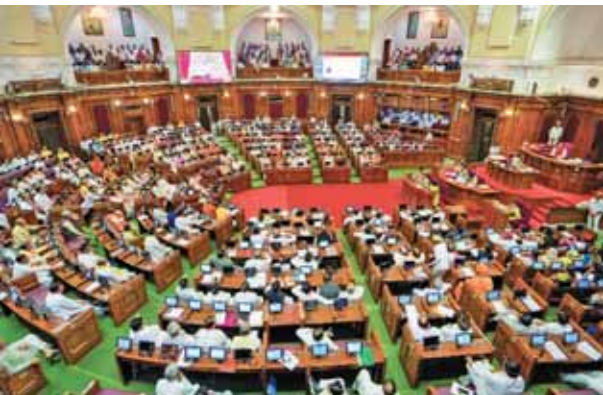
Uttar Pradesh Finance Minister Suresh Khanna presents a supplementary Budget in the presence of Chief Minister Yogi Adityanath and other members during the Monsoon Session of State Legislative Assembly at Vidhan Bhawan, in Lucknow, on Tuesday

The Uttar Pradesh Assembly on Tuesday passed the UP Prohibition of Unlawful Conversion of Religion (Amendment) Bill, 2024 that provides for a maximum punishment of life imprisonment, making the law stricter in cases of fraudulent or forced conversion. Parliamentary Affairs Minister Suresh Khanna introduced the Uttar Pradesh Prohibition of Unlawful Conversion of Religion (Amendment) Bill, 2024 in the House on Monday. The move, however, has drawn severe criticism from the Opposition. Earlier the maximum punishment provided for those found guilty of marrying a woman by deceiving and changing her religion was 10 years with a fine of ₹50,000. According to the new provisions, if any minor,