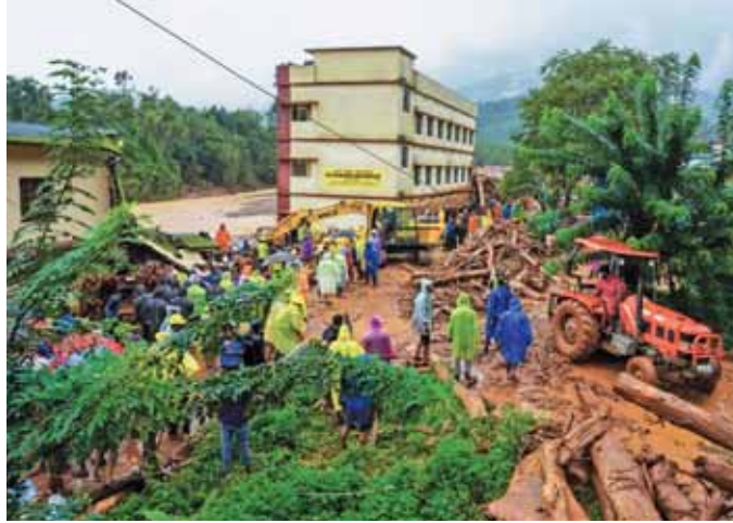
Rescue operation underway following landslides triggered by heavy rain at Chooralmala, in Wayanad district, Kerala, on Tuesday

ground reality of the ecology of the district. The committee found that deforestation, uncontrolled quarrying and mining in the district have played havoc with the environment, contributing to the frequent landslides. Within hours of the landslides, the Central Government deployed National Disaster Response Force of the Indian Army, Indian Navy and Coast Guard to save the people who were trapped by the flood waters, soil and rocks. In addition to the residents of Mundakkai atop the high ranges, many holiday makers staying in the hundreds of high-end resorts in the region too have been trapped in the landslides. Indian Air Force have deployed two choppers from its Sulur base