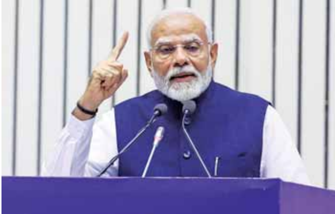
Prime Minister Narendra Modi speaks during CII post-Budget conference in New Delhi PTI

this opportunity," Modi said. Pointing towards the growing interest in India among global investors, the Prime Minister informed the industry about his call in the recent NITI Aayog meeting to State Chief Ministers for creating investor-friendly charters, bringing clarity in investment policies and creating a conducive atmosphere for investment. With high growth and low inflation, he said, India is a beacon of growth and stability in a world which is facing high inflation and low growth and other geopolitical challenges. India is growing at 8 per cent and the day is not far when the country will become the third-largest