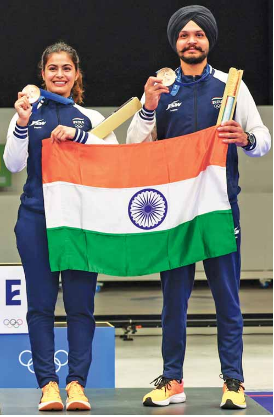
Manu Bhaker and Sarabjot Singh celebrating their bronze medal win in the 10m air pistol mixed team event at the Paris 2024 Olympics.

PTI ■ CHATEAURoux (FRANCE) A calm and composed Manu Bhaker scripted history to become the first Indian athlete in post-independence era to win two Olympic medals in a single edition of the Games as she combined with an equally unruffled Sarabjot Singh to clinch the 10m air pistol mixed team bronze here on Tuesday.