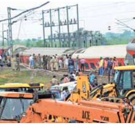
Rescue work underway after the Howrah-Mumbai Mail derailed near Badabambo, in Seraikela-Kharsawan district of Jharkhand, early Tuesday. At least two people were killed in the accident, according to officials

district. According to environmentalists, Tuesday's disaster is yet another proof that the State administration has not learnt anything from past mistakes. Wayanad has no representative in Parliament as Rahul Gandhi, the Leader of Opposition who was elected from the constituency, gave it up immediately after the 2024 Lok Sabha poll to retain Rae Bareilly. Besides the dead bodies, the rescue teams came across mutilated parts of human bodies which were crushed by huge rocks and stones spewed with force by the landslides. At the time of going to the Press, only less than half of the dead bodies have been identified. Continued on Page 2