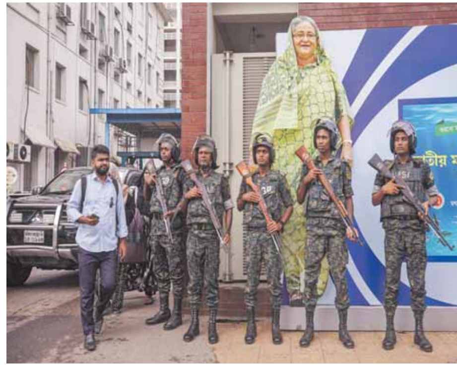
Military personnel stand guard in front of a large cutout portrait of Prime Minister Sheikh Hasina during the national mourning day, declared by the Bangladesh government to remember victims of the recent countrywide deadly clashes, in Dhaka, Bangladesh, on Tuesday, July 30.

Prime Minister Sheikh Hasina's ruling Awami League's (AL) general secretary Obaidul Quader, meanwhile, said the government would thoroughly examine legal aspects before banning Jamaat-Shibir to block any possible legal loophole, which could be exploited by "this extremist group" to engage in politics in Bangladesh. For the sake of the country, the 14-party alliance has decided to ban Jamaat-Shibir to eliminate anti-national evil forces, Quader said. Quader, also the Road Transport Minister, said that Jamaat and BNP used students as "shields" during the movement while "the government is aware of the sources of their instructions, incitements, and funding." Violence gripped Bangladesh for almost the entire of July when the protests that had started in universities and colleges earlier this month, quickly turned into a widespread agitation against Prime Minister Sheikh Hasina and her government's policies. The government called in the army to quell protests against job quotas after the unrest left at least 150 dead and several thousand people, including policemen, wounded and major government installations damaged. Meanwhile, the ruling Prime Minister Sheikh Hasina's Awami League-led 14-party alliance leaders held a meeting with Hasina in the chair and