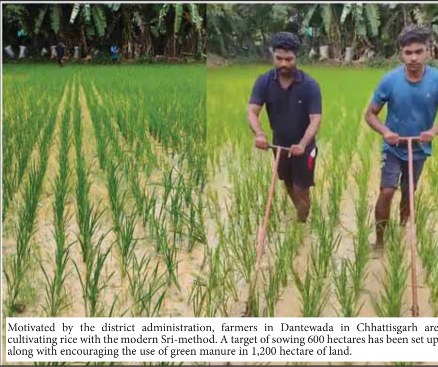
Motivated by the district administration, farmers in Dantewada in Chhattisgarh are cultivating rice with the modern Sri-method. A target of sowing 600 hectares has been set up along with encouraging the use of green manure in 1,200 hectare of land.