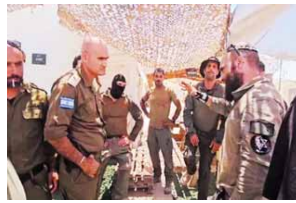
A heated argument erupts between soldiers at the Sde Teiman detention facility in southern Israel after Military Police investigators arrived to detain suspects for questioning.

The Israeli military said Monday it was holding nine soldiers for questioning following allegations of "substantial abuse" of a detainee at a shadowy facility where Israel has held Palestinian prisoners throughout the war in Gaza. The military did not disclose additional details surrounding the alleged abuse, saying only that its top legal official had launched a probe. An investigation by The Associated Press and reports by rights groups have exposed abysmal conditions at the Sde Teiman facility, the country's largest detention centre. A report by the United Nations agency for Palestinian refugees, UNRWA, earlier this year said that detainees alleged they were subjected to ill-treatment and abuse while in Israeli custody, without specifying the facility.