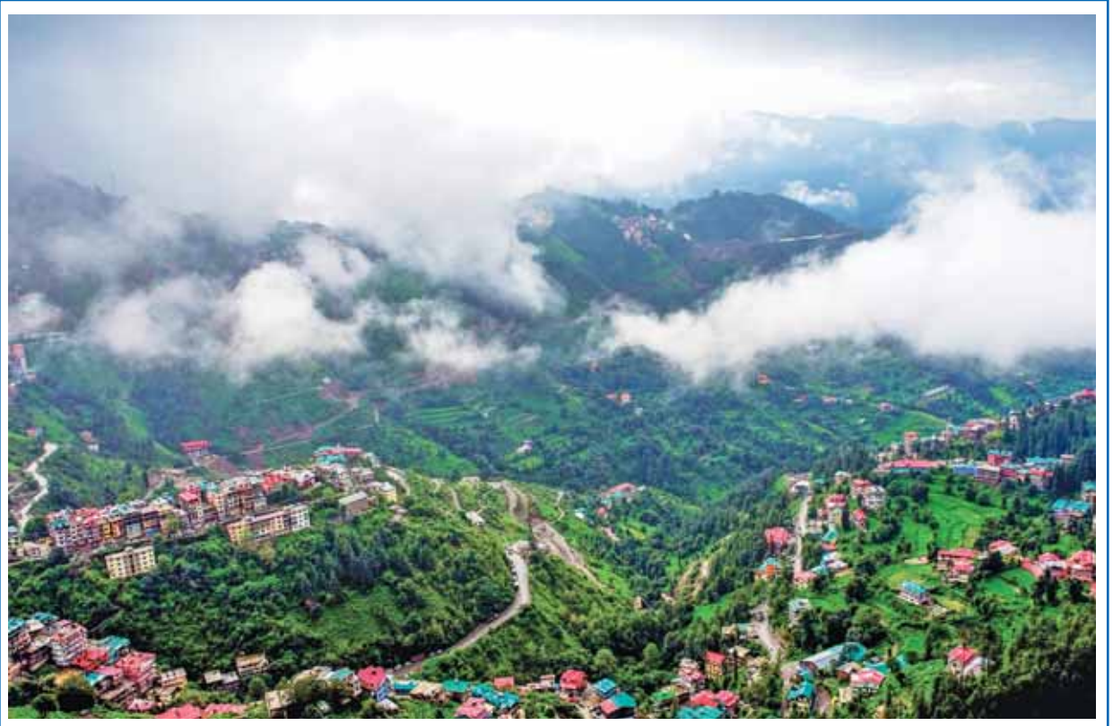
Shimla: Clouds hover over the hill town of Shimla on Monday