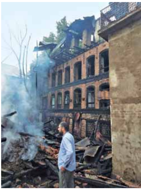
At least four houses belonging to Kashmiri Pandits were gutted under mysterious circumstances in the Mattan area of Anantnag district.

A prominent Kashmiri Pandit activist Ravinder Padita, associated with the Save Sharda in a post on X commented, "Is it sabotage or natural causes? One needs to know".