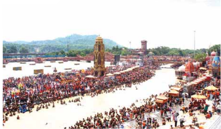
'Kanwariyas' gather at Har Ki Pauri ghat to collect 'Ganga jal', in Haridwar