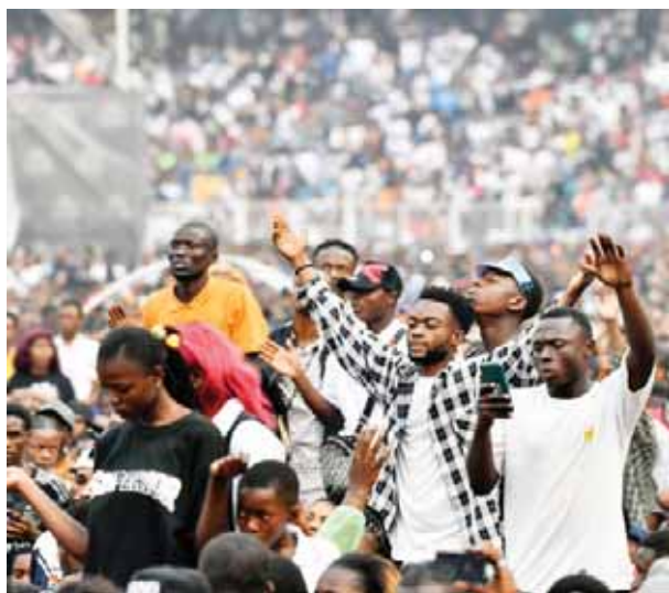
local music management company that organised the