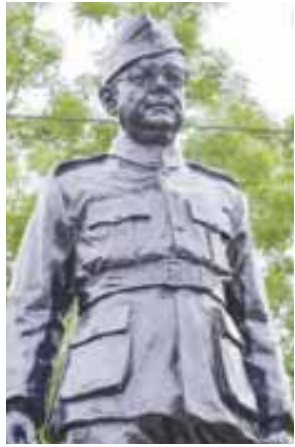
"We have been writing to the prime minister for the last three-and-a-half years, that in order to honour the liberator of India, his remains must touch Indian soil," he said.