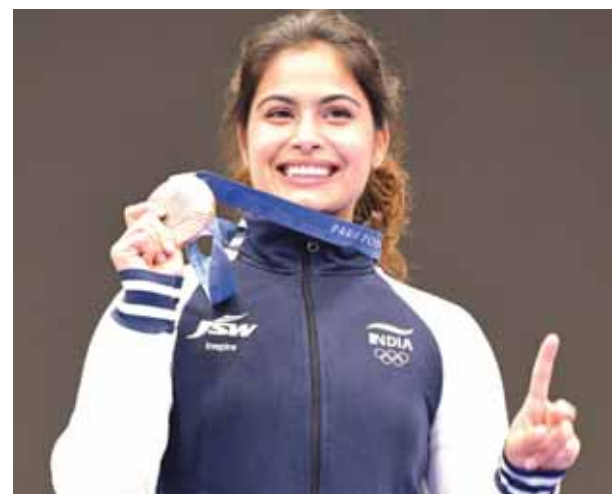
Manu Bhaker poses for a photograph with her bronze medal after finishing third in the 10m air pistol women's final round at the 2024 Summer Olympics, France, on Sunday

On July 27 Manu Bhaker had qualified for the final of her event with a score of 580 points, finishing third out of 45 competitors with the top-eight going through to Sunday's final. Bhaker scored 221.7 in the final round in which she fought hard against Korea's Kim Yeji who bagged silver and Jin Ye Oh bagged the gold with a games record of 243.2. Bhaker stated, "I was fighting with all the energy I have. Really grateful that I could win the bronze. I read Bhagwat Gita and always tried to do what I am supposed to do, left everything else to god." "We can't fight destiny," said Bhaker who appeared in her second Olympic stint. Previously she couldn't make it to the final and registered a bronze in this 2024 Olympic ending a drought in Olympic event.