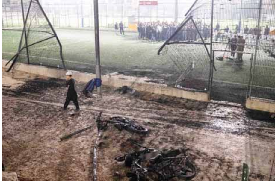
A boy walks past bicycles left next to the area that was hit by a rocket on a soccer field in the Druze town of Majdal Shams, in the Israeli-annexed Golan Heights, Saturday, July 27, 2024. A rocket strike Saturday at a soccer field killed at least 11 children and teens, Israeli authorities said, in the deadliest strike on an Israeli target along the country's northern border since the fighting between Israel and the Lebanese militant group Hezbollah began. It raised fears of a broader regional war.

A rocket strike on Saturday at a soccer field killed at least 12 children and teens, Israeli authorities said, in the deadliest strike on an Israeli target along the country's northern border since the fighting between Israel and the Lebanese militant group Hezbollah began. It raised fears of a broader regional war. Israel blamed Hezbollah for the strike in the Israeli-controlled Golan Heights, but Hezbollah rushed to deny any role. Israeli Prime Minister Benjamin Netanyahu warned that Hezbollah "will pay a heavy price for this attack, one that it has not paid so far". The Israeli military's chief spokesman, Rear Adm. Daniel Hagari, called it the deadliest attack on Israeli civilians since the Hamas attack on October 7 that sparked the war in Gaza. He said 20 others were wounded. "There is no doubt that Hezbollah has crossed all the red lines here, and the