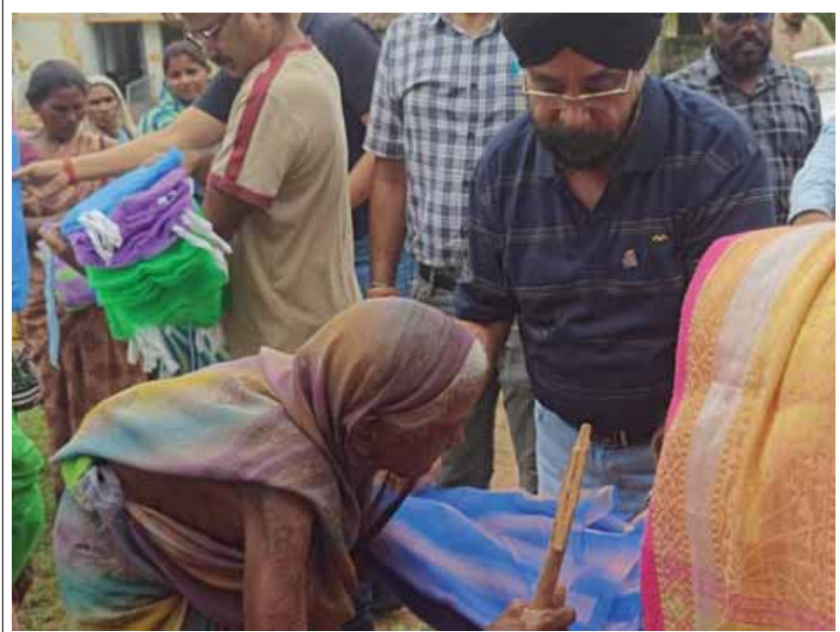
The Rotary E Club of Bilaspur United in Chhattisgarh on Sunday provided 1,000 mosquito nets, 35,000 chlorine pills and other aid in three villages affected by malaria and diarrhoea.

1972. The security forces obtained intelligence about the presence of 20 to 25 Naxalites near Kosalnar Manganar and Kuvem villages as well as the planned memorial event. The troopers conducted a thorough search of the area and demolished the Naxalite monument.