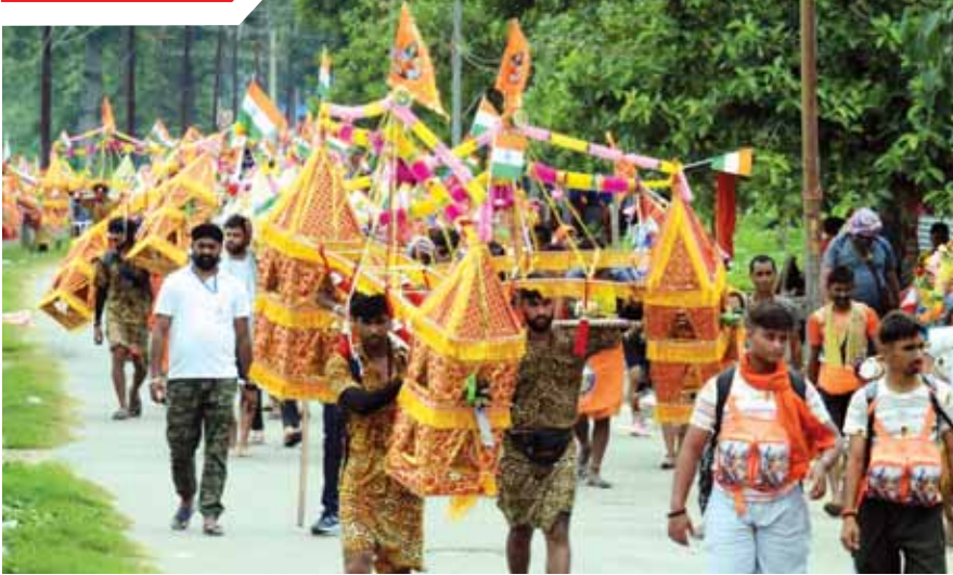
Kanwariyas carry Ganga water during their pilgrimage in the holy month of 'Shravan', in Haridwar