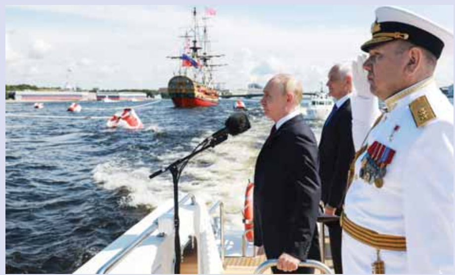
Russian President Vladimir Putin, centre, Russian Defense Minister Andrei Belousov, second right, and Russian Navy Commander-in-Chief Admiral Alexander Moiseyev, right, greet sailors prior to the main naval parade marking Russian Navy Day in St. Petersburg, Russia, on Sunday

tests that violated it. The allegations, which Russia denied, came as tensions mounted between Moscow and the West in the wake of the