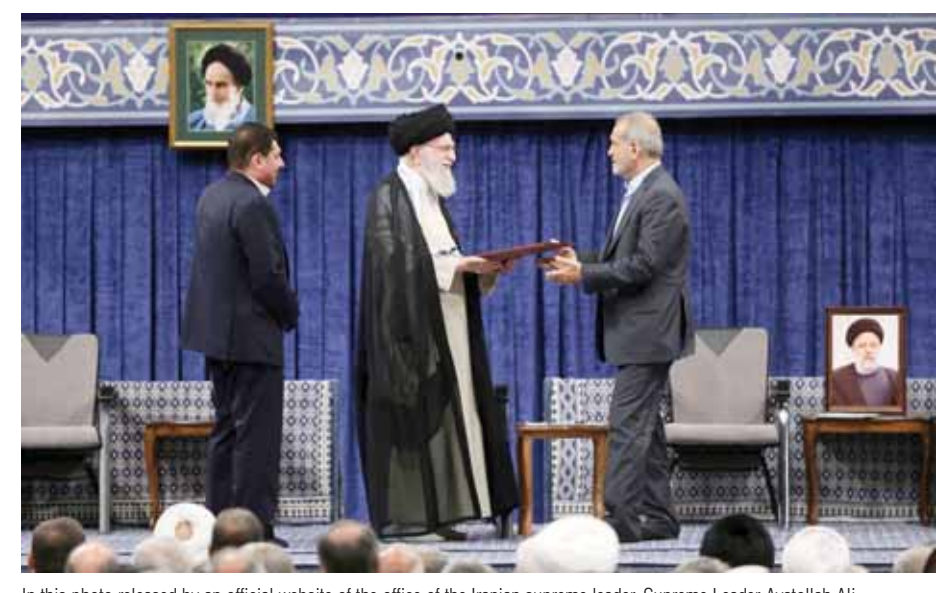
In this photo released by an official website of the office of the Iranian supreme leader, Supreme Leader Ayatollah Ali Khamenei, centre, gives his official seal of approval to newly elected President Masoud Pezeshkian, as acting President Mohammad Mokhber stands at left, in an endorsement ceremony in Tehran, Iran, on Sunday