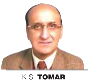
K S TOMAR

The new coalition, dominated by the pro-India Nepali Congress, will now be led by the communist leader Oli who will have a daunting task of ensuring political stability