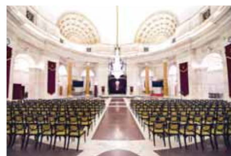
In this combo picture Rashtrapati Bhawan's iconic 'Durbar Hall' (left) and 'Ashok Hall' (right) have been renamed as 'Ganantra Mandap' and 'Ashok Mandap' respectively, in New Delhi

A year after renaming the famous Mughal Gardens as "Amrit Udyan" on the premises of Rashtrapati Bhawan, efforts continue to align the iconic building with India's status as a Republic and underscore democratic principles deeply ingrained in Indian society since ancient times.