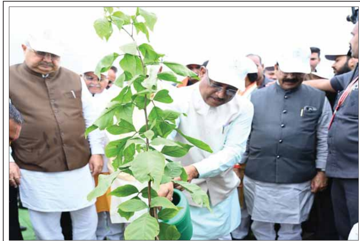
Chhattisgarh Chief Minister Vishnu Deo Sai, Assembly Speaker Raman Singh and other legislators on Thursday planted saplings at the Vidhan Sabha under the 'Ek Ped Maa Ke Naam' campaign.