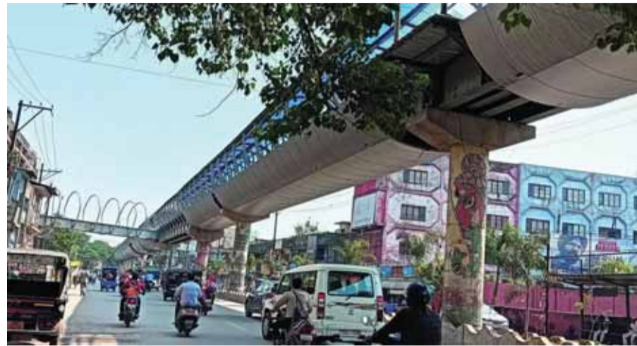
Collector and the work will be taken forward by testing the compensation and the need for land for road widening work between Sharda Chowk and Tatyapara Chowk. The skywalk was needed to facilitate pedestrians on one of the busiest routes between Shastri Chowk and Dr Bhim Rao Ambedkar Hospital Chowk in Raipur.

The Chhattisgarh government on Thursday decided to restart the incomplete construction of skywalk besides forming a panel to widen the busiest route between Sharda Chowk and Tatyapara route in Raipur. The decisions were taken at a meeting held under the chair of Chief Minister Vishnu Deo Sai here, an official statement said. It was decided to complete the construction of the incomplete skywalk as per the predetermined drawing-design. Also, a committee will be formed under the chairmanship of the Raipur