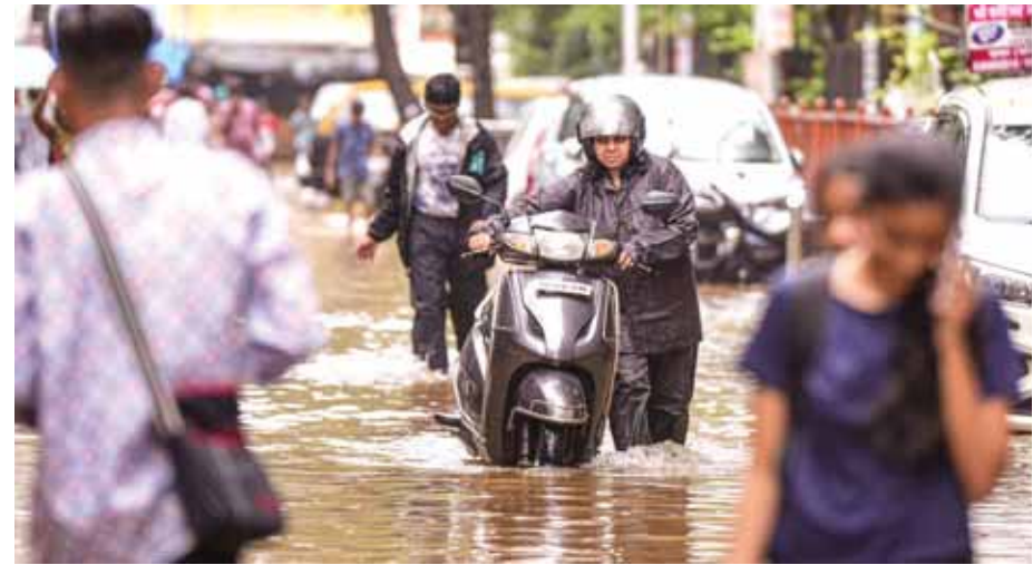
A commuter makes his way through a waterlogged road after rain, in Mumbai, on Thursday

At least three people were electrocuted in Pune and three others feared trapped under the debris of three collapsed villas in a hill slide at Lavasa, even as the heavy rains wreaked havoc in Pune.