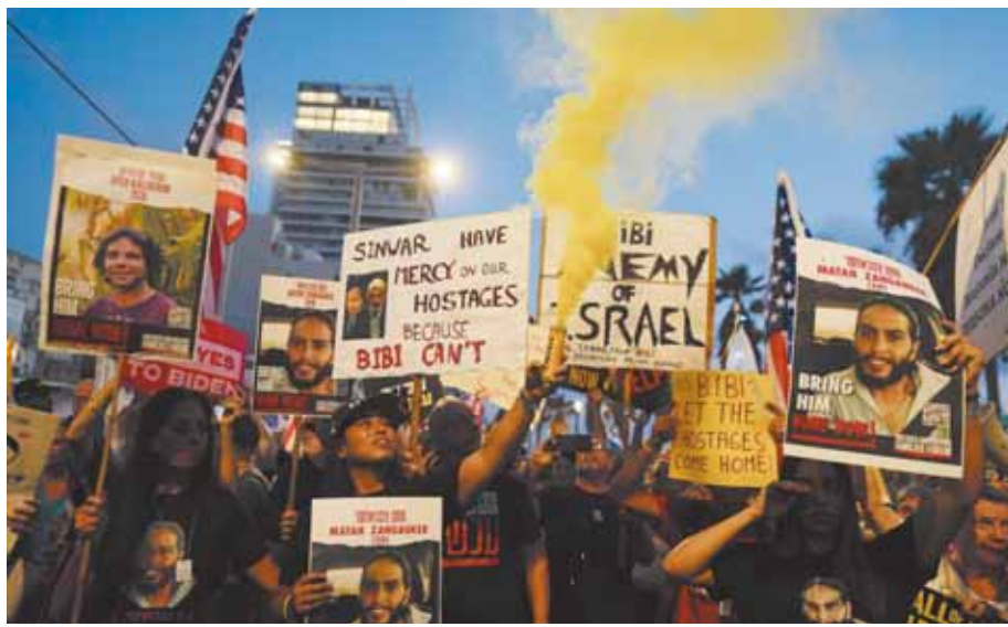
Relatives and supporters of the hostages held captive by Hamas in the Gaza Strip take part in a protest to demand their immediate release outside of the U.S. Embassy Branch Office in Tel Aviv, Israel, Wednesday.

Officials from Egypt, Israel, the United States and Qatar were expected to meet Thursday in Doha with the aim of resuming talks for a proposed three-phase cease-fire to end the war between Israel and Hamas and free the remaining hostages. But an Israeli official said Israel's negotiating team was delayed and would likely be dispatched next week. Israeli Prime Minister Benjamin Netanyahu addressed Congress in Washington on Wednesday as thousands of protesters gathered near the U.S. Capitol to denounce the war. Hamas slammed the speech Thursday and accused Netanyahu of obstructing efforts to end the war and return the hostages. Netanyahu has signaled that a cease-fire deal could be taking shape after nine months of war, but during his fiery speech to Congress, he vowed to press forward with Israel's war until he achieves "total victory." Palestinians displaced by the Israeli military's latest order to leave parts of the southern Gaza city of Khan Younis say