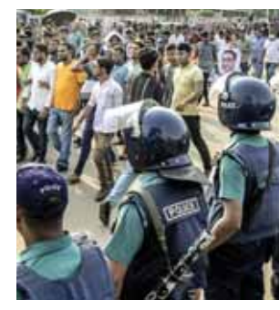
Protesters in Bangladesh.

In an address at a public event in Kolkata, Mamata, referring to violence-hit Bangladesh, said she would keep the doors of West Bengal open for people in distress from the neighbouring country and offer them shelter.