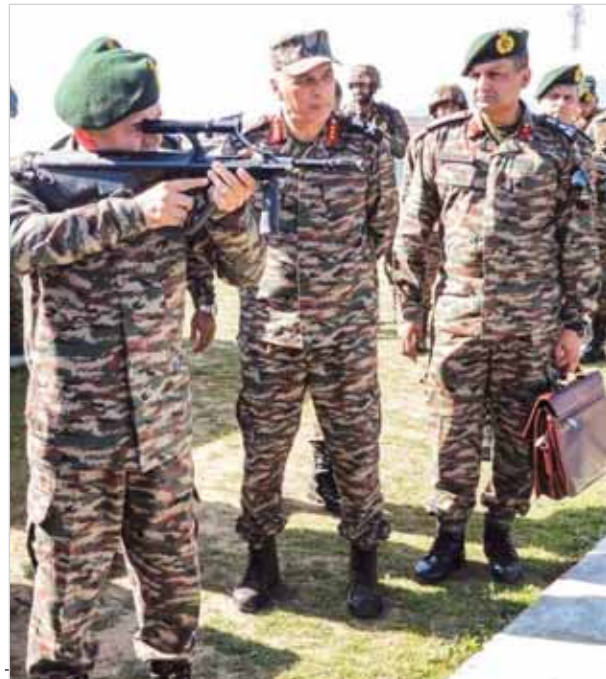
Army Chief General Upendra Dwivedi during his visit at the forward locations of Chinar Corps. Dwivedi also reviewed the security situation along the Line of Control during this visit.

The security forces have been kept in a state of high alert ahead of the visit of Prime Minister Narendra Modi to attend the 25th Kargil Vijay Diwas on Friday in Drass.