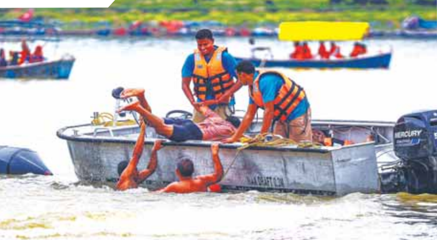
Members of the State Disaster Management Authority perform rescue operation during a mock drill, in Prayagraj