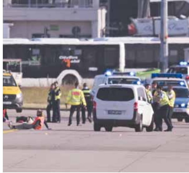
Emergency vehicles from the police, fire department and airport security are parked on the apron of Frankfurt Airport, where a few activists have taped themselves up in Frankfurt, Germany, on Thursday