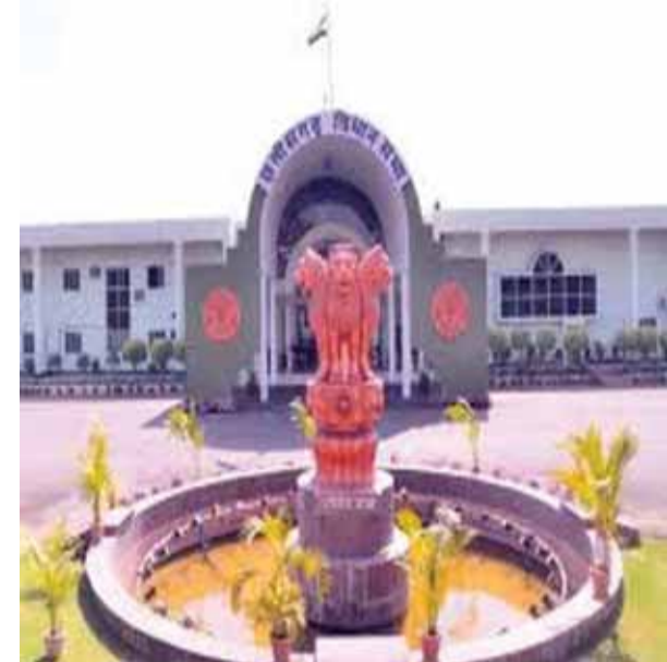
A state-level committee was already investigating the matter but now the House panel would probe it, he said.