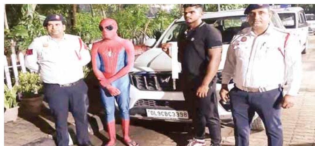
A 20-year-old man, sitting on a Scorpio car's bonnet and dressed as Spiderman landed in the police net on Wednesday

In an era where fleeting moments of fame on social media have become the obsession, many youngsters are resorting to dangerous stunts and rule-breaking to impress their followers on platforms like Instagram and Twitter. One such incident involved a 20-year-old "Spiderman" in Delhi, who was caught sitting on the bonnet of a car while making videos, showcasing the perilous lengths some will go for digital notoriety. According to officials on Wednesday, a fine of ₹ 26,000 was imposed for dangerous driving and other violations in the matter. According to the police, they received a complaint on social media platform X about a Scorpio car seen on Dwarka road with a person dressed as