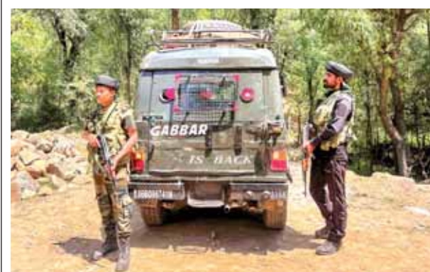
Security personnel stand guard during an encounter with terrorists in Trimukha area of Sopore in North Kashmir, on Wednesday