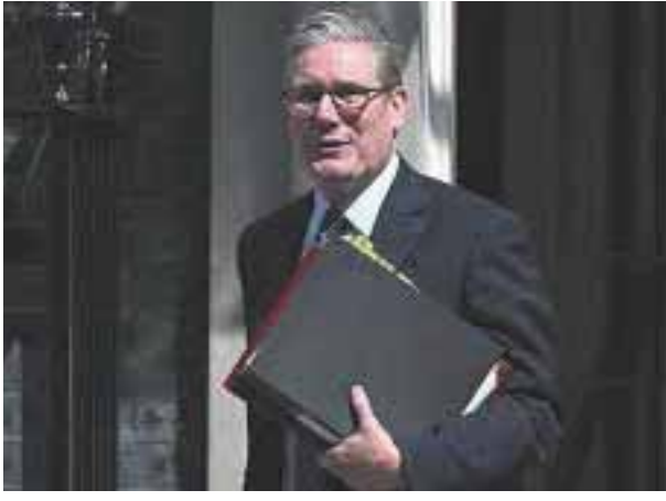
that role as leader of the defeated Conservative Party. Labour won a landslide election victory on July 4 on a

Newly elected British leader Keir Starmer faces a House of Commons milestone on Wednesday, fielding lawmakers' queries at the boisterous weekly Prime Minister's Questions session.