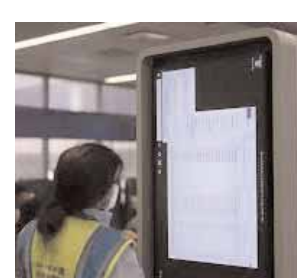
The company on Wednesday posted details online from its preliminary post incident review "of the outage, which caused chaos for the many businesses that pay for the cybersecurity firm's software services. The problem involved an "undetected error" in the

Crowdstrike is blaming a bug in an update that allowed its cybersecurity systems to push bad data out to millions of customer computers, setting off last week's global tech outage that grounded flights, took TV broadcasts off air and disrupted banks, hospitals and retailers.