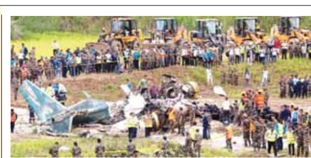
Rescue operations are underway at the site of a plane crash at Tribhuvan International Airport in Kathmandu, Nepal, on Wednesday

Observing that there is a trust deficit between farmers and the Central Government, the Supreme Court on Wednesday proposed the constitution of an independent committee comprising eminent persons to reach out to the protesters at Shambhu border and address their demands, including a legal guarantee of MSP. The top court directed the Punjab and Haryana Governments to suggest the names of suitable individuals for the committee and submit a proposal for removal of barricades on the National Highway while ordering a status quo on the border for a week. A three-judge bench headed by Justice Surya Kant said there is a need for a "neutral umpire" who can inspire confidence between farmers and the Government. "You have to take some steps to reach out to farmers. Why would they otherwise want to come to Delhi? You are sending Ministers from here and despite their best intentions there is