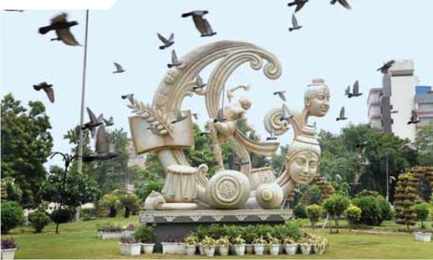
Pigeons fly past the new sculpture 'Natyashastra' installed at Mandi House, New Delhi