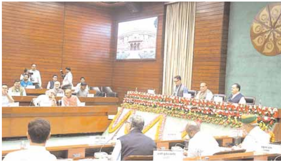
Defence Minister Rajnath Singh, Union Minister for Parliamentary Affairs Kiren Rijiju and Union Minister Jagat Prakash Nadda during the all-party meeting ahead of the Budget session of Parliament, in New Delhi on Sunday

The Monsoon Budget session will have 19 sittings till August 12 when the