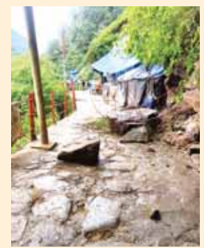
Debris lies on a road following a landslide on the Kedarnath trekking route, in Rudraprayag district, on Sunday. At least 3 pilgrims were killed and several others suffered injuries, according to officials.

girne wali hai'..." Yadav said. Both the SP and TMC are important constituents of the INDIA bloc led by the Congress. Banerjee also attacked the CPM and Congress. "I want to thank Akhilesh ji, you have accepted my invitation. I want the relationship of Bengal to be better with the entire country. I want to say the 'Khel' that you showed in UP, they (BJP) should have resigned from their post but they are shameless. They have tried every agency and every means possible but they have still lost. In North Bengal, our results have not been good but I hope in the coming days we will be winning there," Mamata said at the rally where she found the opportunity to attack the Congress as well as the Left.