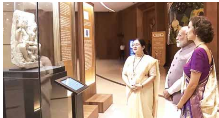
Prime Minister Narendra Modi watches exhibition during the inauguration of the 46th Session of World Heritage Committee, at Bharat Mandapam, in New Delhi, Sunday