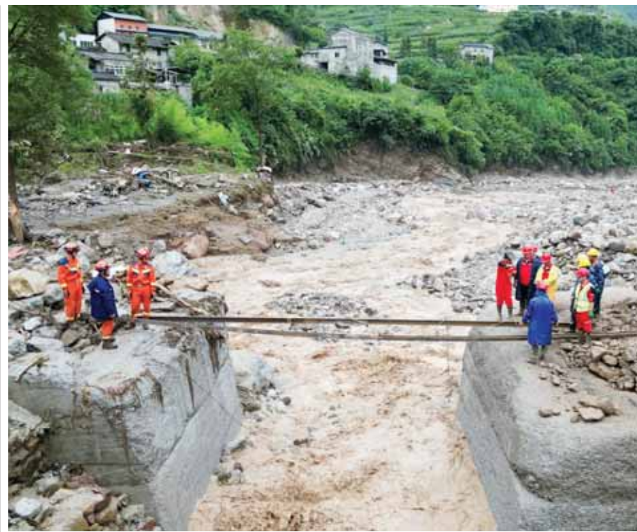
In this image made from video released by Xinhua News Agency, rescue workers set up a temporary crossing in the aftermath of floods in Xinhua Village of Hanyuan County, Ya'an City, southwest China's Sichuan Province, July 20

Department said, adding, "The department allowed for the voluntary departure of non-emergency US government employees and family members." "The Government of Bangladesh has declared a curfew throughout Bangladesh, ordering everyone to stay indoors. The Bangladeshi Army has been deployed throughout the country to reinforce the police. Telecommunications have been interrupted in Dhaka and across the country. Due to the security situation, there may be a delay in provision of routine consular services," the advisory stated. The US State Department said crimes such as muggings, burglaries, assaults, and illegal drug trafficking constitute the majority of criminal activity in Bangladesh's major cities, but there are no indications foreigners are being targeted because of their nationality. These crimes tend to be situational, based on time and location, it said.