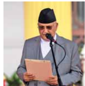
Newly elected Prime Minister Khadga Prasad Oli is being sworn in by president Ram Chandra Paudel, unseens, at the Presidential residence in Kathmandu, Nepal

Oli, 72, succeeds Pushpa Kamal Dahal 'Prachanda,' who lost the vote of