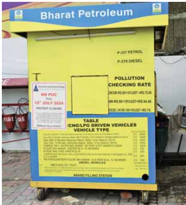
View of a petrol pump, in New Delhi, on Monday. Around 600 Pollution Under Control (PUC) centres across 400 petrol pumps in the national Capital will remain closed from Monday in response to a protest call by petrol dealers and pump owners

This revision is necessary to ensure that pollution checking stations can continue to operate efficiently and provide quality services to the