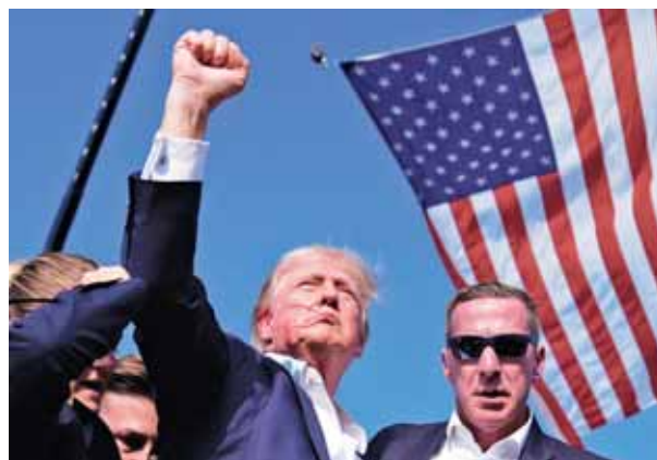
Republican presidential candidate former President Donald Trump reacts as he is surrounded by US Secret Service agents at a campaign rally, in Butler