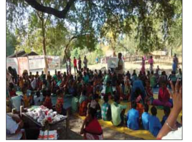
percent of malaria cases. There has been a 50 percent reduction in cases in the Bastar division, from 16.49 percent to 7.78 percent. In the first half of 2024, 1,660 cases were reported in Bastar district, 4,441 in Bijapur, 1,640 in Dantewada, 259 in Kanker, 701 in Kondagaon district, 1,509 in Narayanpur district and 1,144 in Sukma.

Dantewada, Bijapur and Narayanpur districts of Bastar division account for about 62