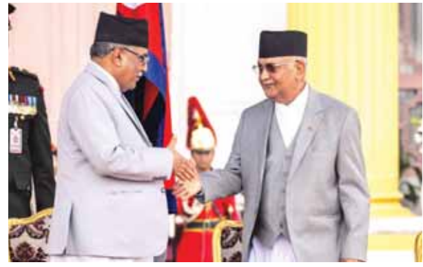
Outgoing Prime Minister Pushpa Kamal Dahal (left) congratulates newly-elected Prime Minister Khadga Prasad Oli (right) after the oath of office at the Presidential residence in Kathmandu on Monday.

KP Sharma Oli on Monday was sworn in as Nepal's Prime Minister for the fourth time to lead a new coalition government that faces the daunting challenge of providing political stability in the Himalayan nation. The leader of Nepal's largest communist party was appointed as prime minister on Sunday by President Ram Chandra Paudel to lead the coalition government with the Nepali Congress (NC), the largest party in Parliament, apart from other smaller parties. Oli, 72, succeeds Pushpa Kamal Dahal 'Prachanda', who lost the vote of confidence in the House of Representatives (HoR) on Friday, leading to the formation of the new government. Chairman of the Communist Party of Nepal-United Marxist Leninist (CPN-UML), Oli was sworn in by President Paudel at Shital Niwas, the main building of Rashtrapati Bhawan at a ceremony that was delayed by more than half an hour. According to the news portal MyRepublica, the swearing-in ceremony was delayed due to the failure of the Nepali Congress to finalise the names