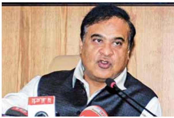
Assam Chief Minister Himanta Biswa Sarma addresses the media, in Guwahati

"We conducted outreach programmes in the Barak valley and approached many-Hindu Bengali families and asked them to apply for citizenship under CAA. However, they refused to do so. The Assam Chief