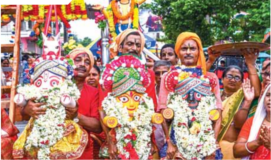
Devotees carry idols of Lord Jagannath, Balabhadra and Subhadra on the occasion of Ulta Rath Yatra in Nadia