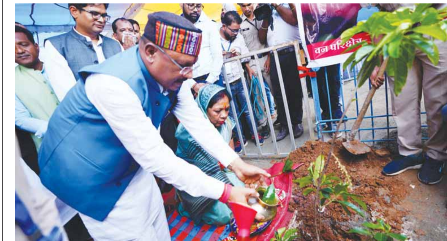
Under the 'Ek Ped Maa Ke Naam' campaign, an initiative by Prime Minister Narendra Modi, Chhattisgarh Chief Minister Vishnu Deo Sai on Friday planted a sampling of Rudraksh in his village Bagiya.