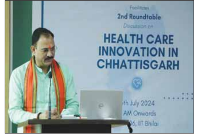
developing new technologies to improve healthcare. He spoke about the medical drone delivery facility in Ambikapur and the introduction of robotic surgery in Dr. Bhimrao