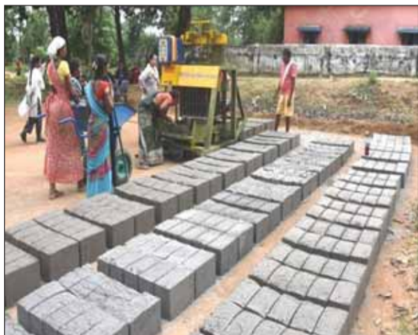
has immensely benefited the women as they now operate the machine themselves. The state government's

prioritization of the Pradhan Mantri Awas Yojana has increased the demand for bricks in rural areas.