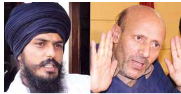
Sikh preacher Amritpal Singh and Kashmiri leader Sheikh Abdul Rashid

Jailed radical Sikh preacher Amritpal Singh and Kashmiri leader Sheikh Abdul Rashid, who were granted parole to take oath as members of the Lok Sabha, were sworn in as MPs on Friday, amid heavy deployment of security personnel in and around the Parliament complex. While Rashid, popularly known as Engineer Rashid, is in Delhi's Tihar jail in a terror-funding case registered under the Unlawful Activities (Prevention) Act, Singh is lodged in a prison in Assam's Dibrugarh district for offences under the National Security Act. They were brought to the Parliament complex by