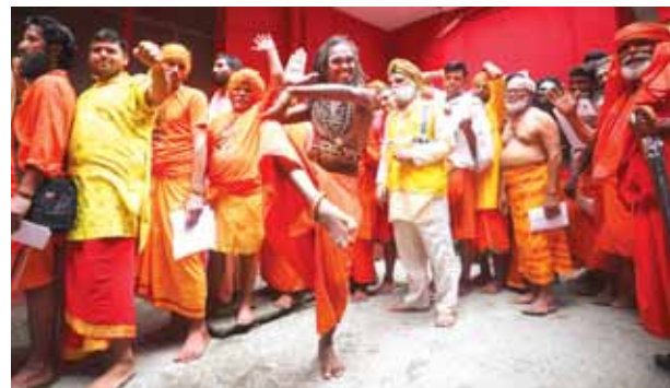
A sadhu poses while waiting to get registered for Amarnath Yatra at Ram Mandir base camp, in Jammu, on Friday