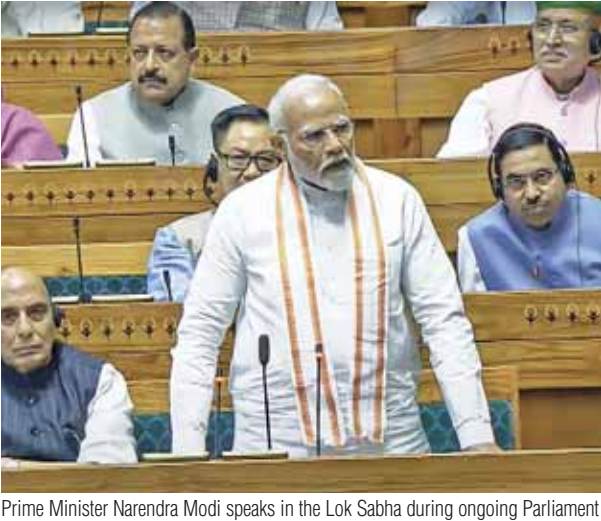
Session, in New Delhi, on Monday

by the Opposition cannot drown the fact that the words —"those who call themselves Hindus indulge in violence" — were used in the House.