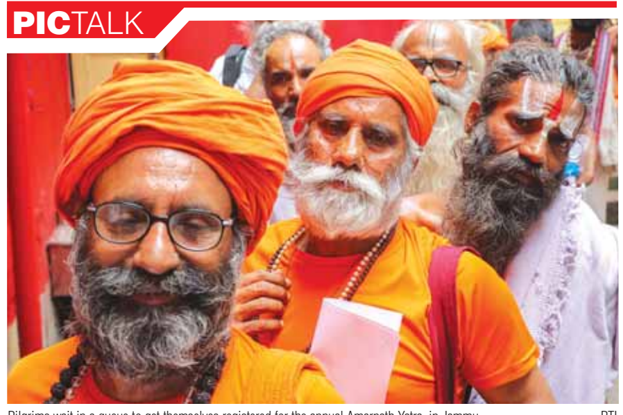
Pilgrims wait in a queue to get themselves registered for the annual Amarnath Yatra, in Jammu

departure is Bharatiya Sakshya Adhiniyam which replaces the Indian Evidence Act and seeks to modernise the rules of evidence in line with contemporary technological advancements. A significant change is the new stance on electronic evidence. Last but not the least, the Bharatiya Nagarik Suraksha Sanhita, replacing the CrPC, introduces several changes aimed at streamlining criminal procedures. The new law redefines the use of handcuffs and expands the scope of police custody beyond the initial 15 days, a change that has sparked considerable concern regarding potential misuse and the risk of increased custodial violence. So far, the legal fraternity has been rather jittery about the new laws. Prominent legal luminaries, State Bar Councils, and Bar Associations have expressed apprehensions about the potential implications of these changes. Chief Justice of India DY Chandrachud has commented that the new laws could create a positive impact only if there are concurrent investments in infrastructure development and capacity building for forensic experts and investigating officers. The expanded powers of the police and the handling of electronic evidence are areas of particular concern, highlighting the need for careful implementation and oversight to ensure that the new laws do not lead to increased misuse of power or injustice.