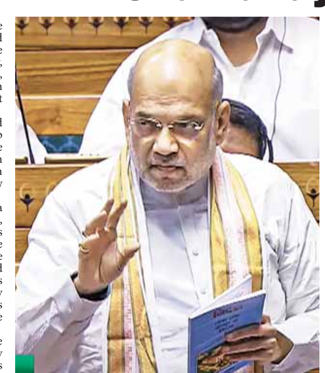
Union Home Minister Amit Shah speaks in the Lok Sabha during ongoing Parliament session, in New Delhi, on Monday

The Home Minister said the laws would be applicable to cases occurring on or after July 1, 2024. Shah said the first case under the new laws was about a motorcycle theft registered in Madhya Pradesh's Gwalior at 10 Madhya