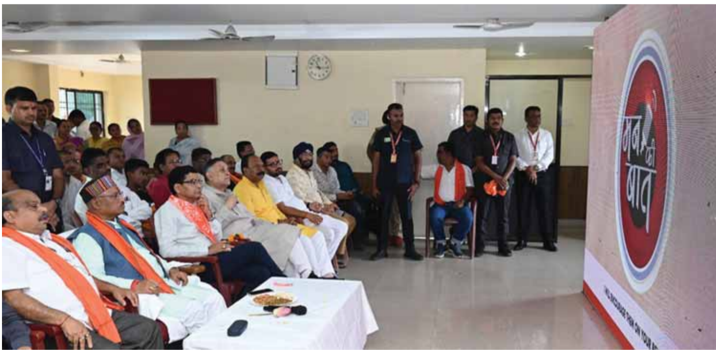
Chhattisgarh Chief Minister Vishnu Deo Sai on Sunday listened to the "Man Ki Baat" programme of Prime Minister Narendra Modi at Swadeshi Bhawan in Shanti Nagar in Raipur. The talk is held on every last Sunday of the month.

Established in 1985, NSS has provided over 41,000 artificial limbs.