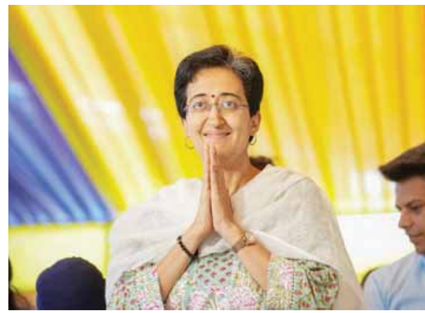
directed to identify those who lost their lives with the support of area hospitals and Delhi Police - and immediately provide them aforementioned compensation on behalf of GNCTD," she added.

Water Minister Atishi announced that the Delhi government will provide a compensation of Rs 10 lakh to the families of those who drowned due to heavy rain in the city on Friday. In an official communication to the revenue department, minister Atishi said it has been reported that there were "several deaths" due to drowning on Friday, after the extreme rainfall. "It is hereby directed that the families of all those who lost their lives shall be provided a compensation of Rs 10 lakh," Atishi said in the order. "ACS Revenue is hereby