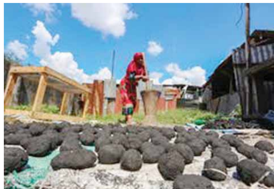
were held on NVVNL's initiative to produce green coal from solid waste. It is noteworthy that green coal, also known as bio-coal, is a sustainable alternative to traditional waste, as it can be blended with regular coal for electricity generation in thermal power plants. NVVNL recently established a plant in Varanasi to produce green coal from solid waste. Once fully operational, this plant will consume 600 tons of waste and produce 200 tonnes of green coal, leaving very little residue. NVVNL is also working in various stages to set up green coal plants in Haldwani, Vadodara, Noida,

Haryana is soon to get waste-to-charcoal plants, also known as green coal plants. An MoU for this plant will be signed between NTPC Vidyut Vyapar Nigam Limited (NVVNL) and the Haryana Government soon. After setting up the plants in Gurugram-Manesar and Faridabad, this initiative will be expanded to other cities in Haryana. NVVNL officers will soon visit a few sites to establish green coal plants. The district administration spokesperson said that to implement these plants, a meeting was held at Shram Shakti Bhawan in New Delhi, chaired by Minister, Manohar Lal. The government is highly committed to reducing the problem of the increasing quantity of municipal solid waste and using it beneficially for renewable energy production. During the meeting on waste-to-energy, detailed discussions