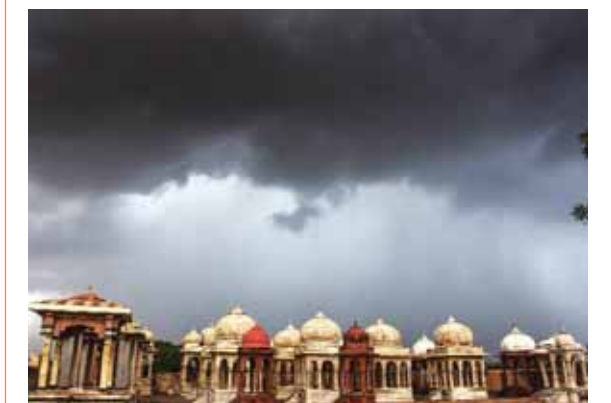
Dark clouds hover in the sky above Royal Cenotaphs at Devi Kund Sagar, in Bikaner