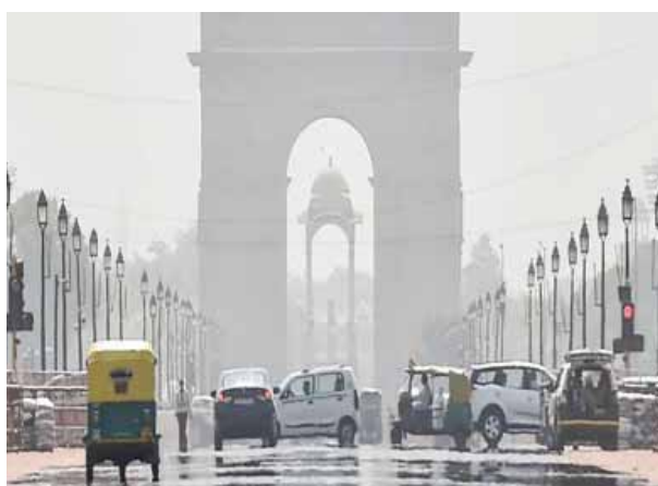
Palam at 37 degrees, Ridge at 36.3 degrees, Pitampura at 38.2 degrees, Pusa at 36.5 degrees, Salwan Public school at 36.2 degrees and Jafarpur at 37.3 degrees. The Air Quality Index (AQI) of the national capital was in the "moderate" category with a reading of 118 at 6 pm, according to the Central Pollution Control Board.

The national capital recorded a maximum temperature of 37.1 degrees Celsius on Sunday, a couple of days after Delhi was lashed by 228.1 mm of rains, bringing the city to its knees and claiming multiple lives. Delhi's primary weather station Safdarjung recorded 37.1 as the maximum temperature, 0.3 degrees below the normal. The minimum temperature settled at 27 degrees, a notch below the normal. The feel like temperature or heat index for the national capital was 44 degrees Celsius. According to the weather department, 9 mm of rain was recorded in the city on Sunday, while humidity was 78 per cent at 8:30 am and 60 per cent at 5:30 pm. Additionally, Najafgarh recorded its maximum temperature at 36.3 degrees Celsius, Aya nagar at 37 degrees, Lodi road at 36.6 degrees,