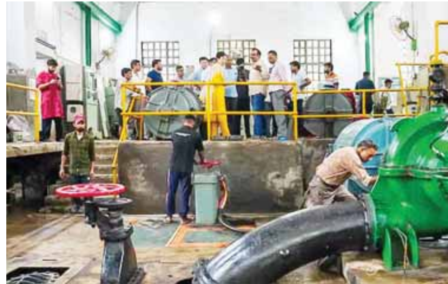
Delhi Water Minister Atishi led an inspection of the Chandrawal Water Treatment Plant's pump house on Sunday morning. "It's noteworthy that Delhi received unexpected rainfall recently. Normally, Delhi receives 800 mm rainfall during the entire monsoon season, but two days ago, 228 mm rainfall occurred in just 24 hours," she said, adding that the water entered the pump house located at Chandrawal Water Treatment Plant. "Due to this, the motors of the pump house had been damaged. Through this pump house, water is supplied to many areas of central Delhi, but due to damage to the motors of the pump house, the supply was disrupted in these areas," she said, adding that the repair of the motors has been completed and the water supply will also become normal. Along with this, Atishi directed the officials that all the concerned departments including Delhi Jal Board (DJB), Urban Development Department to do a joint inspection of the plant and prepare a plan on that basis so that

Delhi Minister Atishi on Sunday instructed officials to repair the pump house at the Chandrawal Water Treatment Plant and increase the capacity of the pump house at the Minto Bridge underpass that was flooded due to heavy rains and ensure that such problems do not recur. In a post in Hindi on X (formerly Twitter) after inspecting the Chandrawal water treatment plant, she said that unexpected rains flooded the pumping house of the Chandrawal Water Treatment Plant, damaging the motors. "Due to this, (water) supply was disrupted in many parts of Central Delhi. Jal Board has worked quickly to resolve this problem and the plant has almost 80 per cent been repaired. Water supply will be back to normal soon," Atishi said. "Inspected the plant today and ordered officials to repair the pump house as soon as possible, and with joint inspection ensure that this problem does not recur in any plant in the future," she said.