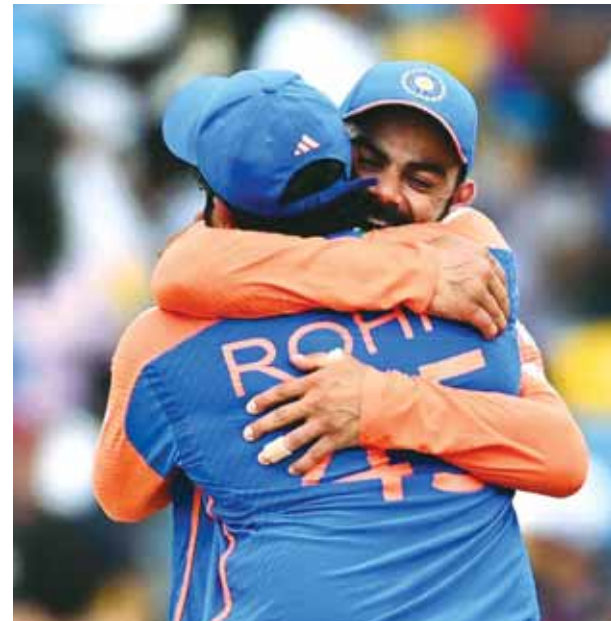
Rohit Sharma embraces Virat Kohli after India's T20 World Cup win

The confetti shimmered like a thousand dreams realized, raining down on Virat Kohli and Rohit Sharma as they held aloft the T20 World Cup trophy gleaming under the floodlights of Kensington Oval in Barbados. Virat and Rohit walked up to the microphone to give their victory speeches and a different kind of farewell on a night where billions of emotions were high after the triumph final. While receiving the Man of the Match award for his crucial innings of 76 of 39 balls, Virat said, "This was my last T20 World Cup, this is exactly what we (Indian Cricket Team) wanted to achieve, now it's time for the next generation to take over." After receiving the medals and awards, Rohit Sharma also announced his retirement officially. While addressing the post match conference Sharma said, "That was my last game as well. Honestly I have enjoyed it since the time I started playing this format. There's no better time to say good bye to this format, winning the World Cup is what I wanted." India's star all-rounder Ravindra Jadeja also hung up his boots from T20 Internationals. Kohli has always been the star performer for India from his debut 2012 World Cup.