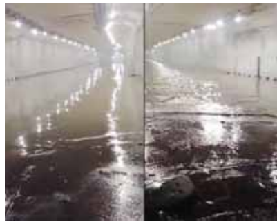
underpass due to waterlogging. Kindly plan your journey accordingly." The closure of the underpass has caused problems for regular commuters, increasing their travel times.

The Delhi Traffic Police restricted vehicular movement in the Okhla underpass due to waterlogging and asked commuters to accordingly plan their journeys while Pragati Maidan tunnel opened on Sunday evening as monsoon fury wreaked havoc in the national capital on Friday. The move to keep the Okhla underpass closed comes after a 60-year-old man drowned in the underpass on Saturday. The national capital experienced heavy rainfall on Friday and Saturday, leading to waterlogging and massive traffic jams in several parts of the city. In a post on X, the traffic police said, "Movement of traffic is restricted at Okhla