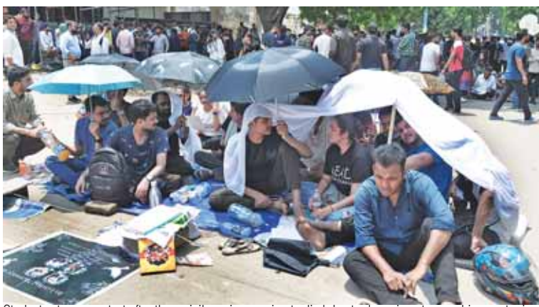
Students stage a protest after three civil services aspirants died due to drowning at a coaching centre in Old Rajinder Nagar area, in New Delhi on Tuesday