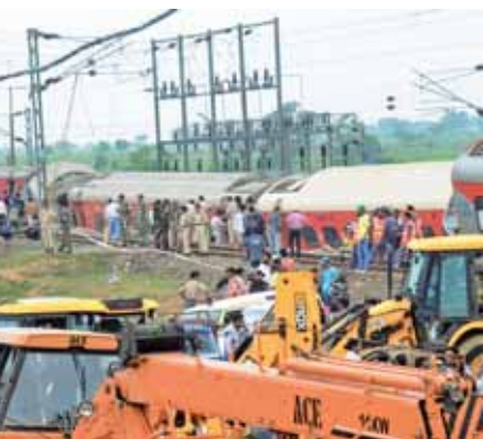
Rescue work underway after the Howrah-Mumbai Mail derailed near Badabambo, in Seraikela-Kharsawan district of Jharkhand, early Tuesday. At least two people were killed in the accident, according to officials

district. According to environmentalists, Tuesday's disaster is yet another proof that the State administration has not learnt anything from past mistakes. Wayanad has no representative in Parliament as Rahul Gandhi, the Leader of Opposition who was elected from the constituency, gave it up immediately after the 2024 Lok Sabha poll to retain Rae Bareilly. Besides the dead bodies, the rescue teams came across mutilated parts of human bodies which were crushed by huge rocks and stones spewed with force by the landslides. At the time of going to the Press, only less than half of the dead bodies have been identified. Continued on Page 8