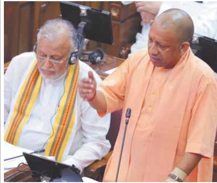
Chief Minister Yogi Adityanath addressing the monsoon session of the Uttar Pradesh Legislative Assembly in Lucknow on Tuesday