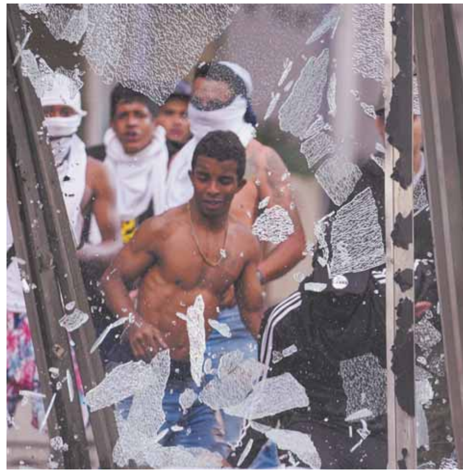
Protesters smash an advertising board during demonstrations against the official election results declaring President Nicolas Maduro's reelection, the day after the vote in Caracas, Venezuela on Monday.

a dance class," she wrote on Instagram. "I am at a complete loss for how to ever convey my sympathies to these families." A 17-year-old boy was arrested on suspicion of murder and attempted murder. Local people left flowers and stuffed animals in tribute at a police cordon on the street lined with brick houses in the seaside resort near Liverpool – nicknamed "sunny Southport" – whose beach and pier attract vacationers from across northwest England. Witnesses described scenes "from a horror movie" as bloodied children ran from the attack just before noon on Monday.