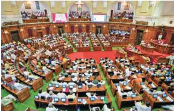
Uttar Pradesh Finance Minister Suresh Khanna presents a supplementary Budget in the presence of Chief Minister Yogi Adityanath and other members during the Monsoon Session of State Legislative Assembly at Vidhan Bhawan, in Lucknow, on Tuesday

The Uttar Pradesh Assembly on Tuesday passed the UP Prohibition of Unlawful Conversion of Religion (Amendment) Bill, 2024 that provides for a maximum punishment of life imprisonment, making the law stricter in cases of fraudulent or forced conversion. Parliamentary Affairs Minister Suresh Khanna introduced the Uttar Pradesh Prohibition of Unlawful Conversion of Religion (Amendment) Bill, 2024 in the House on Monday. The move, however, has drawn severe criticism from the Opposition. Earlier the maximum punishment provided for those found guilty of marrying a woman by deceiving and changing her religion was 10 years with a fine of ₹50,000. According to the new provisions, if any minor,