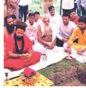
removing encroachment. The corridor will be constructed in almost the same area as the present premises of the temple and the park in front. There are currently two gates to enter the temple. After the construction of the corridor, there will be six gates, then entry will be from Akshayvat Marg. When the devotees leave after bathing in Sangam, they will enter the temple corridor