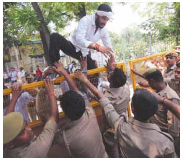
NSUI members scuffle with police personnel in Lucknow