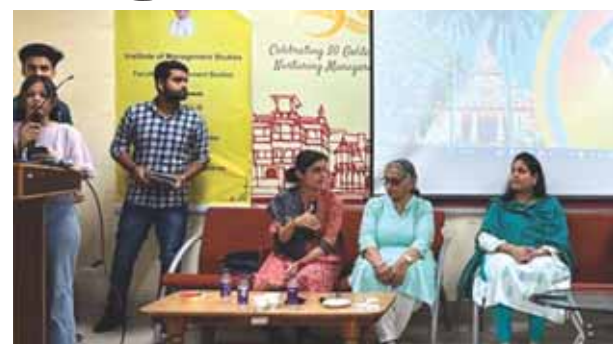
FLY workshop being held at IM-BHU in Varanasi on Tuesday.