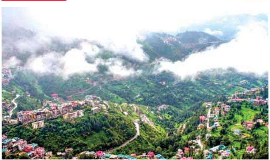
Clouds hover over the hill town of Shimla