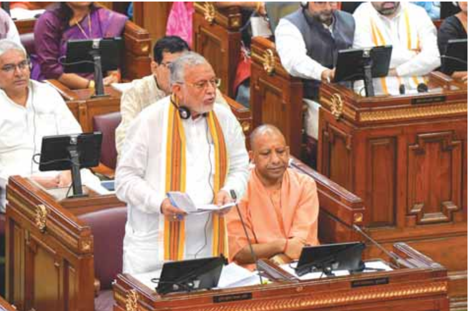
UP Finance Minister Suresh Khanna presents a supplementary budget in the presence of Chief Minister Yogi Adityanath and other members during the Monsoon session of state Legislative Assembly at Vidhan Bhawan in Lucknow on Tuesday