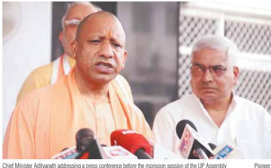
Chief Minister Adityanath addressing a press conference before the monsoon session of the UP Assembly