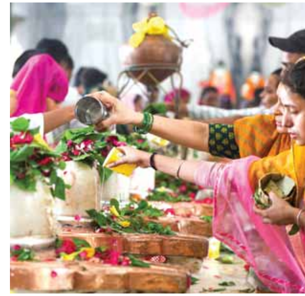
Devotees performing 'jalabhishek' of Lord Shiva at a temple on the second 'Somwar' of the holy Shravan month in Prayagraj on Monday.

There was a long queue of devotees in Mankameshwar Temple located at Saraswati Ghat since morning. A large number of police and women police were deployed here for