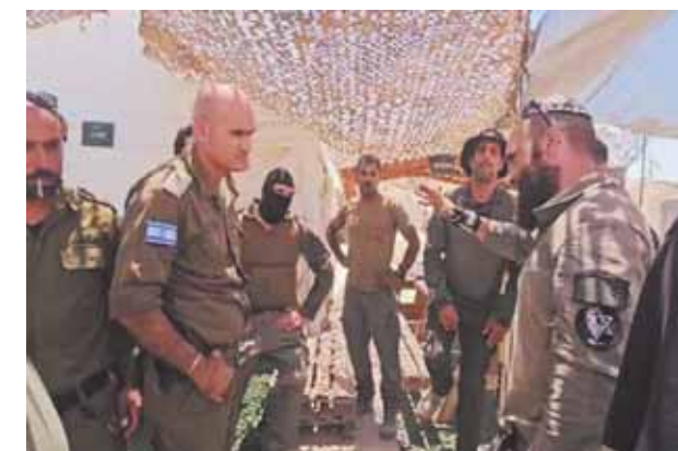
A heated argument erupts between soldiers at the Sde Teiman detention facility in southern Israel after Military Police investigators arrived to detain suspects for questioning.

A report by the United Nations agency for Palestinian refugees, UNRWA, earlier this year said that detainees alleged they were subjected to ill-treatment and abuse while in Israeli custody, without specifying the facility.