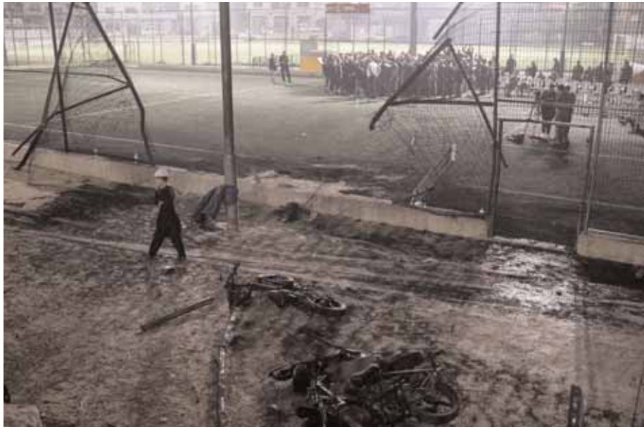
A boy walks past bicycles left next to the area that was hit by a rocket on a soccer field in the Druze town of Majdal Shams, in the Israeli-annexed Golan Heights, Saturday, July 27, 2024. A rocket strike Saturday at a soccer field killed at least 11 children and teens, Israeli authorities said, in the deadliest strike on an Israeli target along the country's northern border since the fighting between Israel and the Lebanese militant group Hezbollah began. It raised fears of a broader regional war.

A rocket strike on Saturday at a soccer field killed at least 12 children and teens, Israeli authorities said, in the deadliest strike on an Israeli target along the country's northern border since the fighting between Israel and the Lebanese militant group Hezbollah began. It raised fears of a broader regional war. Israel blamed Hezbollah for the strike in the Israeli-controlled Golan Heights, but Hezbollah rushed to deny any role. Israeli Prime Minister Benjamin Netanyahu warned that Hezbollah "will pay a heavy price for this attack, one that it has not paid so far". The Israeli military's chief spokesman, Rear Adm. Daniel Hagari, called it the deadliest attack on Israeli civilians since the Hamas attack on October 7 that sparked the war in Gaza. He said 20 others were wounded. "There is no doubt that Hezbollah has crossed all the red lines here, and the