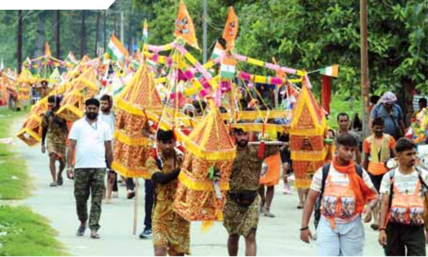
'Kanwariyas' carry Ganga water during their pilgrimage in the holy month of 'Shravan', in Haridwar