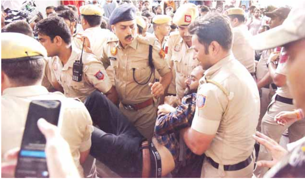
Police detain students protesting outside Karol Bagh metro station after three IAS aspirants died in the basement of Rau's IAS Study Circle at Old Rajinder Nagar area, in New Delhi, on Sunday

Phones kept buzzing with messages on WhatsApp groups with helpless students trying to find where their friends — studying at the Rau's Coaching centre's library on Saturday evening — were following the death of three civil services aspirants due to rain-induced flooding in the basement of the coaching centre. While reports claimed only three lives were lost, students who were witness to the tragic incident unfolding before their eyes claimed a higher number. All the deceased had cleared their preliminary examination, the results of which was declared a few days ago and were burning midnight oil to prepare for the Mains examinations scheduled in October-November which is second stage of Civil Services Examinations to qualify to become an IAS, IPS or allied services officer. Thousands like the ones who fell prey to lackadaisical civic amenities make national Capital their karambhoomi for a few years to get into elite Government services. "We have WhatsApp groups of UPSC aspirants. Those groups are full with students asking about the whereabouts of their friends. I am sure that the numbers are much higher