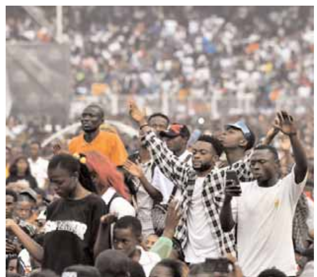
Local music management company that organised the event said the chaos erupted when "the security services