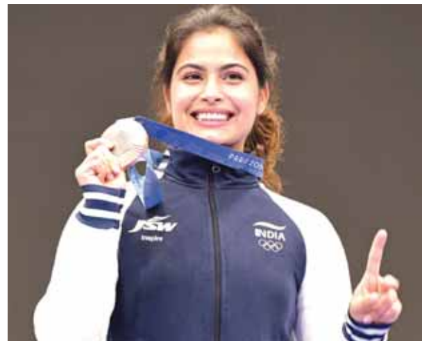
Manu Bhaker poses for a photograph with her bronze medal after finishing third in the 10m air pistol women's final round at the 2024 Summer Olympics, France, on Sunday

A 22-year-old Haryana girl clinched the first medal for India. Manu Bhaker strikes the bronze medal in Women's 10m Air Pistol event in Paris Olympics in 2024. With her medal she becomes the first female shooter to win medal for India in Olympic games. On July 27 Manu Bhaker had qualified for the final of her event with a score of 580 points, finishing third out of 45 competitors with the top-eight going through to Sunday's final. Bhaker scored 221.7 in the final round in which she fought hard against Korea's Kim Yeji who bagged silver and Jin Ye Oh bagged the gold with a games record of 243.2. Bhaker stated, "I was fighting with all the energy I have. Really grateful that I could win the bronze. I read Bhagwat Gita and always tried to do what I am supposed to do, left everything else to god." "We can't fight destiny," said Bhaker who appeared in her second Olympic stint. Previously she couldn't make it to the final and registered a bronze in this 2024 Olympic ending a drought in Olympic event.