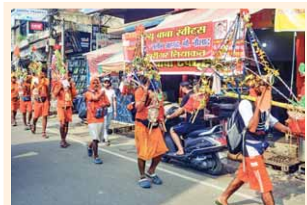
Karnwariyas walk past the shops on which banners with shopkeepers' name were put up on Kanwar Marg after an order issued by Uttar Pradesh Government, in Muzaffarnagar

"The re-revised score cards are live now," a senior NTA official said. Forty-four out of the 67 candidates who were earlier declared toppers had scored full marks because of the marks awarded for that particular physics question. The number of toppers was later reduced to 61 with the agency withdrawing grace marks awarded to six candidates to make up for loss of time at few exam centres. In a major setback to unsuccessful aspirants of NEET-UG 2024, the Supreme Court on Tuesday dismissed the pleas seeking cancellation and re-test of the controversy-ridden exam, holding that there was no evidence on record to conclude that it was "vitiated" on account of "systemic breach" of its sanctity. The verdict came as a shot in the arm for the embattled NDA Government and the NTA, which were facing strong criticism and protests, on streets and in Parliament, over alleged large-scale malpractices like question paper leak, fraud and impersonation in the prestigious test held on May 5. The CBI is probing alleged irregularities in NEET-UG 2024 and has lodged six FIRs. The NEET-UG is conducted by the National Testing Agency for admissions to MBBS, BDS, AYUSH and other related courses in Government and private institutions.