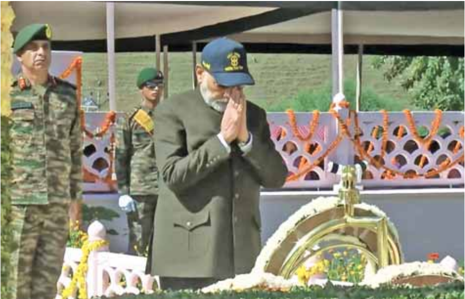
Prime Minister Narendra Modi pays homage at the Kargil War Memorial on the occasion of the 25th anniversary of the 'Kargil Vijay Diwas', in Dras, on Friday