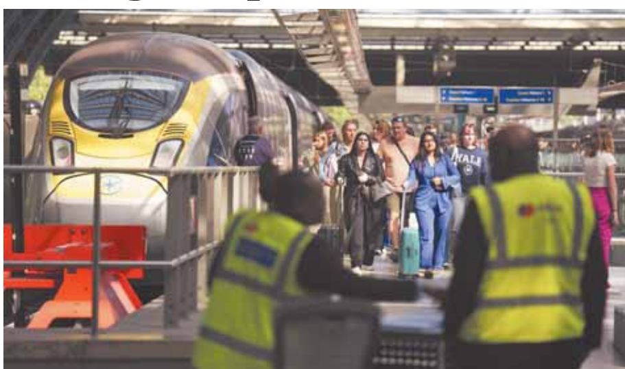
Passengers arrive by train at the Eurostar terminal at St Pancras station in central London, on Friday July 26