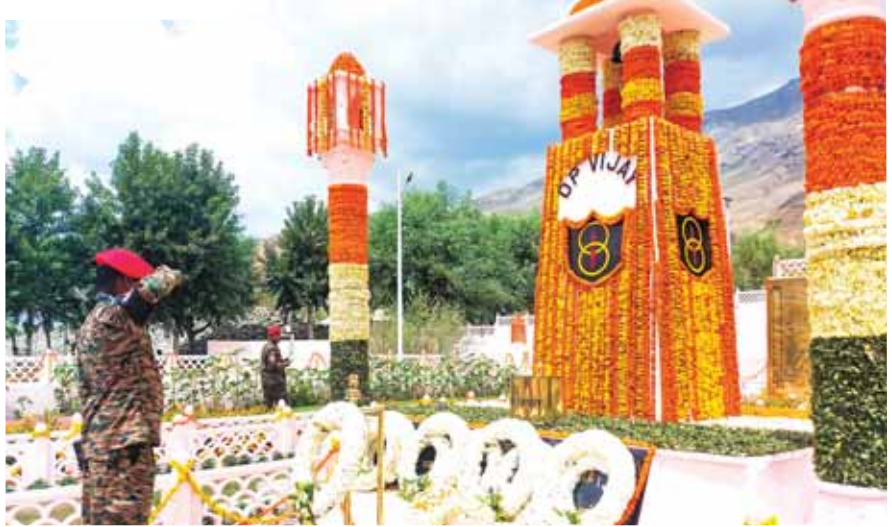
A soldier pays homage at the Kargil War Memorial on the 'Kargil Vijay Diwas', in Drass