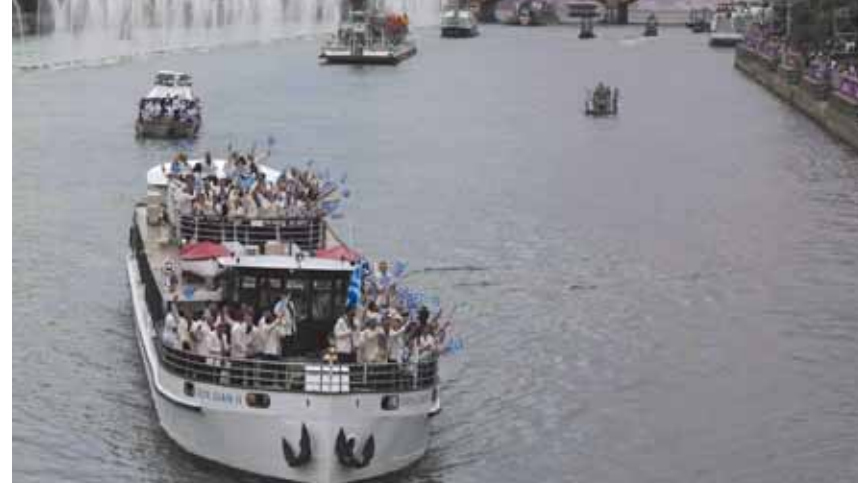
(Above) Smoke in the colours of the French flag billows in Paris during the opening ceremony of the 2024 Summer Olympics on Friday. (Left) Team Greece travel by boat along the Seine River in Paris during the opening ceremony and (Right) Indian Badminton player PV Sindhi, arrives with others to board the boat for the opening ceremony of the 2024 Summer Olympics