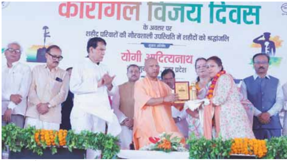
Uttar Pradesh Chief Minister Yogi Adityanath honoured the families of the martyrs at the felicitation ceremony organised during the Kargil Vijay Diwas programme in Lucknow on Friday

Chief Minister Yogi Adityanath said on Friday that the world recognised the indomitable valour and courage of Indian soldiers during the Kargil War. Speaking at the silver jubilee celebration marking the 25th anniversary of Kargil Vijay Diwas at Surya Auditorium of Central Command, in Cantonment here, Yogi remarked that the Kargil War was imposed on India. "Pakistan had covertly infiltrated Kashmir, imposing war on India. However, the outcome of the war was determined by our brave soldiers. Despite facing adverse circumstances, no enemy could stand against the valour of our soldiers," he said. The chief minister further stated, "I take immense pride in honouring the courageous women and families who have lost their loved ones in the Kargil War." He emphasised that India's global identity is not that of a country that forcefully monopolizes. Yogi highlighted that Indian tradition holds "Shastrena rakshite rashtr chinta pravartate," meaning that contemplation of 'shaashtra' (scriptures) is possible only in a nation safeguarded by arms. He remarked, "Even when India was a global leader in strength, intelligence and knowledge, we never initiated aggression. However, when invaders dared to disrupt our peace and goodwill, our brave soldiers made the