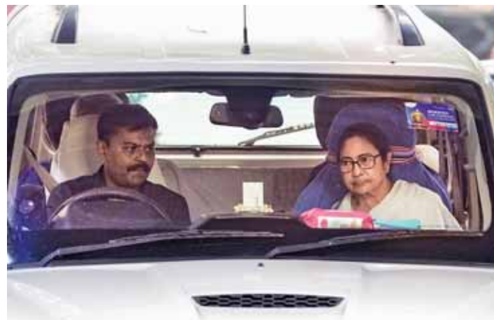
West Bengal Chief Minister Mamata Banerjee arrives at Banga Bhawan, in New Delhi, on Friday

The first meeting of NITI Aayog in the third tenure of Narendra Modi as Prime Minister is to see a "boycott call" by several non-BJP ruled Chief Ministers on Saturday. The meeting to be chaired by Modi will, however, be attended by West Bengal Chief Minister Mamata Banerjee who albeit has called for scrapping of the NITI Aayog and replace it by Planning Commission. Apart from Congress and its alliance-ruled States like Jharkhand, which are part of the INDIA Bloc, declining to attend the crucial meet in the national Capital, Delhi, Punjab, and Kerala have also announced they will not be part of the meeting. Karnataka CM Siddaramaiah, Himachal Pradesh CM Sukhvinder Singh Sukhu and Telangana's Revanth Reddy have announced they will not attend the meeting over alleged bias against their States in the Union Budget. Tamil Nadu Chief Minister and DMK leader MK Stalin, Kerala's CM and CPI(M) leader Pinarayi Vijayan as well as Aam Aadmi Party (AAP)-led Delhi and Punjab Governments too called to boycott the meeting.