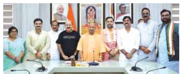
Public representatives of Lucknow division paid a courtesy visit to Uttar Pradesh Chief Minister Yogi Adityanath at his official residence in Lucknow on Friday

Uttar Pradesh Chief Minister Yogi Adityanath, on Friday, concluded the extensive review meetings with public representatives from all 18 divisions of the state, focusing on the results of Lok Sabha elections. Over the past 20 days, MLAs, MLCs and MPs from each division presented the issues and expectations of their constituencies to the chief minister. Yogi held the meetings with the public representatives to have first-hand account for the cause of the setback suffered by the party during the recently concluded Lok Sabha elections. Yogi started the divisional review meetings from July 7 with a meeting with the MLAs from Devipatan and Ayodhya divisions. The meetings concluded on Friday after the chief minister met the representatives of Lucknow division. The meetings, officially described as a 'normal feedback' exercise to discuss development projects and to collect inputs on different issues, are believed to be aimed at pacifying the MLAs and party leaders who, in recent weeks, have questioned the functioning of the state government and bureaucracy. On July 22, during his visit to Azamgarh, the CM held a meeting with the elected representatives of Azamgarh division along with senior officials. "The chief minister emphasised the need for timely and high-quality implementation of public interest and welfare schemes. He directed that development projects be monitored consistently," according to a state-