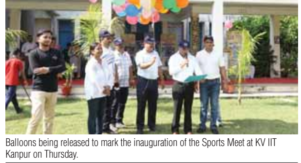
Balloons being released to mark the inauguration of the Sports Meet at KV IIT Kanpur on Thursday.

The three-day 53rd Regional Sports Competitions (Boys) started at the Kendriya Vidyalaya IIT Kanpur on Thursday. As many as 246 children and 40 escorts from 33 Kendriya Vidyalayas from Lucknow region are taking part in different sports, including basketball, badminton, lawn tennis, table tennis and swimming. The winners will be selected for the national level competitions.