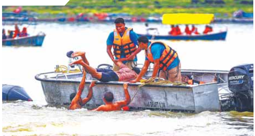
Members of the State Disaster Management Authority perform rescue operation during a mock drill, in Prayagraj