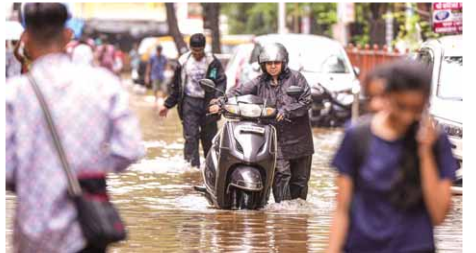
A commuter makes his way through a waterlogged road after rain, in Mumbai, on Thursday

At least three people were electrocuted in Pune and three others feared trapped under the debris of three collapsed villas in a hill slide at Lavasa, even as the heavy rains wreaked havoc in Pune, Mumbai and various parts of Maharashtra, prompting the Maharashtra Government to seek the assistance of the Army and Navy to deal with the monsoon-related incidents.