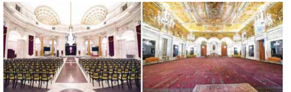
In these combo of pictures Rashtrapati Bhawan's iconic 'Durbar Hall' (left) and 'Ashok Hall' (right) have been renamed as 'Ganatantra Mandap' and 'Ashok Mandap' respectively, in New Delhi

A year after renaming the famous Mughal Gardens to "Amrit Udyan" on the premises of Rashtrapati Bhawan, efforts continue to align the iconic building with India's status as a Republic and underscore democratic principles deeply ingrained in Indian society since ancient times.