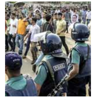
Protesters in Bangladesh

The Ministry of External Affairs (MEA) on Thursday confirmed receiving a note from Dhaka that conveyed its objection to West Bengal Chief Minister Mamata Banerjee's remarks offering shelter to people affected by violent-clashes in that country.