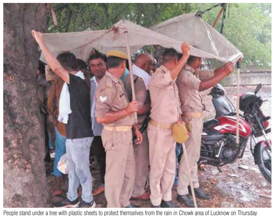
People stand under a tree with plastic sheets to protect themselves from the rain in Chowk area of Lucknow on Thursday