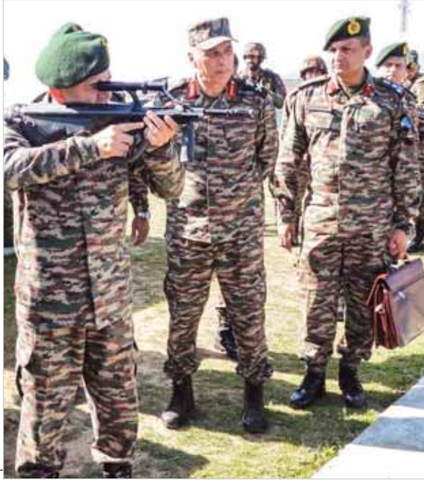
Army Chief General Upendra Dwivedi during his visit at the forward locations of Chinara Corps. Dwivedi also reviewed the security situation along the Line of Control during his visit

The security forces have been kept in a state of high alert ahead of the visit of Prime Minister Narendra Modi to attend the 25th Kargil Vijay Diwas on Friday in Drass. This will be the PM's first visit to the region after recent spate of terror attacks and also a few high-level review meetings in this regard held in the national Capital with two of them chaired by Modi himself.