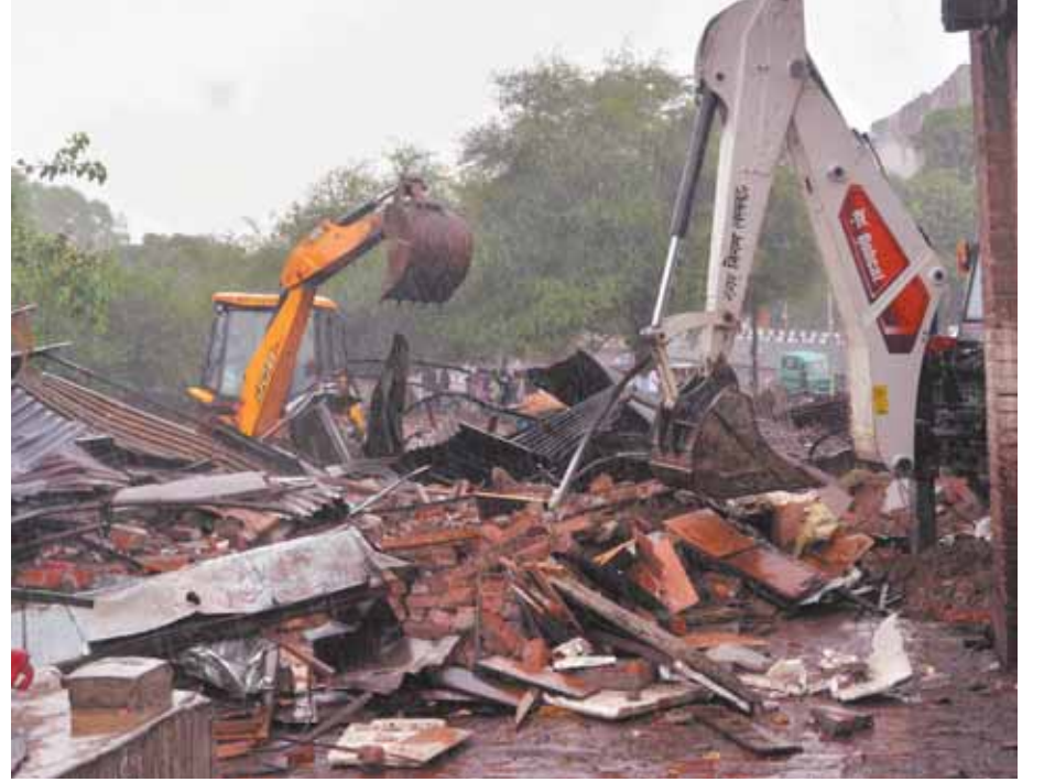
Bulldozers in action on Thursday to demolish the 'phool mandi' which had come up unauthorisedly on Hussainabad Trust land in Kanchan market area of Chowk