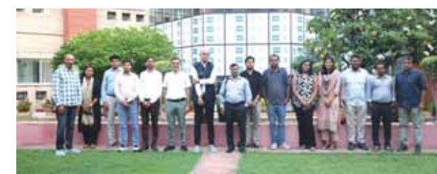
The World Bank team and others at ISARC in Varanasi on Wednesday.

The International Rice Research Institute (IRRI) organised a special brainstorming session at the Varanasi-based IRRI-South Asia Regional Center (ISARC) on Wednesday to discuss opportunities to integrate and leverage artificial intelligence (AI) and digital-based solutions in rice cultivation in Uttar Pradesh. Senior officials of the World Bank's 2030 Water Resources Group and technology companies like Microsoft, Click2Cloud etc participated in this meeting with senior scientists of ISARC. The UP government launched an AI Centre of Excellence (CoE) in Lucknow in early 2024 to support development in key sectors, including agriculture in the state and