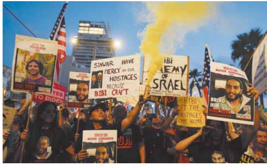
Relatives and supporters of the hostages held captive by Hamas in the Gaza Strip take part in a protest to demand their immediate release outside of the U.S. Embassy Branch Office in Tel Aviv, Israel, Wednesday.

Officials from Egypt, Israel, the United States and Qatar were expected to meet Thursday in Doha with the aim of resuming talks for a proposed three-phase cease-fire to end the war between Israel and Hamas and free the remaining hostages. But an Israeli official said Israel's negotiating team was delayed and would likely be dispatched next week.