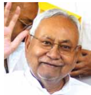
Bihar Chief Minister NITISH KUMAR

Although a "Special Package" for Narendra Modi's major allies — the JD(U) and TDP-ruled State Governments of Bihar and Andhra Pradesh was announced by Finance Minister Nirmala Sitharaman, a cryptic response by Bihar Chief Minister Nitish Kumar on the Centre's refusal of "Special Category Status" set tongues wagging throughout the day, given the senior JD(U) leader's political maneuvering over the years. "You will get to know all things slowly, and slowly," Nitish said when asked by media in Patna a day after his demand for Special Status was completely denied by the BJP-led NDA regime at the Centre. Nitish led a resolution by his party recently which reiterated firm demand Special Status Category and the conditional support to BJP on the issue. By evening, however, Nitish claimed the Budget "meets our demand for special assistance, if grant of special status was