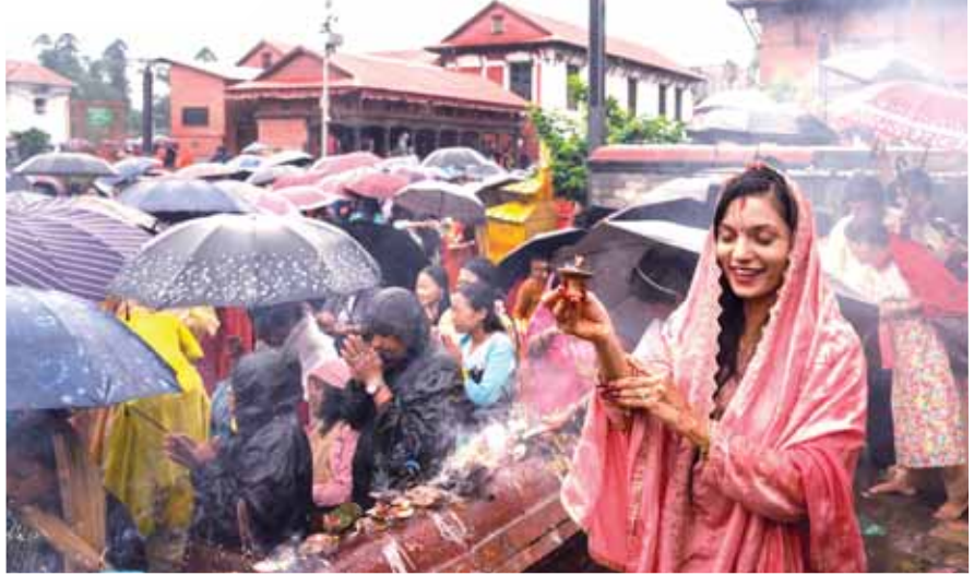
Hindu devotees offer prayers during the holy month of Shrawan at the Pashupatinath Temple in Kathmandu