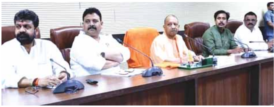
Chief Minister Yogi Adityanath reviewing progress of development work in Varanasi on Monday evening.