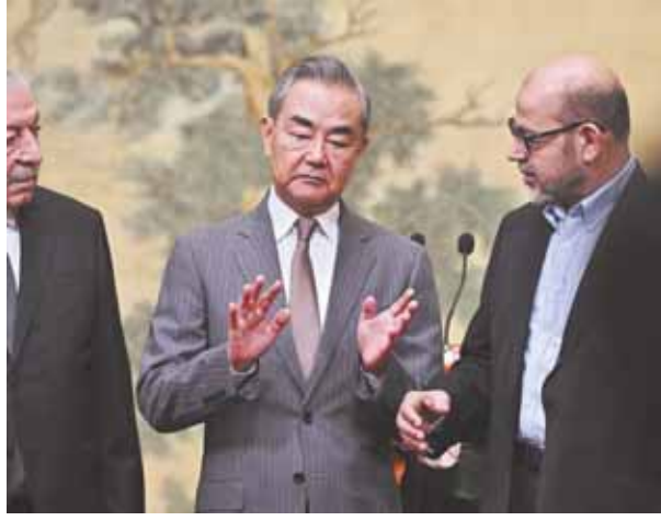
China's Foreign Minister Wang Yi, center, hosts an event for Mahmoud al-Aloul, left, vice chairman of Fatah, and Mussa Abu Marzuk, a senior member of Hamas, to meet at the Diaoyutai State Guesthouse in Beijing, Tuesday.