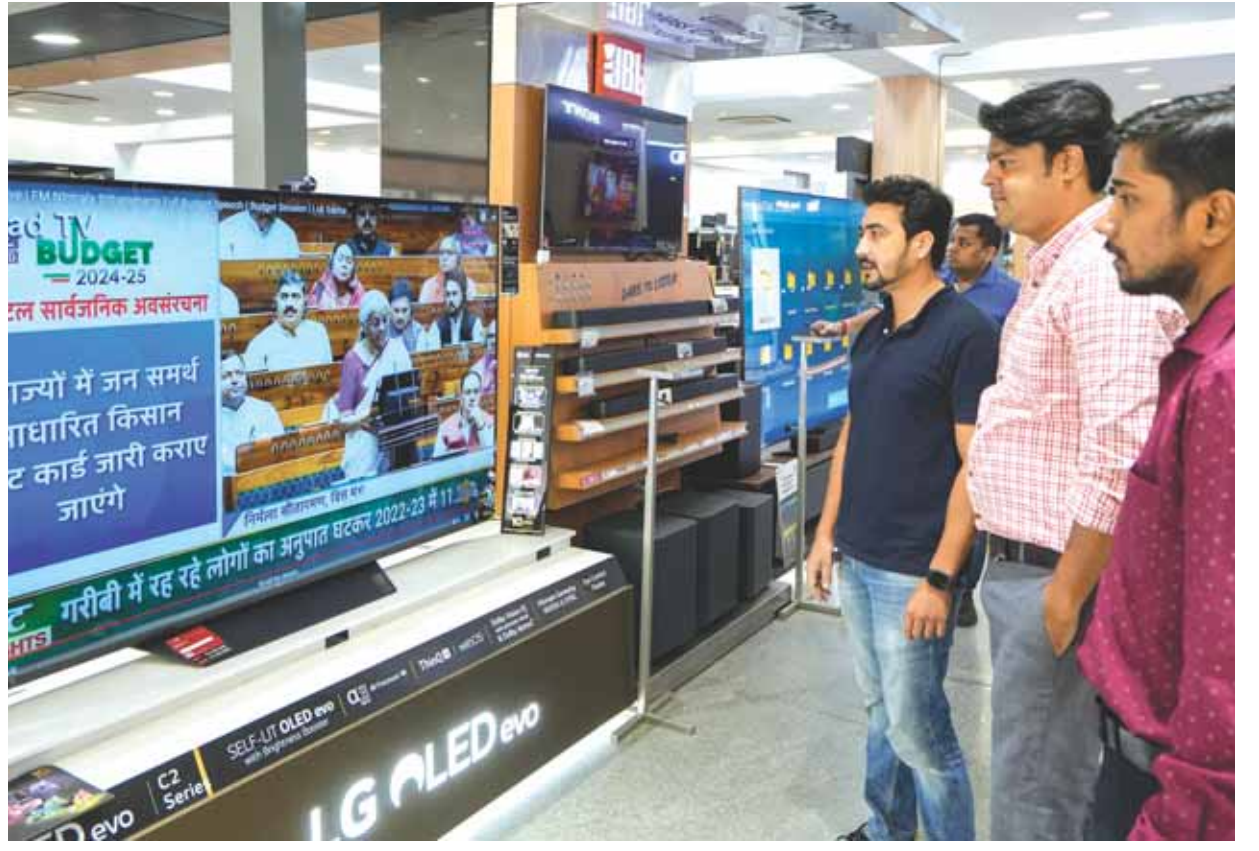
People watch live telecast of the Union Budget presentation by Finance Minister Nirmala Sitharaman in Lucknow on Tuesday