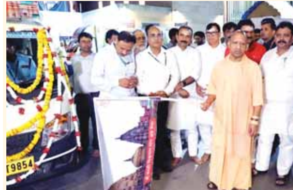
CM Yogi Adityanath flagging off Anna Seva van from KVT in Varanasi on Monday