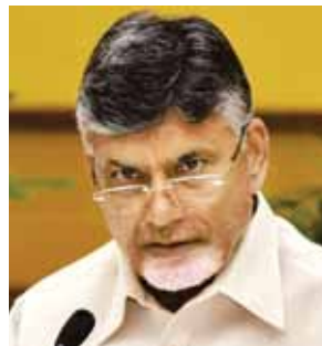
Andhra Pradesh Chief Minister CHANDRABABU NAIDU

not possible because of practical difficulties." JD(U) lashed out at the Opposition RJD-Congress-Left combine for creating a ruckus over the demand for Special Status "forgetting that the UPA, of which they were a part, had rejected demand while it was ruling the Centre". "We were speaking of Special Status, and a lot of people said the provision for Special Status has been done away with much earlier. So, instead of that, aid should be given to help development in Bihar. Now, they have begun doing"