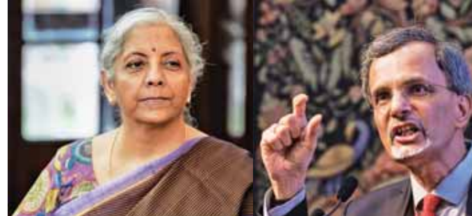
Chief Economic Advisor V Anantha Nageswaran addresses a Press conference after tabling of the Economic Survey 2023-24 in Parliament by Union Finance Minister Nirmala Sitharaman, in New Delhi, on Monday

performance. Improved balance sheets will help the private sector cater to strong investment demand. The Survey also added a note of caution saying "private capital formation after good growth in the last three years may turn slightly more cautious because of fears of cheaper imports from countries that have excess capacity".