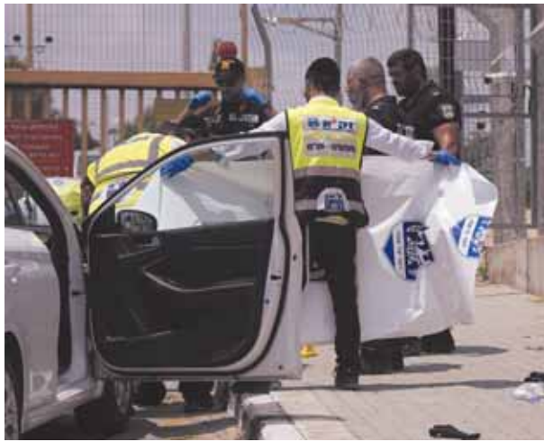
Israeli Police and ZAKA emergency service work at the scene of an attempted stabbing attack at the entrance to Netiv HaAsara, near the Gaza border in southern Israel on Monday.