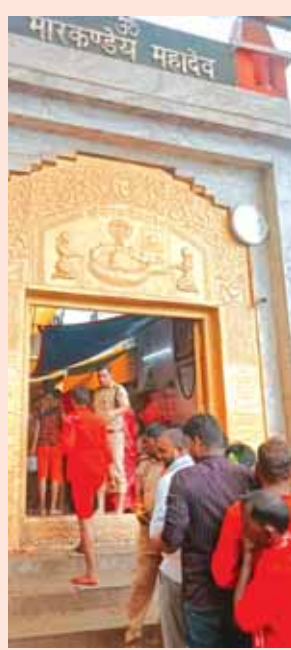
Marg, including Karmdeshwar Mahadev, Bhim Chandi, Rameshwar Mahadev, Paach Pandev and Kapildhara. Apart from these famous temples, heavy rush of devotees was

Religious fervour gripped this city of Lord Shiva on the first Monday in the auspicious month of Shraavan when not only at one of the dwadasa jyotirlingas, Kashi Vishwanath temple, but also several other famous temples located in the city as well as its outskirts witnessed heavy rush of people. The maximum rush was seen at Markandey Mahadev on Varanasi- Ghazipur highway located near the confluence of rivers Ganga and Gomti at Kaithi. Besides, there was a heavy rush of devotees at all famous temples, including Mahamritunjya Mahadev (Daranagar), Gauri Kedareswar (Kedar Ghat), Jogeshwar Mahadev (Ishwargangi), Omkleshwar Mahadev (Chittanpura), Teel Bhandeshwar (Pandey Haveli), Sarangnath Mahadev (Sarnath) and many others in the city areas. In the outskirts, a heavy rush of devotees was also seen at all the Shiva temples located on Panchkoshi