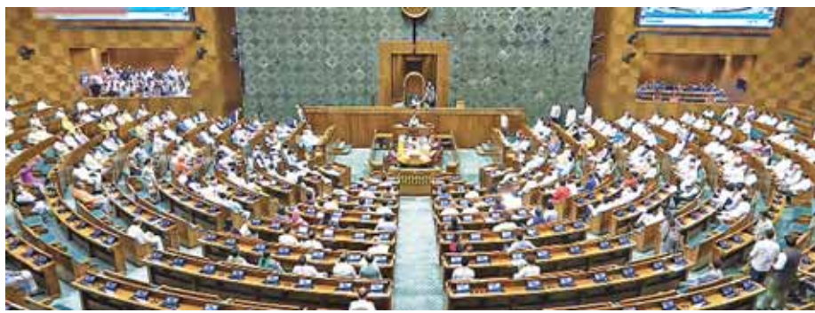
Lok Sabha Speaker Om Birla being greeted by TMC MP Shatrughan Sinha after the latter took oath as a member of the House during the first day of the Parliament Session, in New Delhi, on Monday