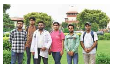
Students and others are seen within the precinct of the Supreme Court during a hearing on a batch of petitions related to the controversy-ridden medical entrance exam NEET-UG 2024, in New Delhi on Monday

track down the footprints of terrorists. Special forces were also inducted in the ongoing operations spread across the thickly forested area. In a post on X, White Knight Corps said, "Terrorists attacked the house of a VDC at Gunda, Rajouri at 3.10 am. A nearby Army column reacted and a firefight ensued. In another update the White Knight Corps posted on X, "Indian Army acted on intelligence, anticipating the threat to a Village Defence Guard in a remote area in Rajouri - Reasi. Tactical teams swiftly intervened, ensuring no harm to the VDC member and his family. Operations are continuing and a firefight is in progress".