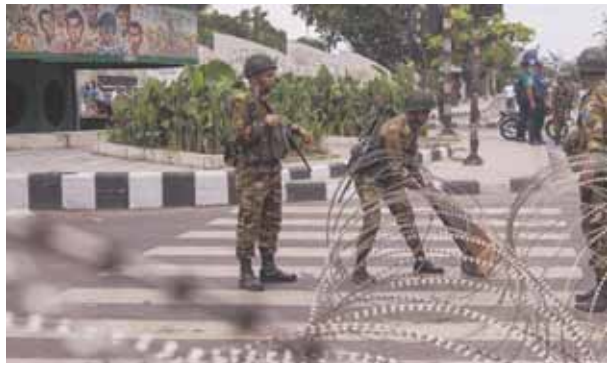
Bangladeshi military forces soldiers put up barbed wires on a main street in Dhaka, Bangladesh, Monday, July 22.

Bangladesh remained without internet for a fifth day and the government declared a public holiday Monday, as authorities maintained tight control despite apparent calm following a court order that scaled back a controversial system for allocating government jobs that sparked violent protests. This comes after a curfew with a shoot-on-sight order was installed days earlier and military personnel could be seen patrolling the capital and other areas. The South Asian country witnessed clashes between the police and mainly student protesters demanding an end to a quota that reserved 30% of government jobs for relatives of veterans who fought in Bangladesh's war of independence in 1971. The violence has killed more than a hundred people, according to at least four local newspapers. Authorities have not so far shared official figures for deaths. There was no immediate vio-