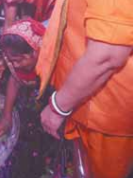
Devotees offering 'jalabishek' at Buddheshwar temple on the first day of Shravan, which also happened to be the first Monday of the month

The 10-year-old child remains in shock. The severity of the situation was revealed after police reviewed the CCTV footage. The father alleged that after the beating, the teacher instructed the child to sit on a bench, and no school staff came to assist him. The school administration has suspended the teacher, but the father believes this action does little to remedy the situation, as his child is now reluctant to attend school and feels that all teachers treat students poorly. The father also claimed that the teacher had previously beaten other students. The child's mother expressed shock after viewing the CCTV footage, questioning how such brutality could be inflicted on an innocent child. She mentioned that the child is currently receiving painkillers and antibiotics and is being examined regularly by doctors. The school administration commented that the child, who joined the school only last year and is somewhat weak academically, had parents who were less involved, as evidenced by their lack of attendance at parent-teacher meetings.