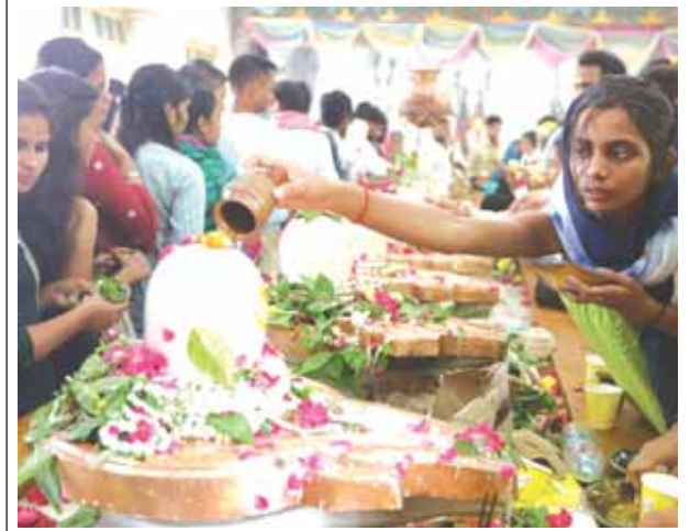
Devotees offer prayers at a Lord Shiva temple on the first Monday of the holy month of Shraavan, in Prayagraj.