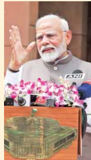
Prime Minister Narendra Modi addresses the media on the first day of the Parliament Session, in New Delhi, on Monday

A day before his Government is to present its first Budget in the third term, Prime Minister Narendra Modi outlined the agenda for this Session with an appeal to the Opposition to be constructive and a combative message saying some parties have practised "negative politics" and "misused" Parliament to hide their political failures.