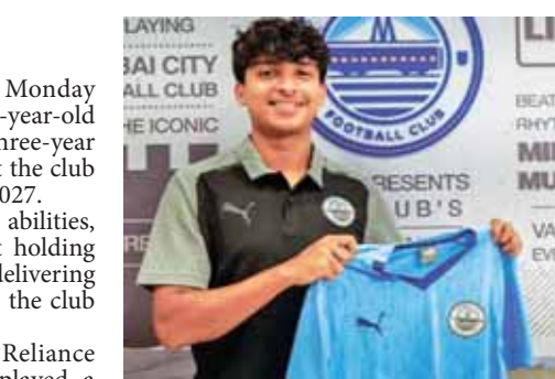
Super Division League during the 2022-23 season. He also participated in the Reliance