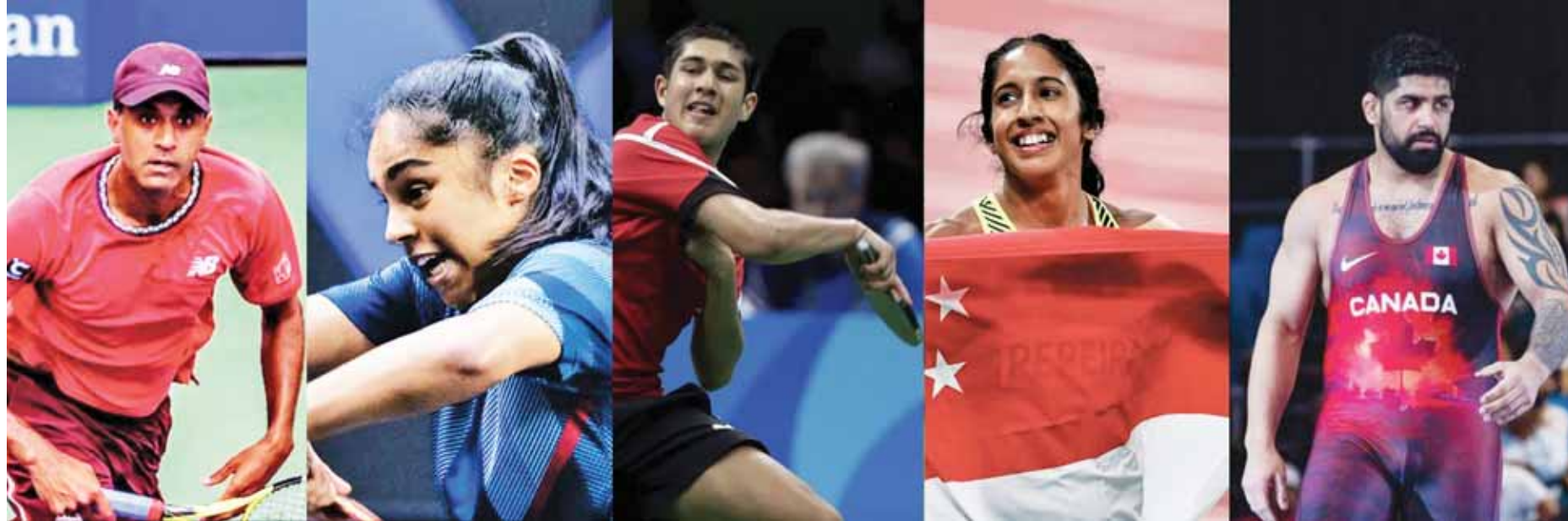
(Left to right): Rajeev Ram (Tennis, USA); Prithika Pavade (Table Tennis, France); Kanak Jha (Table Tennis, USA); Shanti Pereira (Singapore, Athletics) and Amar Dhesi (Wrestling, Canada)

"I am very proud to be of Indian heritage and represent the community in any way I can. In tennis, there are not many of us from the community. Any success that we can achieve as a closed group can inspire the next generation to excel," Rajeev had once said. Playing for the USA, Rajeev has achieved considerable success. The tennis doubles specialist won five Grand Slams titles including four men's doubles and one mixed doubles.