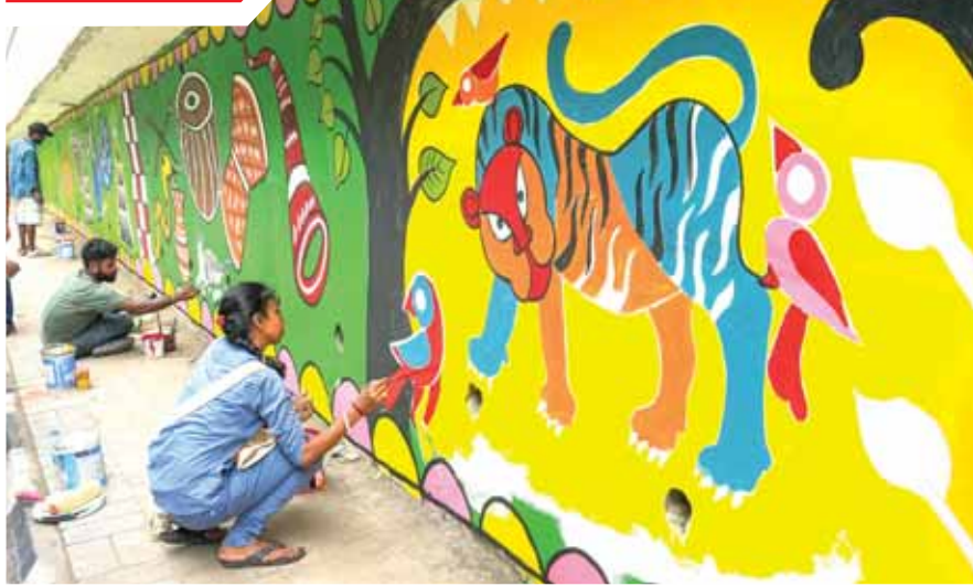
Artists decorate a wall for the 46th Session of UNESCO's World Heritage Committee, in New Delhi