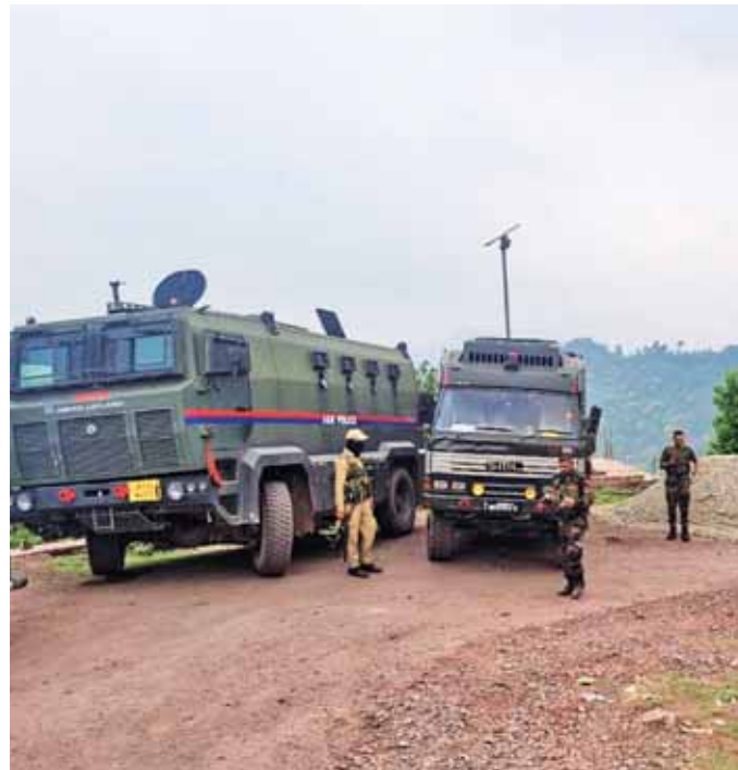
Army personnel during an encounter with terrorists in Gundha area of Rajouri district, on Monday

Close on the heels of the high-level security review meeting, chaired by Army Chief General Upendra Dwivedi to chalk out a strategy to flush out Pakistani terrorists occupying Jammu Heights, a heavily armed group of terrorists launched two more frontal attacks on an Army post and the house of the Shaurya Chakra awardee in the Gunda village of Khawas tehsil in the frontier Rajouri district in the wee hours of Monday.