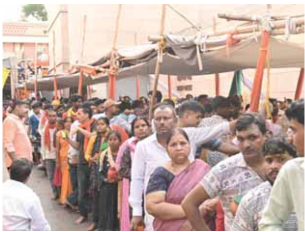
Crowd of devotees at Kashi Vishwanath Corridor on first Monday of Shraavan in Varanasi.