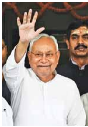
Bihar Chief Minister Nitish Kumar

The NDA partner JD(U)'s "pressure" on Centre over demand of Special Status to Bihar came down crashing after the Government on Monday cited an inter-Ministerial group report prepared in 2012 to assert that a case for granting special category status to Bihar is not made out. The BJP's allies from Bihar demanded the status for the backward State.