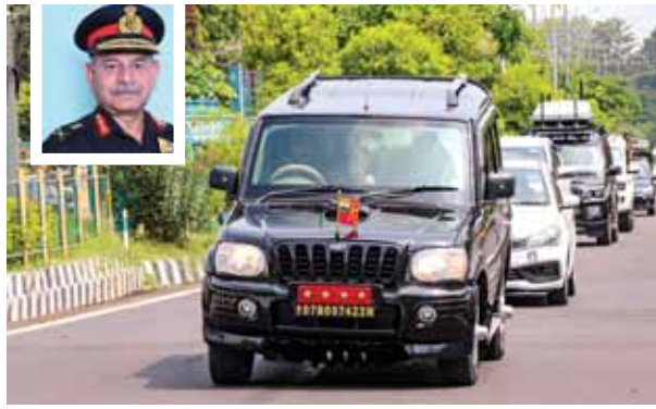
Convoy of Chief of the Army Staff General Upendra Dwivedi arrives at the Police headquarters for a meeting, in Jammu, on Saturday