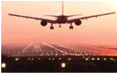
Saturday issued a statement saying airline systems across airports have started 'working normally' and all issues related to travel adjustments and refund processes were being taken care of. Union Civil Aviation Minister K Rammoan

Airport systems in India resumed operations normally from 3 am on Saturday, hours after major disruptions caused inconvenience to passengers. However, the overall system has not yet fully recovered, as confirmed by airport officials. The significant backlog of cancelled and delayed flights and yet-to-be-delivered baggage means full restoration of normalcy may take a couple of days. Additionally, the process of rebooking affected passengers or processing refunds will begin as the systems are back up.