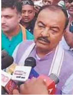
Deputy Chief Minister Keshav Prasad Maurya addressing mediapersons in Prayagraj on Saturday

Targeting Samajwadi Party president Akhilesh Yadav during his visit to Prayagraj on Saturday, Deputy Chief Minister Keshav Prasad Maurya accused the opposition of engaging in politics centered around Muslim appeasement, lacking both vision and mission, and attempting to disrupt the sanctity of the Kanwar Yatra. This event was part of a programme at Azad Park where Maurya launched a massive plantation campaign. Maurya announced that a total of 36,50 crore saplings would be planted across the state, with 85 lakh of them specifically in Prayagraj. He encouraged widespread participation in the initiative and stated that he would also inaugurate the campaign in Kaushambi. Addressing media questions, Maurya criticised Akhilesh Yadav, suggesting that opposition members should participate in the Kanwar Yatra by carrying