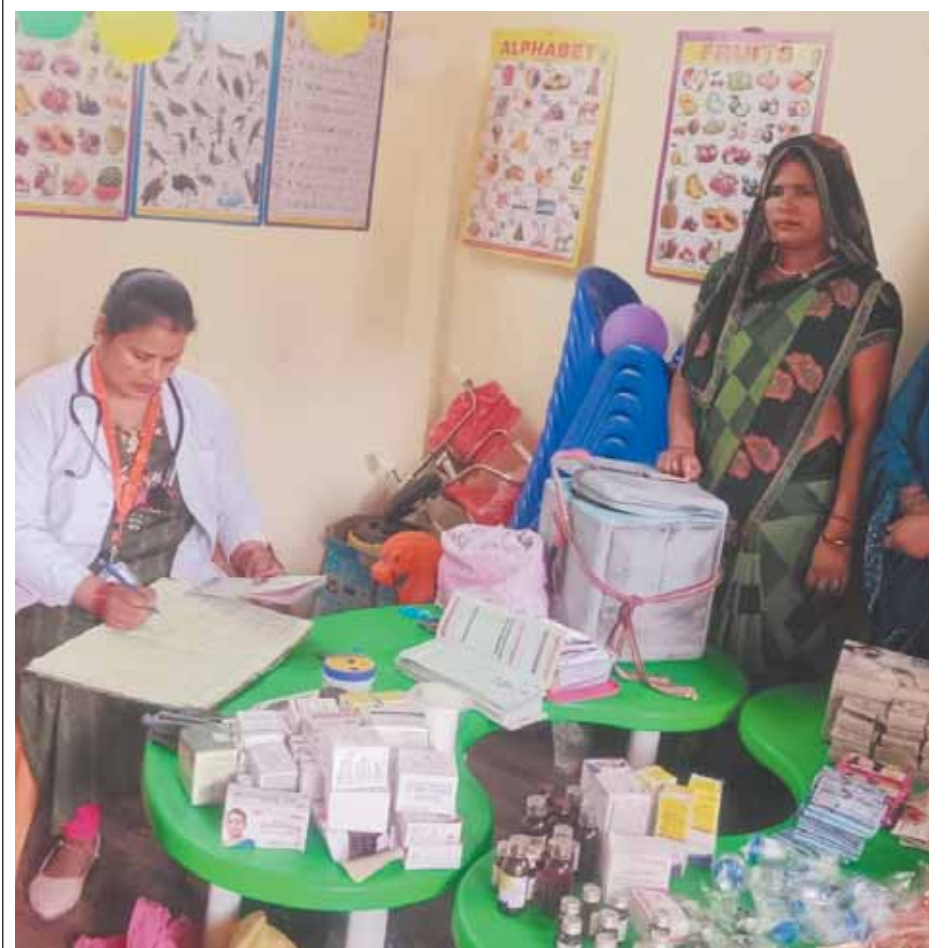
UHSND session being held at an Anganwadi centre in Varanasi on Saturday.