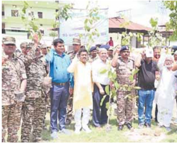
(Left) CRPF personnel and others planting saplings in Kandwa area in Varanasi on Saturday; (right) tree plantation programme organised by IFFCO