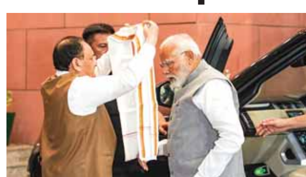
Prime Minister Narendra Modi being welcomed by Union Minister and BJP President JP Nadda as he arrives to meet party workers at the BJP headquarters, in New Delhi,