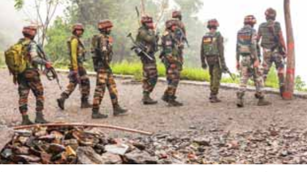
Army personnel during an encounter with terrorists in a forest village in Doda district on Thursday

As per the preliminary assessment made by the different agencies, part of the multi-layered security grid in Jammu and Kashmir, the involvement of ex-Pak army