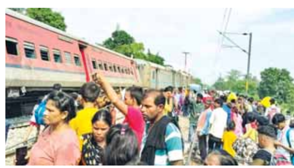
Local residents gather after Chandigarh-Dibrugarh Express derails in Uttar Pradesh