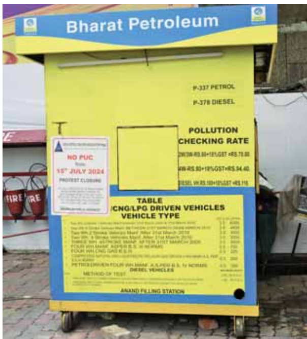
View of a petrol pump, in New Delhi, on Monday, Around 600 Pollution Under Control (PUC) centres across 400 petrol pumps in the national Capital will remain closed from Monday in response to a protest call by petrol dealers and pump owners

Around 600 Pollution Under Control Centres (PUC) across 400 petrol pumps in the national Capital will remain closed starting Monday in response to a protest call by petrol dealers and pump owners following the Delhi Government's proposed hike in pollution certificate charges. The closure call of PUC by the Delhi Petrol Dealers' Association (DPDA) comes amid tussle with the Government for not revising the PUC checking rates according to the demand of the association. The association of petrol dealers claimed that while the rates for PUC certificates were not increased from the last 13 years, last week, there was a very nominal increase in the rates by the Delhi Transport Department. While announcing the decision on Thursday, Delhi Transport Minister Kailash Gahlot said, "In response to the long-pending demands of the Delhi Petrol Dealers Association and to keep up with the rising costs of pollution checking services, we have decided to revise the rates. This revision is necessary to ensure that pollution checking stations can continue to operate efficiently and provide quality services to the public.