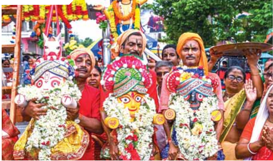
Devotees carry idols of Lord Jagannath, Balabhadra and Subhadra on the occasion of Ulta Rath Yatra in Nadia