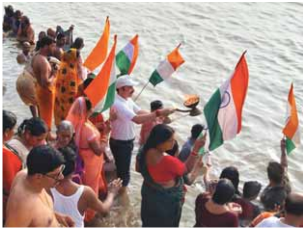
Namami Gange activists spreading the message of cleanliness at Kedar Ghat in Varanasi on Monday.

The water level of river Ganga in this holy city continued to rise on Monday. As per the report of Middle Ganga Division-III of Central Water Committee (CWC), the water level was recorded to be rising at a speed of five centimetres per hour though the water level of this river is rising by twice the speed i.e. 10 cm per hour a day ago. Though other half of the state is facing severe flood situation, this region of Purvanchal (eastern UP) is still safe as the main rivers are flowing far below the danger mark. However, in Varanasi during the last two