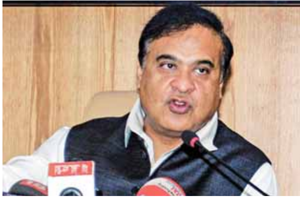
Assam Chief Minister Himanta Biswa Sarma addresses the media, in Guwahati

Assam Chief Minister Himanta Biswa Sarma on Monday said anyone coming to Assam in 2015 or later will be deported back to their country of origin. "We will deport those who have come after 2015. Only eight persons have applied so far who came before 2015 for CAA. Out of these applicants, only two have proceeded to attend interviews with relevant authorities," the CM said at a Press conference in Guwahati to share the insight into the implementation of the Citizenship Act.