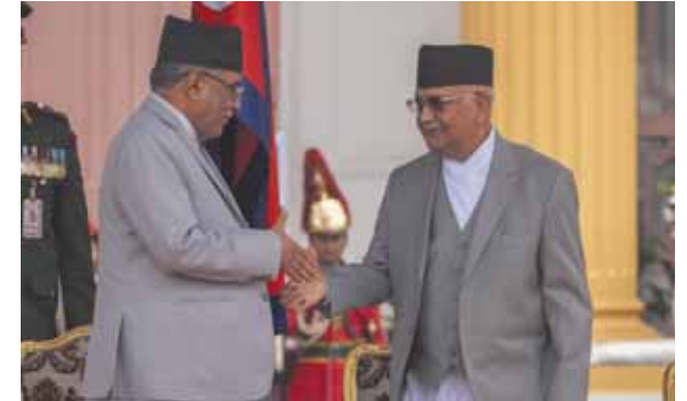
Outgoing Prime Minister Pushpa Kamal Dahal (left) congratulates newly-elected Prime Minister Khadga Prasad Oli (right) after the oath of office at the Presidential residence in Kathmandu on Monday.

KP Sharma Oli on Monday was sworn in as Nepal's Prime Minister for the fourth time to lead a new coalition government that faces the daunting challenge of providing political stability in the Himalayan nation. The leader of Nepal's largest communist party was appointed as prime minister on Sunday by President Ram Chandra Paudel to lead the coalition government with the Nepali Congress (NC), the largest party in Parliament, apart from other smaller parties. Oli, 72, succeeds Pushpa Kamal Dahal 'Prachanda', who lost the vote of confidence in the House of Representatives (HoR) on Friday, leading to the formation of the new government. Chairman of the Communist Party of Nepal-United Marxist Leninist (CPN-UML), Oli was sworn in by President Paudel at Shital Niwas, the main building of Rashtrapati Bhawan at a ceremony that was delayed by more than half an hour. According to the news portal MyRepublica, the swearing-in