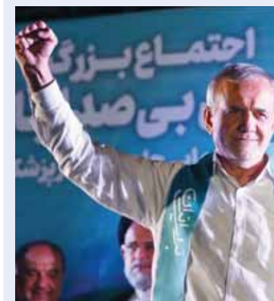
The untimely demise of Iran's conservative President Ebrahim Raisi has necessitated an election amidst regional tensions,

norable government. The common man eagerly anticipates budgetary relief through increased exemption limits, revised tax slabs, and measures to alleviate everyday financial burdens. Expectations include provisions for healthcare subsidies, travel benefits for senior citizens, and incentives supporting livelihood stability, reflecting hopes for tangible improvements in quality of life.