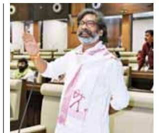
Jharkhand Chief Minister Hemant Soren speaks during a Special session of the State Legislative Assembly, held in Ranchi on Monday.

situation. "Unlike in the past, it has rained a lot in less time which is more than the city's carrying capacity. As a result, there was a water-logging on railway tracks and roads. Traffic has now resumed on all roads. Senior officials are present at all water-logging-prone spots in the city. The State Disaster Management Authority, NDRF, BMC are on alert," Shinde said. "There is movement of vehicles on Eastern and Western express highways and all railway lines. NDRF teams have reached all three coastal districts in the state. Army, Navy and Air Force are also on alert," Shinde said. Continued on Page 8