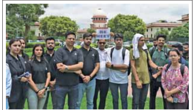
Students at the Supreme Court of India in New Delhi, on Monday. The apex court has begun the hearing for a number of petitions regarding the alleged irregularities in the administration of NEET UG 2024 exams.