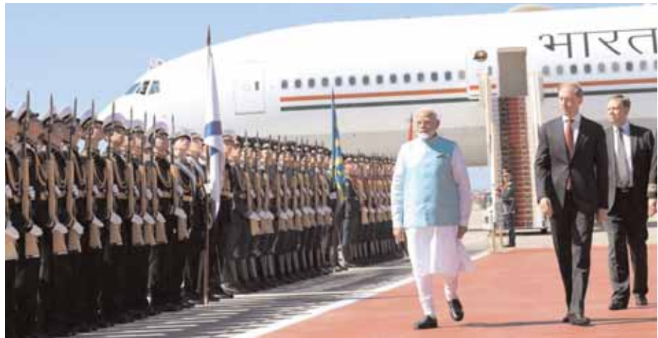
Prime Minister Narendra Modi receives a guard of honour upon his arrival at the airport in Moscow on Monday.

the untainted students". "In a situation where breach affects the entirety of process and it is not possible to segregate the beneficiaries from others, it may be necessary to order a re-test," the bench said. The court said if the sanctity of NEET-UG 2024 is 'lost' and if the leak of its question paper has been propagated through social media, then a re-test has to be ordered. The bench said the extent of question paper leak and the beneficiaries across geographical boundaries have to be ascertained before the top court may order a re-test in the controversy-ridden exam which was taken up by 23.33 lakh students at 4,750 centres in 571 cities including in 14 cities overseas. Continued on Page 8