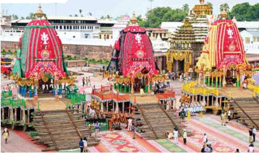
The chariots of Lord Jagannath, Balabhadra and Devi Subhadra prepared for annual Rath Yatra festival, in Puri