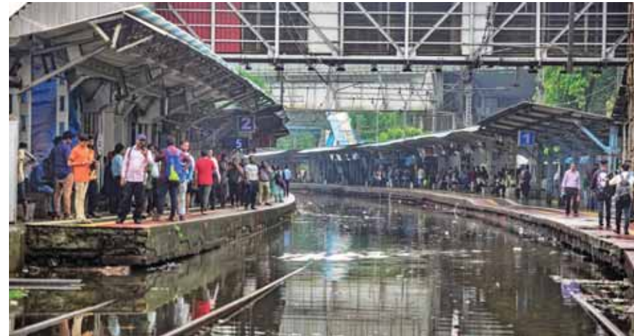
Passengers wait for trains at a waterlogged railway station, during rain, in Mumbai, on Monday.

The heavy downpour being witnessed in the metropolis and surrounding areas since the weekend — resulted in massive inundation in low-lying areas — threw suburban train services and air traffic out of gear, while the traffic on the Mumbai-Goa Highway remained badly affected for the second consecutive day on Monday. Heavy rains continued to batter Mumbai and adjoining areas of Thane, Navi Mumbai, Kalyan, Palghar and neighbouring coastal Konkan region. Such was the high intensity of rains that during the six-hour period between 1 am and 7 am on Monday, several of the rain catchment areas like Powari received 300 mm of rainfall. The Powai Lake — one of the major water-supplying lakes of Mumbai — started overflowing during the day. Considered the lifelines of Mumbai, the suburban train services of Central Railway (CR) and Western Railway (WR) were badly hit as the railway track remained thick sheets of water, affecting the operation for the better part of the day. The BrihanMumbai Municipal Corporation (BMC) deployed pumps at several places to clear flood water in low-lying areas in the metropolis. More than 50 flights were cancelled, while 27 were