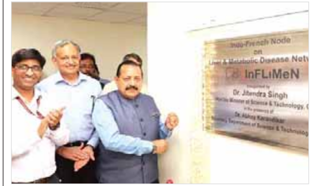
Dr Jitendra Singh launches Indo-French Liver And Metabolic Disease Network (InFLiMeN) at ILBS recently

There is an urgent need to develop simple, low-cost diagnostic tests for the detection of different stages of fatty liver and their progression to severe, full-blown diseases. The approaches and algorithms should suit the Indian context, low-priced, and have a point of care, said Union Minister Dr Jitendra Singh who is himself a Diabetologist. Every third Indian has fatty liver, which predates Type 2 Diabetes and other metabolic disorders, said Dr Singh after launching an Indo-French Liver and Metabolic Disease Network (InFLiMeN) a virtual node to prevent and cure metabolic liver diseases at Institute of Liver and Biliary Sciences (ILBS) in Delhi recently.