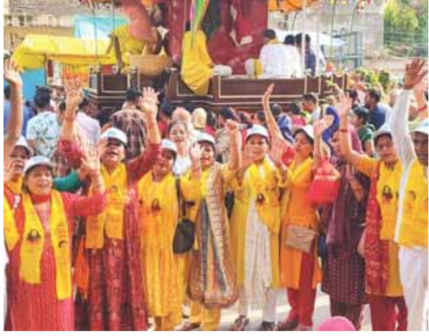
Devotees offering prayers at Rathyatra Mela in Varanasi on Sunday.

Braving drizzling devotees thronged Rathyatra Mela when this three-day famous fair began with the installation of idols of Lord Jagannath, his brother Balabhadra and sister Subhadra, on the traditional Rath (chariot) here on Sunday. The wooden chariot is based on 14 wheels which is placed near Rathyatra crossing. Lord Jagannath will stay on the Rath till the wee hours on Wednesday, prior to the return of idols to Jagannath temple at Assi. The idols were installed at the Rath amidst chanting of traditional mantras by the priests. The idols were decorated with yellow garments (Pitambar) and the entire chariot was decorated with flowers. The traditional dishes, including sweets and fruits, were offered. On the first day of Rathyatra fair, under the joint aegis of Namami Gange and Patanjali Yogpeeth, a grand aarti of Lord