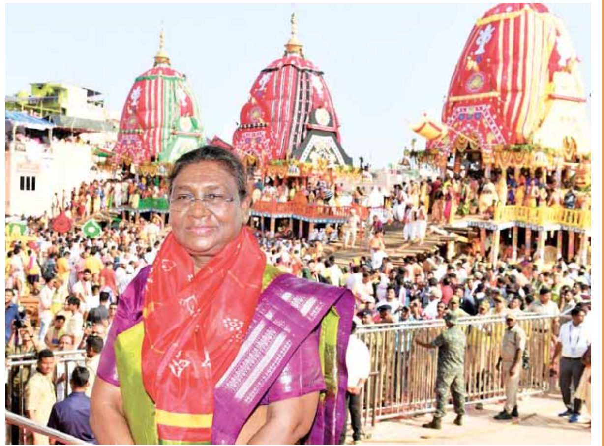
President Droupadi Murmu during the annual Rath Yatra in Puri on Sunday