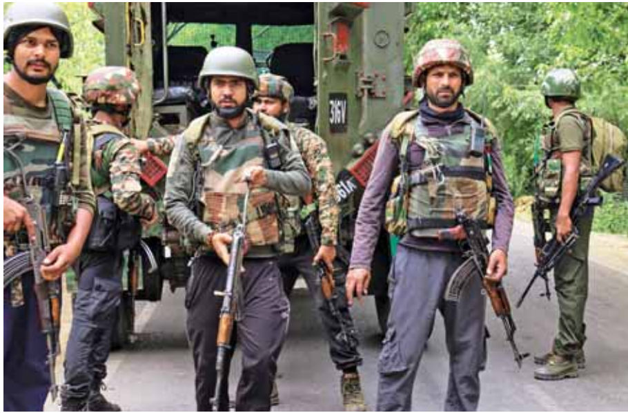
Security personnel stand guard during an encounter with terrorists in Kulgam