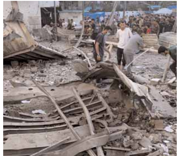
Palestinians look at the aftermath of the Israeli airstrike on a U.N.-run school that killed dozens of people in the Nusseirat refugee camp in the Gaza Strip on Saturday.

Marking nine months since the war in Gaza started, Israeli protesters blocked highways across the country Sunday, calling on Prime Minister Benjamin Netanyahu to step down and pushing for a ceasefire that could bring back the hostages held by Hamas.