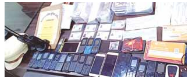
The seized mobile phones and documents after cyber cops of Uttar Pradesh Police busted a bank cheque cloning scam in Bulandshahr.