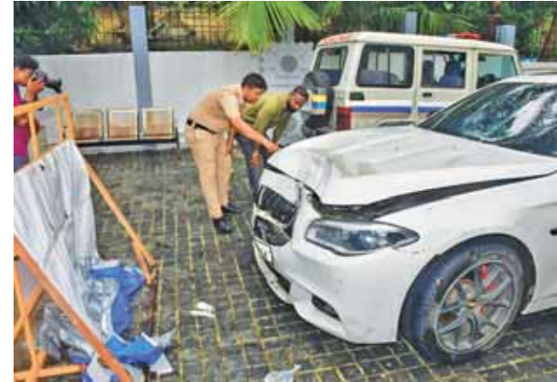
A damaged BMW car that was involved in a hit-and-run case, parked on the premises of Worli police station, in Mumbai, on Sunday