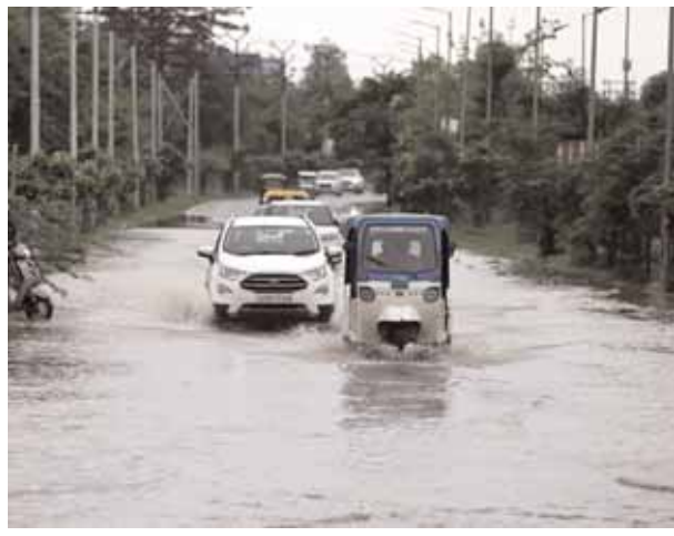
PNS ■ LUCKNOW

Heavy rains lashed the city overnight and on Sunday morning, while also affecting several other districts of the state due to the northward movement of the monsoon trough line. According to the Met department, Lucknow received 75.1 mm of rain till 8:30 am on Sunday and an additional 2.2 mm from 8:30 am to 5:30 pm.