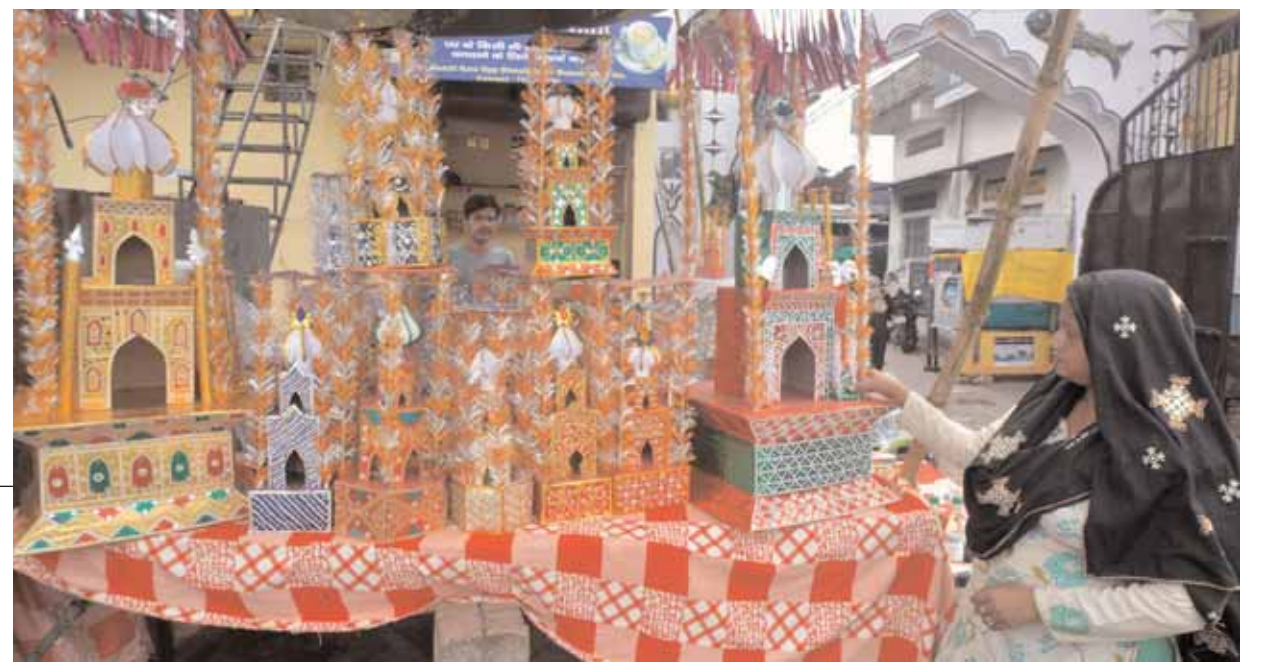
A Muslim woman looking for tazia for Muharram in Old Lucknow on Sunday

On Chief Minister Yogi's instructions, saplings have been prepared in nurseries for the plantation of 35 crore trees. Instructions have been issued to the divisional forest officers (DFOs) of the respective divisions to establish and enrich 'Mitra Van'.