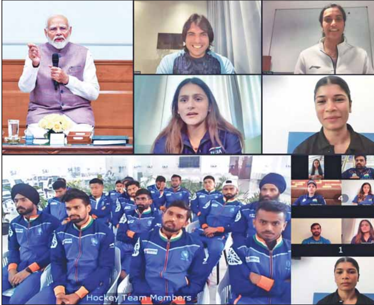
Prime Minister Narendra Modi interacts with the athletes of the Indian contingent who are going to represent the country for the first time in the Paris Olympics, in New Delhi, Thursday, July 4, 2024

Confident that India's bid to host the 2036 Olympics will be successful, Prime Minister Narendra Modi has urged athletes bound for this month's Paris Games to share their views on the arrangements in the French capital to help his government's ambitious plan to bring the quadrennial showpiece here. In an interaction with Paris-bound athletes, conducted both in person and online on Thursday, Modi said those travelling to the French capital would do the country a huge service by providing inputs from their experience. "We are hoping to host the Olympics in 2036, it will help in creating a sporting atmosphere (in the country). Work is in progress to prepare infrastructure for it," he said in the interaction, which was attended by the national men's hockey team, the shooting contingent, boxers and track-and-field stars such as Neeraj Chopra among others. The complete video of the PM's light-hearted conversation with the athletes was shared by his office on Friday. The meeting with the contingent was also attended by sports minister Mansukh Mandaviva and Indian Olympic Association (IAO)