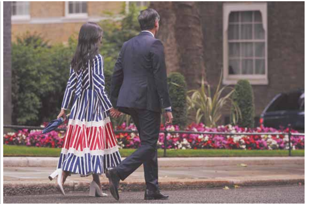
Britain's outgoing Conservative Party Prime Minister Rishi Sunak and his wife Akshata Murty walk from 10 Downing Street to a waiting car before going to see King Charles III to tender his resignation in London, Friday, July 5, 2024. Sunak and his Conservative Party lost the general election held July 4, to the Labour Party, whose leader Keir Starmer is set to become Prime Minister later Friday.

ulations to Starmer and the Labour Party on the "historic election win". "I'm looking forward to continuing our close cooperation between the UK and Norway, including on the energy transition, our common security and trade," he said further. Canadian Prime Minister Justin Trudeau posted a photo of himself and Starmer on X as he congratulated him on a "historic" election victory. "Lots of work ahead to build a more progressive, fair future for people on both sides of the Atlantic. Let's get to it, my friend," Trudeau wrote. Ukrainian President Volodymyr Zelenskyy congratulated Starmer and the Labour Party in a post on X. "Ukraine and the United Kingdom have been and will continue to be reliable allies through thick and thin. We will continue to defend and advance our common values of life, freedom, and a rules-based international order," he said.