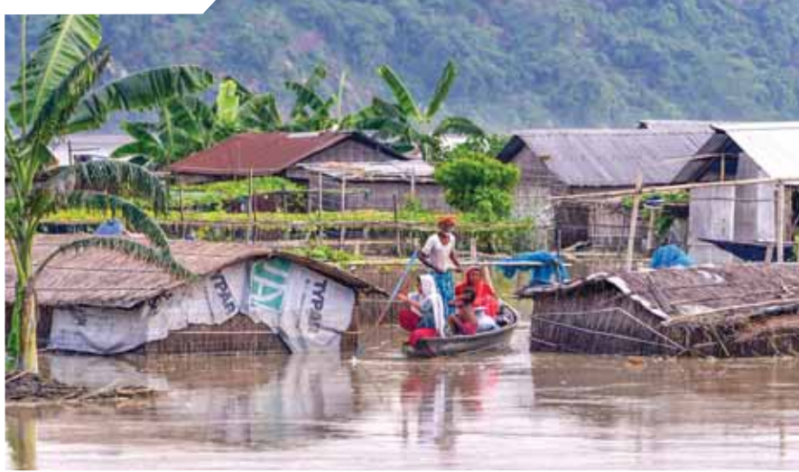
Locals move their belongings on a boat as they move to a safer place during floods, in Darrang district PTI