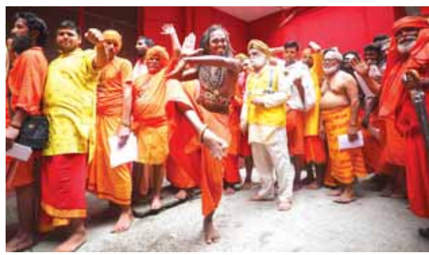
A sadhu poses while waiting to get registered for Amarnath Yatra at Ram Mandir base camp, in Jammu, on Friday.