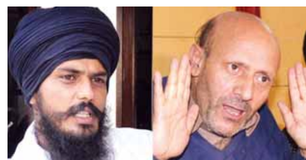
Sikh preacher Amritpal Singh and Kashmiri leader Sheikh Abdul Rashid

Jailed radical Sikh preacher Amritpal Singh and Kashmiri leader Sheikh Abdul Rashid, who were granted parole to take oath as members of the Lok Sabha, were sworn in as MPs on Friday, amid heavy deployment of security personnel in and around the Parliament complex. While Rashid, popularly known as Engineer Rashid, is in Delhi's Tihar jail in a terror-funding case registered under the Unlawful Activities (Prevention) Act, Singh is lodged in a prison in Assam's Dibrugarh district for offences under the National Security Act. They were brought to the Parliament complex by