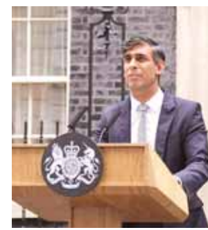
Britain's Labour Party leader Keir Starmer reacts on stage as he is elected for the Holborn and St Pancras constituency, in London (l). Britain's outgoing Conservative Party Prime Minister Rishi Sunak speaking outside 10 Downing Street before going to see King Charles III to tender his resignation in London, on Friday.