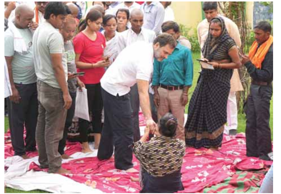
Congress leader Rahul Gandhi meets families of the victims of Hathras stampede incident at Green Park in Hathras on Friday.