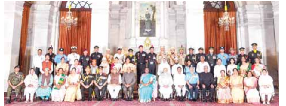
President Droupadi Murmu, Vice President Jagdeep Dhankhar, Prime Minister Narendra Modi and Defence Minister Rajnath Singh with the recipients of the Gallantry Awards during the Defence Investiture Ceremony-2024 (Phase-I), at Rashtrapati Bhavan, in New Delhi on Friday

initial lot of 70,000 rifles are to be "Made in India" with less indigenous content. The first batch of 5,000 rifles had only 5 percent indigenous components, which will increase to 70 percent when the initial lot of 70,000 is completed in 32 months, sources said. The idea is to have rifles made of 100 percent indigenous components over a period of 128 months. "The AK-203s are manufactured in India in compliance with exclusive Russian technologies on certified equipment. This ensures high product quality and compliance with the states' characteristics," the Russian statement had said. These rifles will replace the 5.56x45 mm INSAS (Indian Small Arms System), which has been in use for over two decades and outrun its utility. Compared to the AK-103, which was originally meant for joint production, the AK-203 comes with collapsible stock that can be adjusted to the shooter's height. The rifles also come with a safety mechanism that enables a soldier not to lose contact with the grip when changing firing modes during operation.