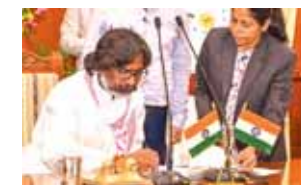
Jharkhand Mukti Morcha (JMM) leader Hemant Soren takes the oath of office and secrecy as the 13th Chief Minister of Jharkhand during the swearing-in Ceremony at the Raj Bhavan, in Ranchi

He was administered the oath of office and secrecy by