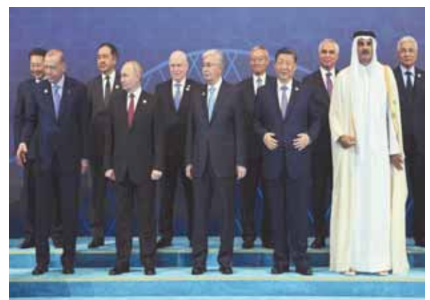
From left, front row, Turkish President Recep Tayyip Erdogan, Russian President Vladimir Putin, Kazakh President Kassym-Jomart Tokayev, Chinese President Xi Jinping and Qatari Emir Sheikh Tamim bin Hamad Al Thani pose for a photo at the Shanghai Cooperation Organisation (SCO) plus summit in Astana, Kazakhstan, on Thursday.

The grouping was established in 2001 by China, Russia and the four ex-Soviet Central Asian nations of Kazakhstan, Kyrgyzstan, Tajikistan and Uzbekistan to promote regional security and economic cooperation. It was later joined by India, Pakistan and Iran. Russia's western neighbour and ally, Belarus, joined the SCO on Thursday. Observer states and dialogue partners include Turkey, Saudi Arabia and Egypt. Addressing the summit, Putin emphasised the group's focus on ensuring security of its members and said the SCO will form a