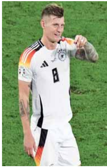
Championship title but having it as a goal is of course the case," Kroos said. "I think it will be really difficult to finish more successfully than I left it with Madrid. And now of course I'm trying to do the same here." Kroos retired from the national team

Germany great Toni Kroos hopes the next game isn't his last. Heavyweights Germany and Spain clash at the European Championship on Friday, when the winner will advance to the semifinals. Kroos is ending his playing career after Germany's last game at Euro 2024. He hopes that will be the final in Berlin's Olympiastadion. But he knows it could be as soon as Friday if Spain - the most impressive team so far - knocks out the host nation in Stuttgart. "I'm not nostalgic at all," Kroos said Wednesday at potentially his last press conference as a player. He said he wasn't assuming Spain "will be my last game. So, I think we can all look forward to seeing each other again." Kroos has played a key role in lifting the pre-tournament gloom surrounding the German team and turning it to optimism that the hosts can go on to win Euro 2024. It would be a fitting sendoff for a player who has already signed off on a glittering club career by winning the Champions League and Spanish league with Real Madrid. "It's pretty difficult to plan a European