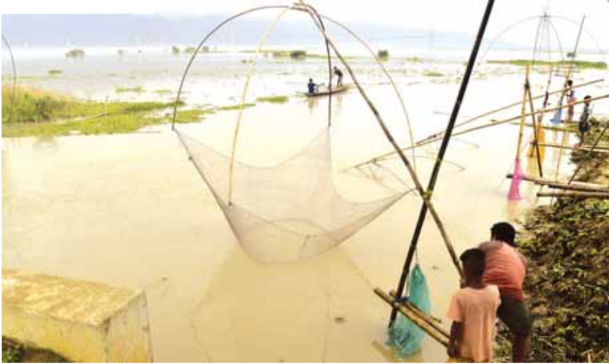
Villagers catch fish in flood water, in Morigaon district