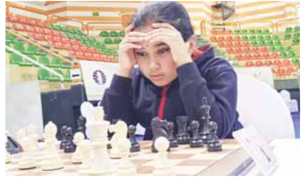
invited by British Prime Minister Rishi Sunak to 10 Downing Street to mark the government's major new GBP 1 billion investment package for the game. The package has since been in place to support children attending schools in disadvantaged areas across England to learn and play chess, improve the visibility and availability of the game, and fund elite playing. As part of the package, the UK's Department for Culture, Media and Sport (DCMS) said it would invest GBP 500,000 in the English Chess Federation (ECF) over two years to develop the next generation of world-class talent. Funds will support expert coaching, training camps and cutting-edge computer