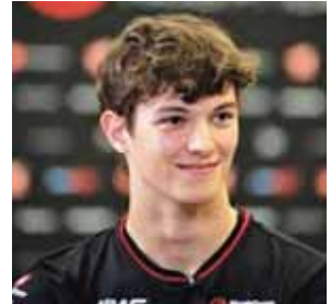
unexpected F1 debut after Sainz was diagnosed with appendicitis and needed an operation. Bearman, who was 18 at the time, became the third-youngest driver in F1. He had only had two practice sessions with Haas - in 2023 - yet produced a commanding drive on a tricky circuit that was way beyond his limited experience. He is currently competing in the F2 championship and is a reserve driver for both Ferrari and Haas - which uses a Ferrari engine. He won the Austrian GP sprint race last weekend driving for Prema Racing in F2.

Oliver Bearman has been signed on a multi-year deal by the Haas Formula 1 team from 2025 onward. Haas announced the signing in a statement Thursday, without giving more details. The 19-year-old British driver will take the seat vacated by German driver Nico Hulkenberg, who is joining Sauber at the end of the year ahead of its rebranding to Audi for 2026. "It's hard to put into words just how much this means to me. To say out loud that I will be a Formula 1 driver for (the) Haas F1 Team makes me so immensely proud," Bearman said. "To be one of the very few people who get to do the thing that they dreamed of as a child is something truly incredible." Bearman impressed with a stunning seventh-place finish at the Saudi Arabian Grand Prix in March, when he stood in for Carlos Sainz Jr. He got the