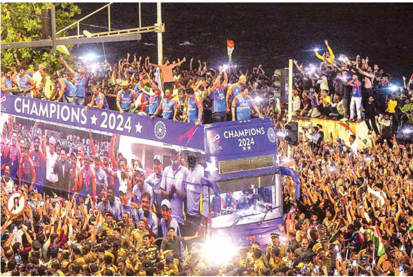
Players of the T20 World Cup-winning Indian cricket team with the championship trophy acknowledge fans during their open bus victory parade, in Mumbai, on Thursday

The Wankhede Stadium here was thrown open to fans, who filled up the stands within minutes to celebrate the Indian