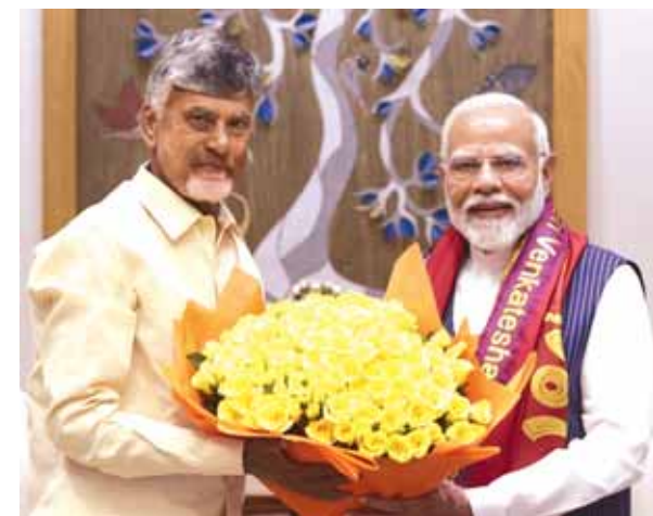
Andhra Pradesh Chief Minister N Chandrababu Naidu meets Prime Minister Narendra Modi in New Delhi on Thursday

Naidu's assertion has come a week after another significant ally of the NDA, Bihar Chief Minister Nitish Kumar-led JD(U) had pressed for special package and grants for Bihar during the meeting of party's national executive. Sources said during the