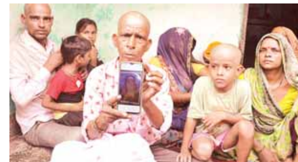
Family members sitting at a house after the Hathras stampede. Over 120 people were killed and several injured in the stampede, according to officials

In the sobbing town of Hathras many are seen grieving for their loved ones who lost their lives in one of the worst stampedes in the country, cursing the cop-turned-godman who claims to heal and even bring the