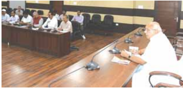
Uttar Pradesh Agriculture Minister Surya Pratap Shahi reviewing preparations for Kharif crops in Varanasi on Thursday.

A review meeting was held with the departmental officers and in charges of Krishi Vigyan Kendras regarding preparations for Kharif crops at the Circuit House Auditorium here on Thursday under the chairmanship of Uttar Pradesh Agriculture, Agricultural Education and Agricultural Research Department Minister Surya Pratap Shahi. While reviewing the financial and physical progress, the minister issued the guidelines in which the last date for applying for the establishment of Agri Junction centres has been fixed as July 15. The minister said after the applications, the beneficiaries should be selected and trained and licenses should be issued to them as per rules for the sale of fertilisers, seeds and agricultural protection chemicals. He directed that under the Namami Gange Scheme being run in Varanasi and Chandauli districts, cluster work and training should be given to the farmers after selection in time