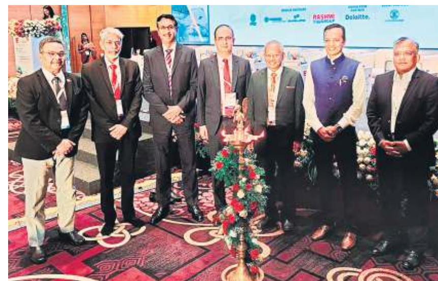
Following the successful inaugural edition of the ISA Steel InfraBuild Summit in Lucknow, the Indian Steel Association (ISA) has announced their second edition at the Hotel Westin Hyderabad Mindspace in HITEC City, Hyderabad. The 2nd ISA Steel InfraBuild Summit 2024 aims to accelerate the development and delivery of infrastructure in India, with a special focus on the state of Andhra Pradesh and its surrounding regions.