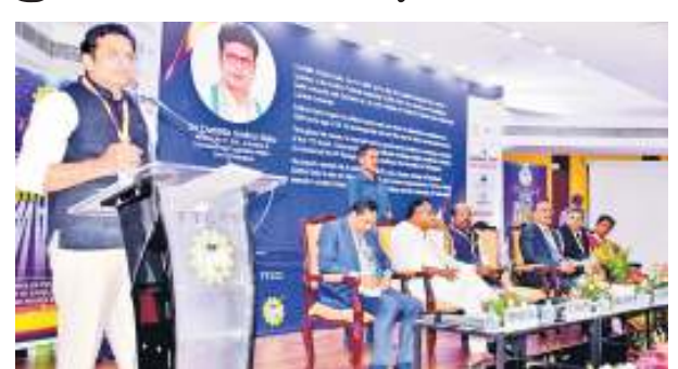
Minister D Sridhar Babu seen addressing the FTCCI excellence awards function

before presenting awards, Sridhar Babu said that the greatest asset is the human capability to propel Telangana's growth, despite having numerous colleges, many youths struggle to secure jobs due to skills gaps. Sridhar emphasised that bridging this gap