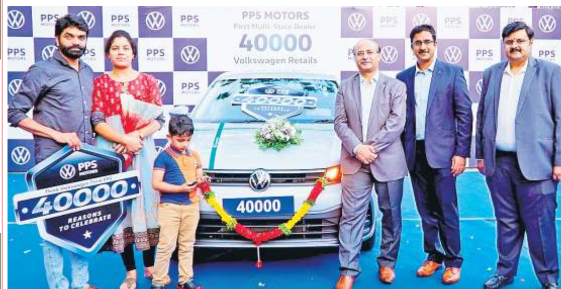
PPS Motors has announced that it has reached a milestone of selling 40,000 Volkswagen vehicles and therefore becoming India's first multi-state dealer to record this feat.