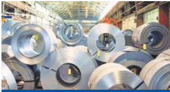
The report, released at ISA Steel InfraBuild Summit here, also said Maharashtra, Uttar Pradesh, Gujarat, Karnataka and Tamil Nadu have established themselves as leaders in steel consumption, leading to 41 per cent of the total consumption in FY23

"Government spending on infrastructure projects will