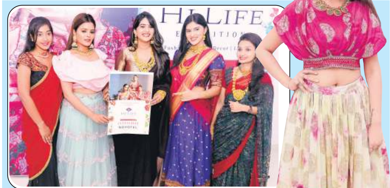
Hilife exhibition is all set to come up with its next fashion and lifestyle expo, which is going to be held from July 13 to July 15, at HICC-Novotel in HITEC City. The expo will feature creative fashion wear, lifestyle wear, bridal wear and many more.