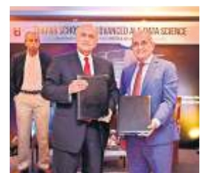
AI & Data Science (TSAAI) will be established at Thapar Institute of Engineering & Technology (TIET) campus in Patiala, Punjab.