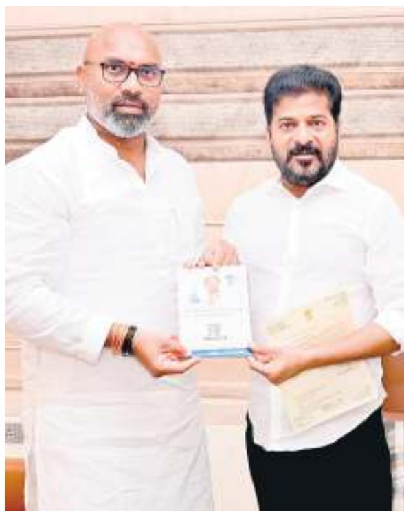
BJP MP from Nizamabad Arvind Dharmapuri met Chief Minister Revanth Reddy on Friday and sought his presence at the Shradhdanjali Sabha of his father D Srinivas, former APCC chief, who recently passed away