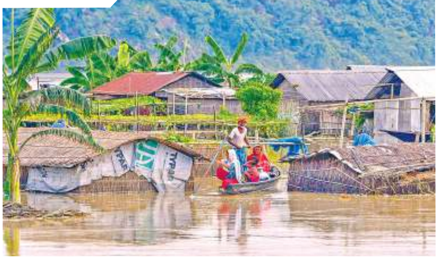
Locals move their belongings on a boat as they move to a safer place during floods, in Darrang district