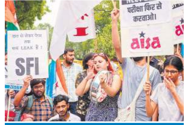
Student unions such as NSUI, AISEF, PYL, AIPSU and others called for the bandh to abolish the National Testing Agency (NTA) for failing to conduct the NEET smoothly