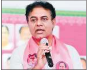
per the Congress manifesto? Yeh Kaisa Nyay Patra Hain?"

come his decision. What about the BRS MLAs who defected and contested the Lok Sabha on a Congress ticket? What about the half a dozen BRS MLAs who defected to the Congress? @RahulGandhi is this how you are going to uphold the Constitution? If you can't make BRS MLAs resign, how would the nation believe you are committed to scheduling the 10th Amendment as