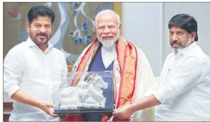
CM Revanth Reddy along with Deputy CM Bhatti presenting a replica of Nandi to Prime Minister Narendra Modi during a meeting held in New Delhi on Thursday

Telangana Chief Minister Revanth Reddy met Prime Minister Modi on Thursday and discussed many critical issues regarding the state. The meeting during which Deputy Chief Minister Bhatti Vikramarka was also present lasted approximately an hour, during which issues were discussed in detail. The Chief Minister urged the removal of the Shraavanapalli coal block from the auction list and its allocation along with the Koyagudem and Sattupalli Block 3 to SCLL.