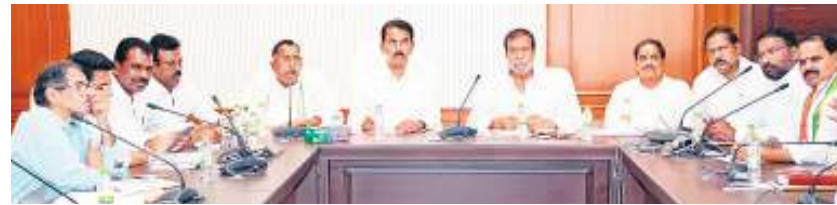
Medical and Health Minister Damodar Rajanarasimha holding a review meeting with officials in Mahabubnagar on Thursday

The Minister directed officials to submit detailed reports on pending projects. They emphasised creating an