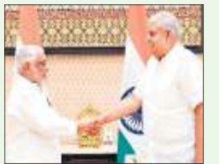
Keshava Rao greeting Rajya Sabha Chairman Jagdeep Dhankhad