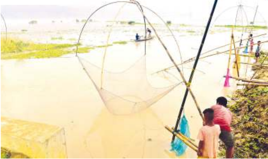
Villagers catch fish in flood water, in Morigaon district