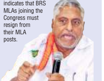
indicates that BRS MLAs joining the Congress must resign from their MLA posts.