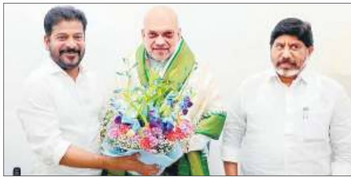
CM Revanth Reddy met Union Home Minister Amit Shah at his residence in New Delhi on Thursday along with Deputy Chief Minister Mallu Bhatti Vikramarka