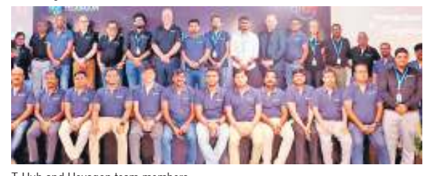
T-Hub and Hexagon team members

According to T-Hub, three startups emerged as winners from 12 finalists after a 100-day programme with LAB32's and Hexagon's mentorship. The winners are Indika AI, SwitchON and Xeed IO. Indika AI developed a PoC for real-time multilingual communication, transforming operations in finance, medicine, and law. SwitchON showcased a PoC for 3D visual inspection of engine block defects. Xeed