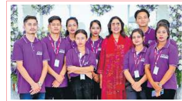
Avaan Excess, a pioneer in excess baggage services and a member of the Avaan India Group has opened its operations at Hyderabad International Airport. Moving forward, Avaan aims to expand its footprint in major airports worldwide.

Tydy is a human resources technology firm that specialises in providing pre-boarding and onboarding experiences for workers from the time of hire until retirement. Phenom announced that it has acquired Tydy. The platform's goal of reducing employee time to productivity and enhancing the user experience for HR professionals on a single platform is strengthened by its fifth acquisition and portfolio addition.