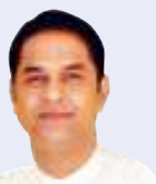
RAJYOGI BRAHMAKUMAR NIKUNJ JI

True peace and creativity flourish when we fully engage with the present