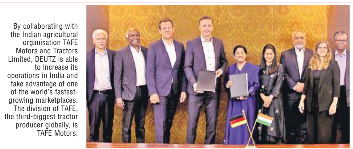
By collaborating with the Indian agricultural organisation TAFE Motors and Tractors Limited, DEUTZ is able to increase its operations in India and take advantage of one of the world's fastest-growing marketplaces. The division of TAFE, the third-biggest tractor producer globally, is TAFE Motors.