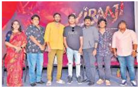
Viraaji , Varun Sandesh teased, "This role is unlike any I've played before. It required extensive preparation, and I can confidently say it's one of my craziest yet. The first look at the film, set to be unveiled on the July 10, will give audiences a glimpse into this exciting journey."