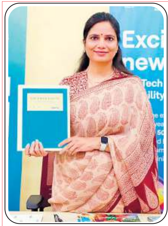
The HCL Foundation, held the fifth HCLTech Grant Pan-India Symposium 2024 with the theme "Strengthening Panchayati Raj Institutions through CSR", at G Narayanamma Institute of Technology and Science (For Women) in Hyderabad.