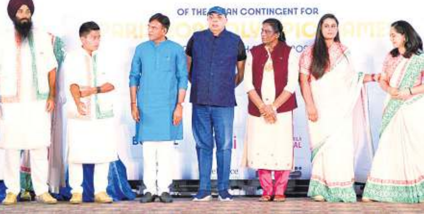
Tasva has taken on the prestigious task of designing the ceremonial dress for Team India at the upcoming Paris Olympics 2024. Minister of Youth Affairs and Sports, Dr Mansukh Mandaviya, launched the Official Ceremonial Dress for Team India in the presence of Indian Olympics Association President, Dr PT Usha. Tasva is all set to bring to Paris, the fashion capital of the world, its fresh take on Indian traditional wear.