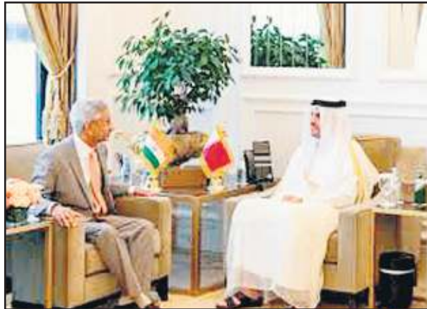
Jaishankar, who arrived here on a day-long visit, also exchanged views on regional and global issues with Sheikh Mohammed, who also holds the portfolio as Foreign Minister

External Affairs Minister S Jaishankar on Sunday met Qatar's Prime Minister Mohammed bin Abdulrahman bin Jassim Al Thani in Doha and reviewed bilateral relationship, with a focus on political, trade, investment, energy, technology, culture and people-to-people ties.