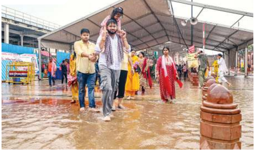
Devotees wade through a waterlogged area at Dharm Path in Ayodhya