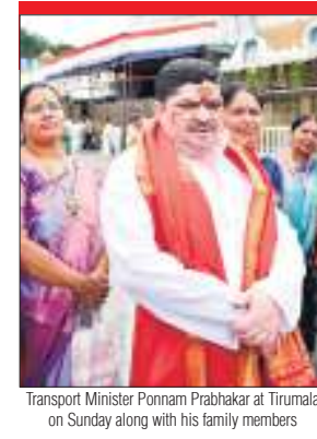
Transport Minister Ponnampalapati Prabhakar at Tirumala on Sunday along with his family members