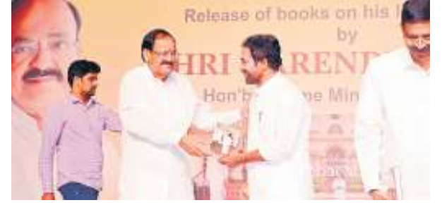
Former vice-president M Venkaiah Naidu presenting a book to Union Minister Kishan Reddy in Hyderabad on Sunday

opportunity to work with Venkaiah Naidu for a long time. Thousands of activists learnt a lot from Venkaiah Naidu, who waged a movement during Emergency. Venkaiah Naidu stayed in the jail for 17 months during Emergency. He left his mark in the rural and urban development department. He implemented schemes like Swatcha Bharat and Amrit Yojana efficiently. Venkaiah ran the Rajya Sabha smoothly. The nation will not