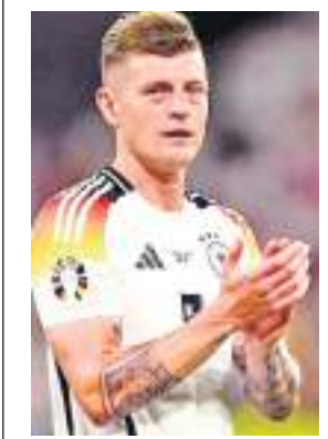
DORTMUND

Just like another Real Madrid great, Zinedine Zidane in 2006, Kroos is ending his storied career at a major tournament in Germany. He came out of international retirement in February for one last tournament. Each game Germany plays in the knockout stage could be the last of his career. Germany weathered a thunderstorm, hail and stubborn Danish resistance Saturday to ensure the 34-year-old midfielder will play again. Germany faces either Spain or Georgia in the quarterfinals July 5. Zidane reached the 2006 World Cup final with France, only to headbutt an opponent, get a red card and lose to Italy. Kroos and Germany can still dream of a win on home soil and a first major trophy since Kroos and his teammates lifted the 2014 World Cup. Until the Denmark game, Germany had not won a major tournament knockout game since Euro 2016. The win continues the sense that Germany is finally turning things around under coach Julian Nagelsmann after years of disappointment. He took over last year with a mission to deliver a host-nation success story at Euro 2024, and has already signed an extension for the 2026 World Cup.