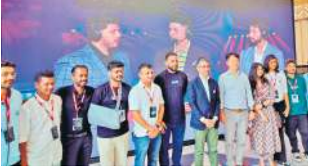
Abhinav Bindra seen with the Krafon India members

Seeing the huge gathering of Hyderabad fans for the Battlegrounds Mobile India Series 2024 finale, India's ace shooter and first individual Olympic gold medalist, Abhinav Bindra, said he is thrilled to witness the rise of Esports in India and Indian teams joining global tournaments.