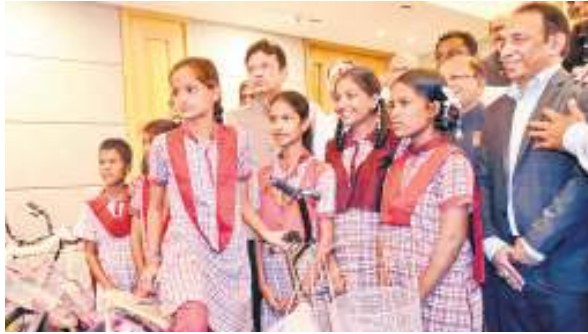
Minister for Information Technology and Industries D Sridhar Babu with students after distributing bicycles at Rotary Club in Hyderabad on Sunday

The IT Minister, as a symbolic gesture, handed over six bicycles to students of ZPHS School in Wanaparthy District.