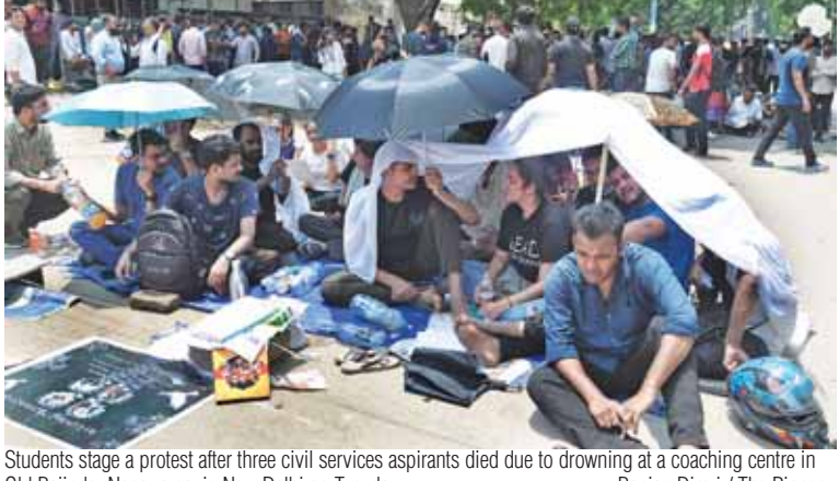
Old Rajinder Nagar area, in New Delhi on Tuesday

manhole over the drainage system has also been covered with finishing items, thus leaving no scope for cleaning of the drains. They have covered the existing, built up section water which aggravates the situation. "The plinth level of this property is also lower in comparison to the access to the institute is directly