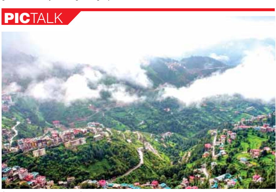
Clouds hover over the hill town of Shimla

contain Chinese influence, naturally much to the consternation of China. The Chinese unease is reflected in its actions on the border which had remained peaceful from 1962 to 2017 when the Doklam incident happened. India-China relations are complex and multifaceted, influenced by historical, political, economic, and strategic factors. The two countries share a long border. The most notable conflict occurred in 1962 when the Sino-Indian War broke out over border disputes in the Aksai Chin region. Ironically trade relations between the two countries have grown despite border disputes. China is one of India's largest trading partners. However, recent years have seen border skirmishes and strategic rivalries. In recent years, the relationship has been marked by both cooperation and contention. The Doklam skirmish in 2017 was a prominent example of border tensions. The confrontation occurred in the Doklam plateau, an area disputed between China and Bhutan. Additionally, the 2020 clashes in the Galwan Valley further highlighted ongoing tensions. Despite these challenges, India and China have continued to engage diplomatically and economically. Both nations must recognise the importance of managing their differences while pursuing mutual benefits, given their significant roles in the global economy and regional geopolitics.