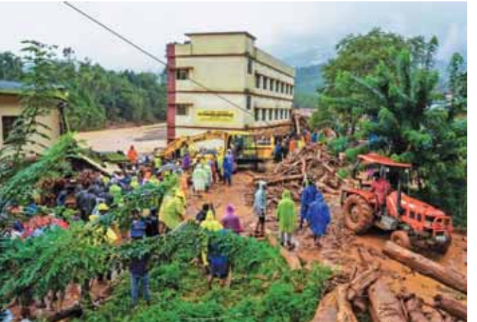
Rescue operation underway following landslides triggered by heavy rain at Chooralmala, in