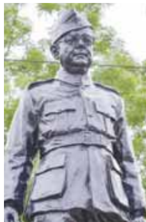
"We have been writing to the prime minister for the last three-and-a-half years, that in order to honour the liberator of India, his remains must touch Indian soil," he said.