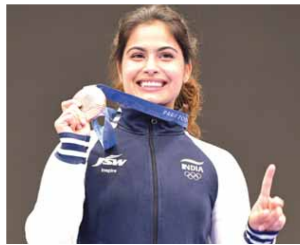
Manu Bhaker poses for a photograph with her bronze medal after finishing third in the 10m air pistol women's final round at the 2024 Summer Olympics, France, on Sunday

On July 27 Manu Bhaker had qualified for the final of her event with a score of 580 points, finishing third out of 45 competitors with the top-eight going through to Sunday's final. Bhaker scored 221.7 in the final round in which she fought hard against Korea's Kim Yeji who bagged silver and Jin Ye Oh bagged the gold with a games record of 243.2. Bhaker stated, "I was fighting with all the energy I have. Really grateful that I could win the bronze. I read Bhagwat Gita and always tried to do what I am supposed to do, left everything else to god." "We can't fight destiny," said Bhaker who appeared in her second Olympic stint. Previously she couldn't make it to the final and registered a bronze in this 2024 Olympic ending a drought in Olympic event.