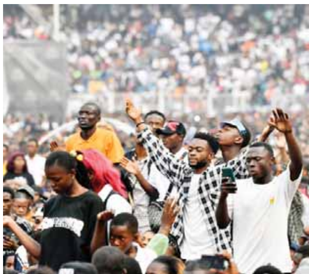
local music management company that organised the event said the chaos erupted when "the security services