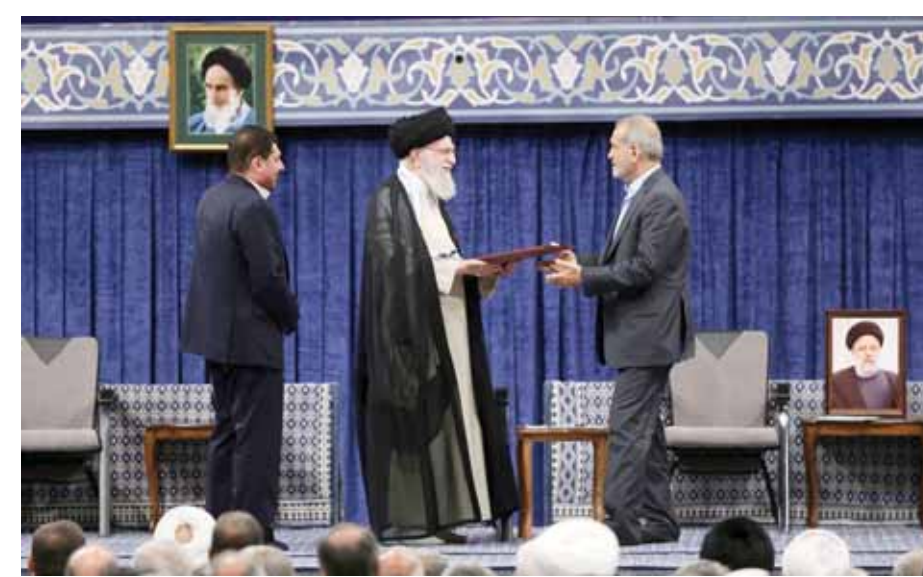
In this photo released by an official website of the office of the Iranian supreme leader, Supreme Leader Ayatollah Ali Khamenei, centre, gives his official seal of approval to newly elected President Masoud Pezeshkian, as acting President Mohammad Mokhber stands at left, in an endorsement ceremony in Tehran, Iran, on Sunday