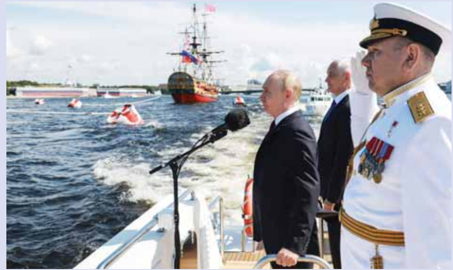
Russian President Vladimir Putin, centre, Russian Defense Minister Andrei Belousov, second right, and Russian Navy Commander-in-Chief Admiral Alexander Moiseyev, right, greet sailors prior to the main naval parade marking Russian Navy Day in St. Petersburg, Russia, on Sunday

tests that violated it. The allegations, which Russia denied, came as tensions mounted between Moscow and the West in the wake of the