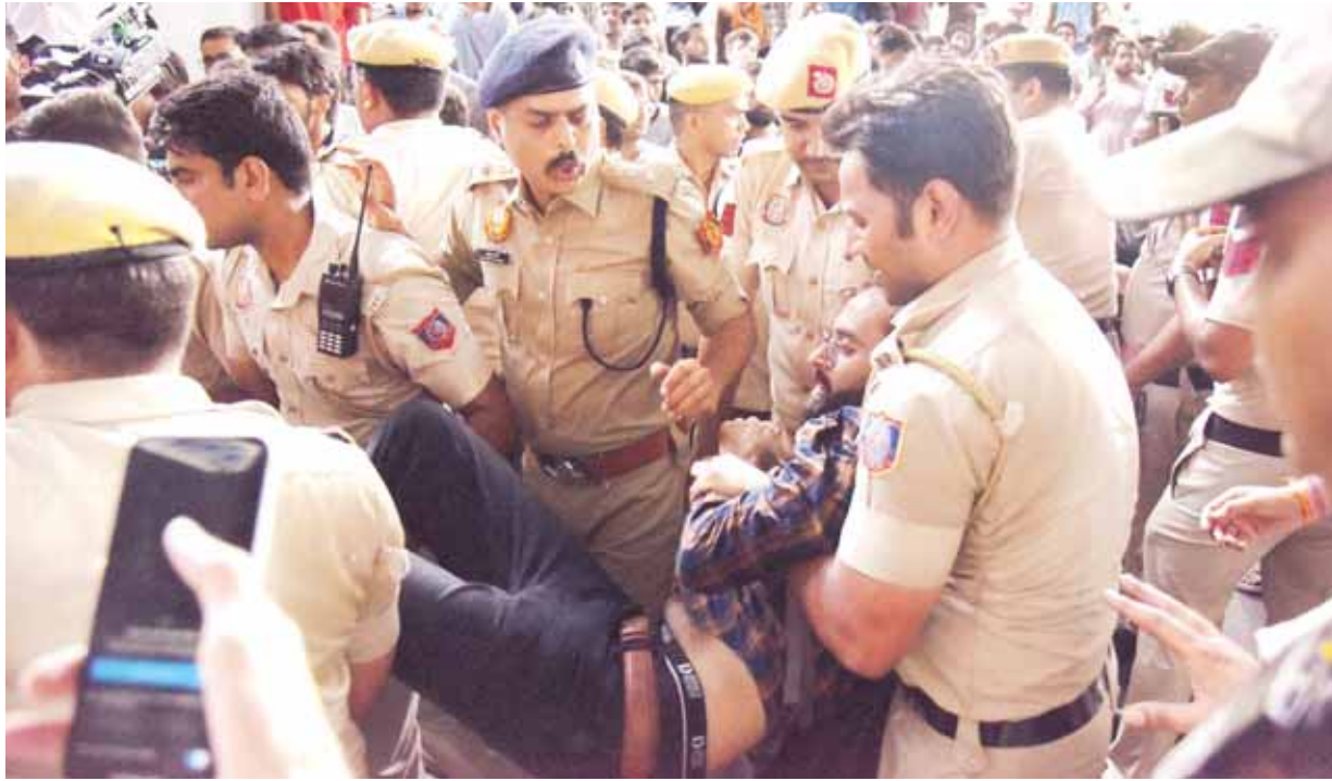
Police detain students protesting outside Karol Bagh metro station after three IAS aspirants died in the basement of Rau's IAS Study Circle at Old Rajinder Nagar area, in New Delhi, on Sunday

Thousands like the ones who fell prey to lackadaisical civic amenities make national Capital their karambhoomi for a few years to get into elite Government services. "We have WhatsApp groups of UPSC aspirants. Those groups are full with students asking about the whereabouts of their friends. I am sure that the numbers are much higher