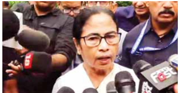
West Bengal Chief Minister Mamata Banerjee interacts with the media after walking out of a NITI Aayog meeting chaired by Prime Minister Narendra Modi, in New Delhi, on Saturday

To begin with, Mamata claimed that she was unfairly stopped midway through her speech, despite being the sole representative of the Opposition. She said her microphone was switched off after five minutes, while other Chief Ministers were allowed to speak for longer duration.