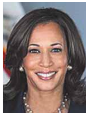
Democrats will officially nominate her for president during a virtual roll call vote early next month. Under new rules adopted by the Democratic National Committee on Wednesday, the nominee will be selected as soon as August 1, and the candidate has until August 7 to

tial campaign last Sunday, hours after President Joe Biden, 81, withdrew from the race for a second term. She is, however, yet to be officially declared as the presidential candidate by the Democrats. If elected on November 5 to succeed President Biden, Harris - the daughter of a Jamaican father and an Indian mother - would not only be the first woman, but the first Indian-American, the first Asian, the first Black woman and the first person of Jamaican descent to ascend to the office. Meanwhile, no other Democrats have announced their candidacy for the presidential race. Harris has secured endorsements from more than 40 state delegations, surpassing the number of delegates she will need to win the nomination and if that support holds,