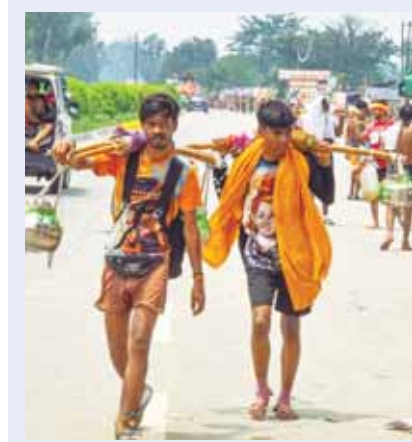
This refers to the news article, "SC Stays Nameplate Diktat on Kanwar Yatra Path" (July 23).