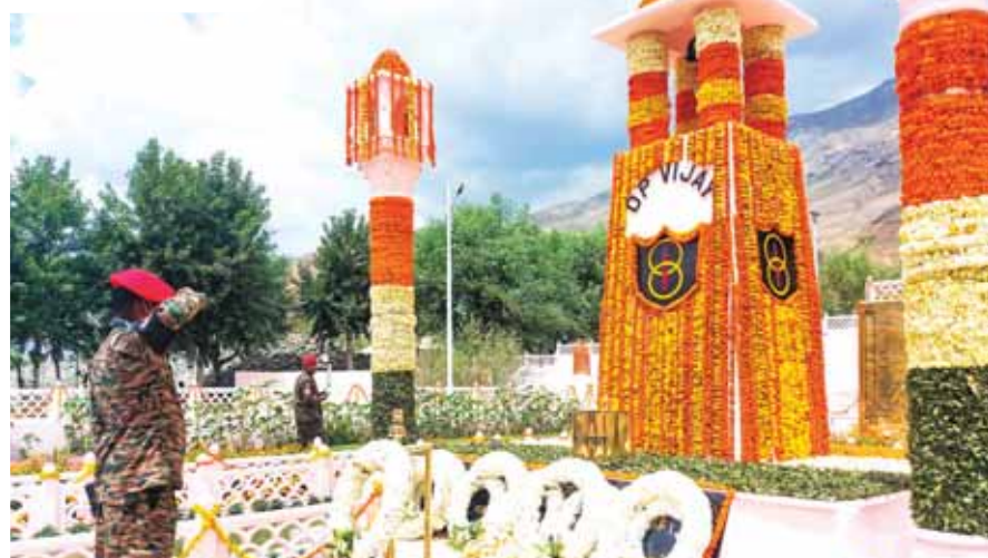
A soldier pays homage at the Kargil War Memorial on the 'Kargil Vijay Diwas', in Drass