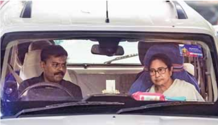
West Bengal Chief Minister Mamata Banerjee arrives at Banga Bhawan, in New Delhi, on Friday

The first meeting of NITI Aayog in the third tenure of Narendra Modi as Prime Minister is to see a "boycott call" by several non-BJP ruled Chief Ministers on Saturday. The meeting to be chaired by Modi will, however, be attended by West Bengal Chief Minister Mamata Banerjee who albeit has called for scrapping of the NITI Aayog and replace it by Planning Commission. Apart from Congress and its alliance-ruled States like Jharkhand, which are part of the INDIA Bloc, declining to attend the crucial meet in the national Capital, Delhi, Punjab, and Kerala have also announced they will not be part of the meeting. Karnataka CM Siddaramaiah, Himachal Pradesh CM Sukhvirinder Singh Sukhu and Telangana's Revanth Reddy have announced they will not attend the meeting over alleged bias against their States in the Union Budget. Tamil Nadu Chief Minister and DMK leader MK Stalin, Kerala's CM and CPI(M) leader Pinarayi Vijayan as well as Aam Aadmi Party (AAP)-led Delhi and Punjab Governments too called to boycott the meeting. "NITI Aayog should be scrapped and Planning Commission should be brought back. Thought it's my duty to raise our voice on common platform even though I know NITI Aayog has no financial power," Mamata said and confirmed to take part in the meeting. She said she will use the opportunity to register her protest against a "discriminatory Budget" and the