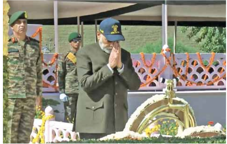
Prime Minister Narendra Modi pays homage at the Kargil War Memorial on the occasion of the 25th anniversary of the 'Kargil Vijay Diwas', in Dras, on Friday