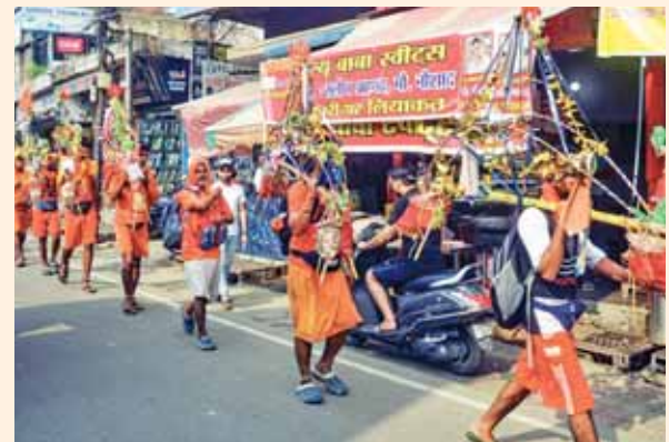
Kanwariyas walk past the shops on which banners with shopkeepers' name were put up on Kanwar Marg after an order issued by Uttar Pradesh Government, in Muzaffarnagar

to the bravehearts who made the supreme sacrifice in the line of duty the Prime Minister said, "Today I am speaking from a place where the masters of terror can hear my voice directly. I want to tell these patrons of terrorism that their nefarious intentions will never succeed. Our soldiers will crush terrorism with full force and the enemy will be given a befitting reply," he added. "India will overcome all challenges that come in the way of development, be it Ladakh or Jammu & Kashmir", the Prime Minister reiterated. Continued on Page 2