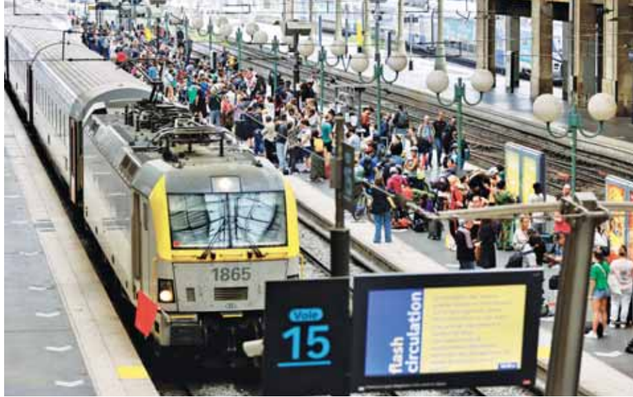
Stranded passengers wait inside Gare du Nord station in Paris, France, on Friday. France's high speed rail network TGV was severely disrupted following a 'massive attack', according to train operator SNCF, just hours before the opening ceremony of the Paris 2024 Olympic games. Around 800,000 passengers are expected to be affected over the weekend

France's high-speed rail network was hit on Friday with widespread and "criminal" acts of vandalism, including arson attacks, paralysing travel to Paris from across the rest of France and Europe only hours before the grand opening ceremony of the Olympics. French officials condemned the attacks as "criminal actions," and prosecutors in Paris opened a national investigation, saying the crimes could carry sentences of 15 to 20 years. As Paris authorities geared up for a spectacular parade on and along the Seine River, three fires were reported near the tracks on the high-speed lines of Atlantique, Nord and Est, causing disruptions that affected hundreds of thousands of travellers.