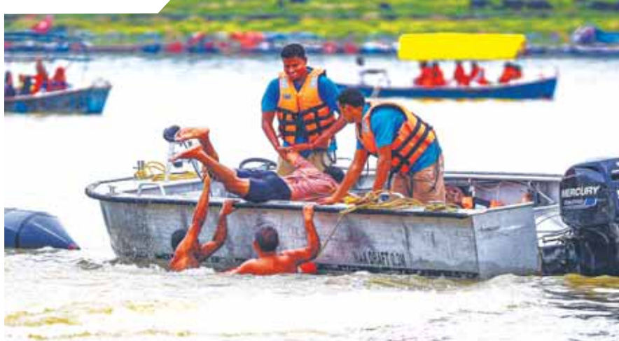
Members of the State Disaster Management Authority perform rescue operation during a mock drill, in Prayagraj