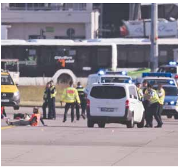
Emergency vehicles from the police, fire department and airport security are parked on the apron of Frankfurt Airport, where a few activists have taped themselves up, in Frankfurt, Germany, on Thursday

Germany's busiest airport canceled more than 100 flights Thursday as environmental activists launched a coordinated effort to disrupt air travel across Europe at the height of the summer holiday season to highlight the threat posed by climate change. Frankfurt Airport said flights were halted for safety reasons after climate activists breached security fences, triggering a response from police, firefighters and airport security officers. All runways were back in operation by 7:50 am local time, it said. About 140 flights have been cancelled so far, but further disruptions are expected throughout the day, the airport said.