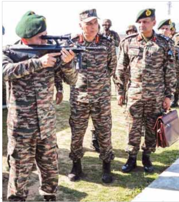
Army Chief General Upendra Dwivedi during his visit at the forward locations of Chinara Corps. Dwivedi also reviewed the security situation along the Line of Control during his visit

The security forces have been kept in a state of high alert ahead of the visit of Prime Minister Narendra Modi to attend the 25th Kargil Vijay Diwas on Friday in Drass. This will be the PM's first visit to the region after recent spate of terror attacks and also a few high-level review meetings in this regard held in the national Capital with two of them chaired by Modi himself. Army Chief General Upendra Dwivedi who landed in Srinagar early Thursday morning visited forward areas along the Line of Control in Kashmir valley to review the preparedness of the forces involved in counter-infiltration and counter-terror operations. The Army Chief later flew to Kargil to supervise the arrangements. Vital security installations were also kept on high-alert along the Jammu-Pathankot National Highway following the sighting of seven suspected terrorists in a village of the Pathankot district of the neighbouring State, Punjab. Several schools at Army installations in the Jammu region and along the highway