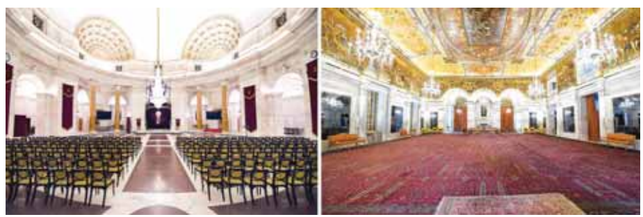
In these pictures Rashtrapati Bhawan's iconic 'Durbar Hall' (left) and 'Ashok Hall' (right) have been renamed as 'Ganantra Mandap' and 'Ashok Mandap' respectively, in New Delhi

A year after renaming the famous Mughal Gardens as "Amrit Udyan" on the premises of Rashtrapati Bhawan, efforts continue to align the iconic building with India's status as a Republic and underscore democratic principles deeply ingrained in Indian society since ancient times. On Thursday, 'Durbar Hall' and 'Ashok Hall', two historic halls of this historic residence and workplace of the President, have been rechristened as 'Ganantra Mandap' and 'Ashok Mandap' respectively. "Rashtrapati Bhawan, the office and the residence of the President of India, is a symbol of the nation, and an invaluable heritage of the people. Continuous efforts are being made to make it more accessible to people. There