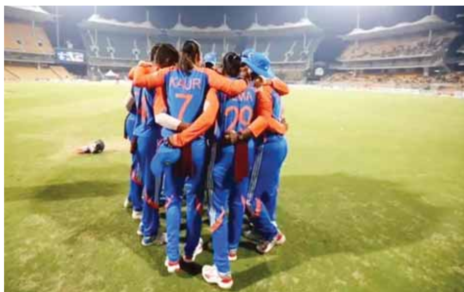
here earlier in the day at the Rangiri Dambulla International Stadium. The top two teams from the

Nepal, UAE look to make their mark Also placed in Group A are Nepal and the United Arab Emirates who will face off