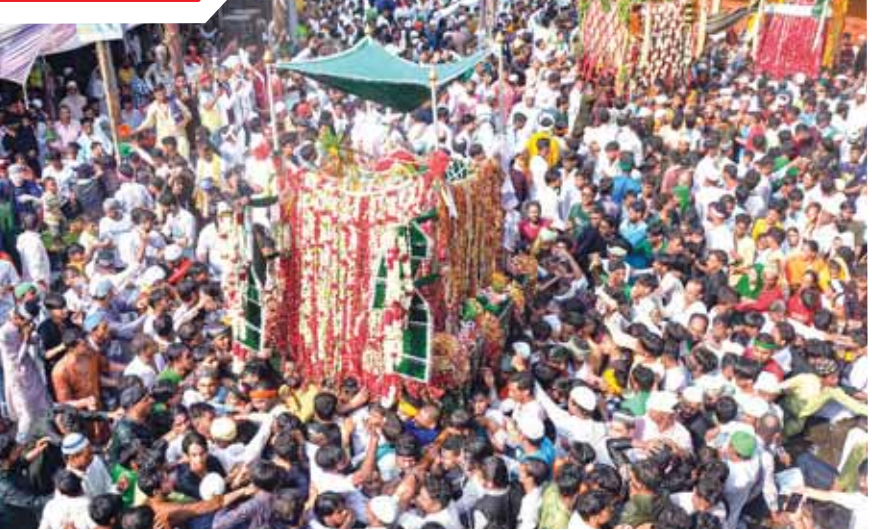
Shia Muslim mourners participate in an Ashura (10th Muharram) procession, in Mirzapur.