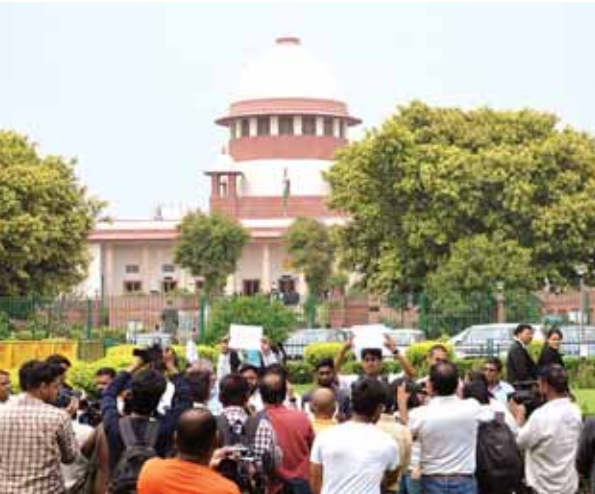
Students display placards in the precinct of the Supreme Court during a hearing on the NEET paper leak case