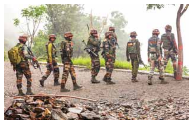
Army personnel during an encounter with terrorists in a forest village in Doda district on Thursday

As per the preliminary assessment made by the different agencies, part of the multi-layered security grid in Jammu and Kashmir, the involvement of ex-Pak army