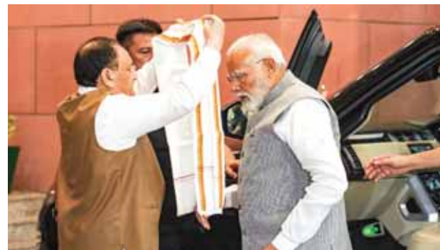
Prime Minister Narendra Modi being welcomed by Union Minister and BJP President JP Nadda as he arrives to meet party workers at the BJP headquarters, in New Delhi, on Thursday