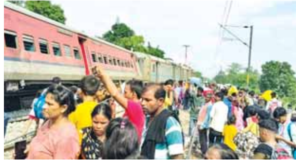
Local residents gather after Chandigarh-Dibrugarh Express derails in Uttar Pradesh on Thursday