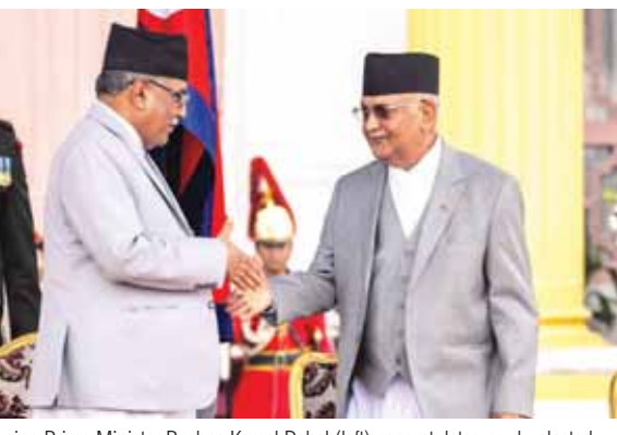
Outgoing Prime Minister Pushpa Kamal Dahal (left) congratulates newly-elected Prime Minister Khadga Prassad Oli (right) after the oath of office at the Presidential residence in Kathmandu on Monday.

According to the news portal MyRepublica, the swearing-in ceremony was delayed due to the failure of the Nepali Congress to finalise the names