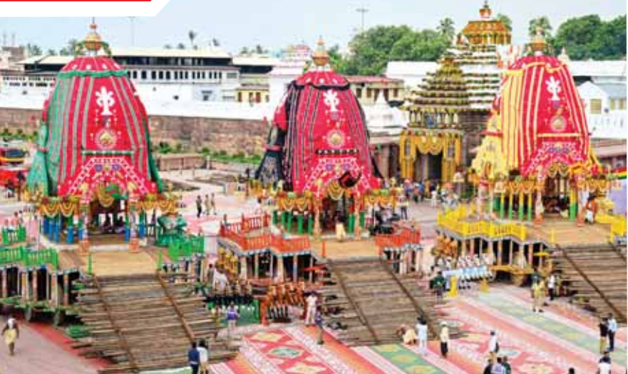
The chariots of Lord Jagannath, Balabhadra and Devi Subhadra prepared for annual Rath Yatra festival, in Puri