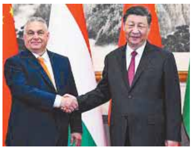
in the Russia-Ukraine war," Orban wrote on the social media platform X. "This is why I came to meet with President Xi in Beijing, just two months after his official visit to Budapest." Orban is widely seen as having the warmest relations with Xi and Russian President Vladimir Putin among European leaders. His visit to

AP ■ TAIPEI Chinese President Xi Jinping called on world powers to help Russia and Ukraine resume direct dialogue during a meeting on Monday with Hungary's Prime Minister Viktor Orban, state broadcaster CCTV reported. Orban made a surprise visit to China after similar trips last week to Russia and Ukraine to discuss prospects for a peaceful settlement of more than the two-year war. Hungary assumed the rotating presidency of the European Union this month and Orban has since embarked on a peace mission, which, however, lacks the endorsement of other European leaders. "China is a key power in creating the conditions for peace