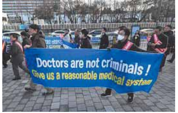
emergency and serious patients and restore a training system to add more professional doctors. More than 13,000 junior doctors, who are medical interns and residents, walked off the job in February in protest of the government's plan to sharply boost school admissions. Their walkouts have significantly burdened operations of university

Seoul (AP): South Korea said Monday it'll withdraw its earlier plan to suspend licenses of striking doctors as part of its efforts to resolve the country's months-long medical impasse. It wasn't immediately known whether and how many of thousands of the striking doctors would return to work in the wake of the government's announcement. Also, the plan could invite criticism that it hurts the principle of fairness over the government's dealing with other previous labour strikes as well as doctors who already returned to work. Health Minister Cho Kyoo-hong said Monday the government has decided not to suspend their licenses of the strikers, regardless of whether they return to their hospitals or not. He said the government's decision is meant to address a shortage of doctors treating