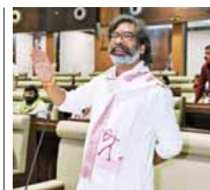
Jharkhand Chief Minister Hemant Soren speaks during a Special Session of the State Legislative Assembly, held in Ranchi on Monday