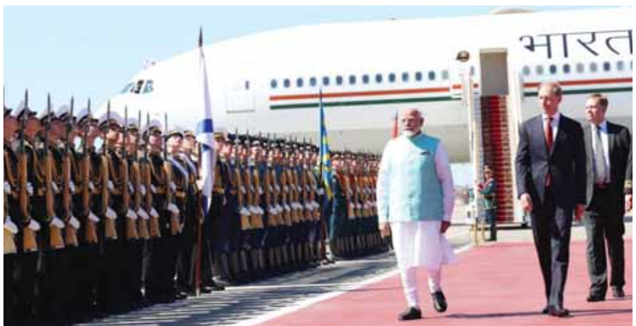
Prime Minister Narendra Modi receives a guard of honour upon his arrival at the airport in Moscow on Monday