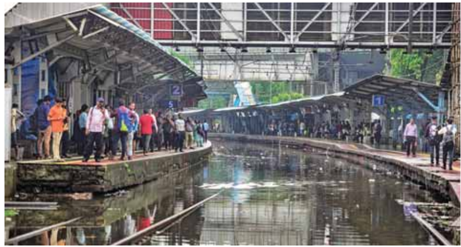
Passengers wait for trains at a waterlogged railway station during rain in Mumbai on Monday

Heavy rains continued to batter Mumbai and adjoining areas of Thane, Navi Mumbai, Kalyan, Palghar and neighbouring coastal Konkan region. Such was the high intensity of rains that during the six-hour period between 1 am and 7 am on Monday, several of the rain catchment areas like Powari received 300 mm of rainfall. The Powai Lake — one of the major water-supplying lakes of Mumbai — started overflowing during the day. Considered the lifelines of Mumbai, the suburban train services of Central Railway (CR) and Western Railway (WR) were badly hit as the railway track remained thick sheets of water, affecting the operation for the better part of the day. The BrihanMumbai Municipal Corporation (BMC) deployed pumps at several places to clear flood water in low-lying areas in the metropolis. More than 50 flights were cancelled, while 27 were