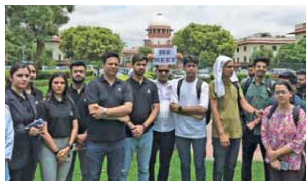
Students at the Supreme Court of India in New Delhi, on Monday. The apex court has begun the hearing for a number of petitions regarding the alleged irregularities in the NEET UG 2024 exams