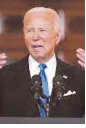
"I'm about to host the NATO nations in Washington. We put them together," Biden said. "The world's looking to us. Not a joke. The world is looking to America not to carry their burden, but to lead their hopes." Being held in the American capital, soon after Prime Minister Narendra Modi had a summit meeting with Russian President Vladimir Putin in Moscow, the NATO summit, officials said "will send a strong signal to Putin that if he thinks he can outlast the coalition of

The NATO summit, being hosted by US President Joe Biden here this week, is likely to show a strong demonstration of America and its allies' support for Ukraine and make significant new announcements to increase military, political and financial support for the war-torn European country, according to administration officials. The three-day NATO summit to be held here from July 9 to 11 will be the first to include Sweden as a member of the alliance, Sweden officially joined the alliance in March. The historic summit would also mark the 75th anniversary of the founding of the North Atlantic Treaty Organisation (NATO), which is now a strong military alliance of 32 countries. "It has been truly indispensable to Euro-Atlantic security, deterring threats to the United States and our allies," a senior administration official told reporters ahead of the summit. On Sunday, President Biden also spoke about the upcoming NATO summit in Washington, DC.