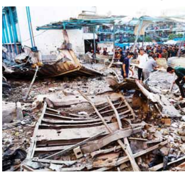
Palestinians look at the aftermath of the Israeli airstrike on a U.N.-run school that killed dozens of people in the Nusseirat refugee camp in the Gaza Strip on Saturday

The war, triggered by the Palestinian militant group following a cross-border attack on October 7, saw 1,200 people killed and 250 others taken hostage. A retaliatory Israeli air and ground offensive has killed over 38,000 Palestinians, according to the territory's Health Ministry, which does not distinguish between combatants and civilians in its count. Sunday's "Day of Disruption"