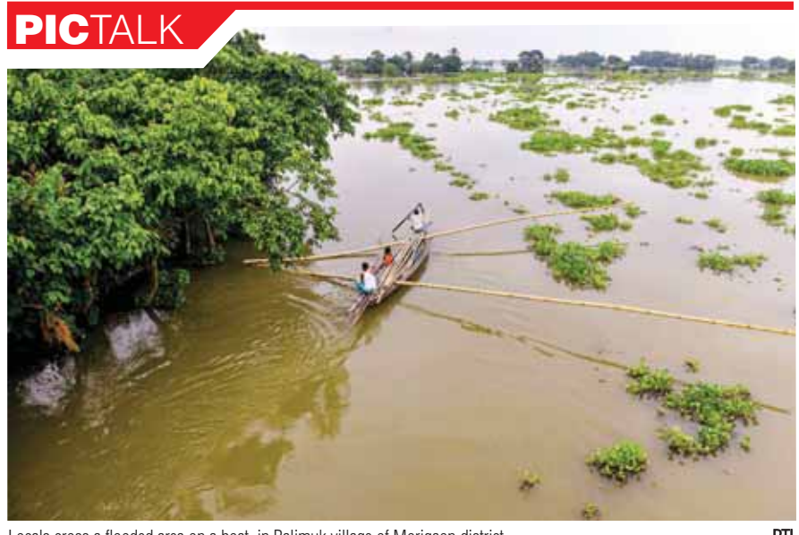
Locals cross a flooded area on a boat, in Balimuk village of Morigaon district

residency status is always on the top agenda of the Indian community in the UK and back home. The next area where substantial change could be witnessed is the economic ties between the two countries. The Liberal Party's commitment to free trade and economic partnerships could enhance bilateral trade, potentially leading to a comprehensive UK-India Free Trade Agreement (FTA). It was the first thing that came up when Prime Minister Modi congratulated the new Prime Minister of the UK Keir Starmer. Indeed, for long, The UK and India have had robust trade relationship, with the UK being one of India's significant trading partners. Under the Conservative government, there were ongoing discussions about a comprehensive Free Trade Agreement (FTA). The Labour Govt's more enthusiastic approach to global trade could accelerate these negotiations. A more collaborative and open approach to foreign policy may lead to deeper strategic ties, particularly in areas like defence, cybersecurity, and counter-terrorism. Greater involvement in global platforms like the Commonwealth, the United Nations, and climate forums, facilitating joint efforts on issues of mutual interest. Besides, India can look forward to the UK's support for India's aspirations for a greater role in international organisations, including a potential permanent seat on the UN Security Council.