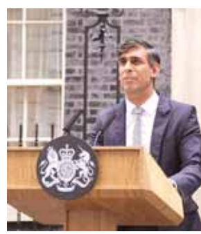
Britain's Labour Party leader Keir Starmer reacts on stage as he is elected for the Holborn and St Pancras constituency, in London (l). Britain's outgoing Conservative Party Prime Minister Rishi Sunak speaking outside 10 Downing Street before going to see King Charles III to tender his resignation in London, on Friday