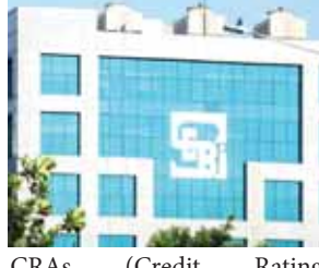
CRAs (Credit Rating Agencies), it has been decided to provide specific timelines for dealing with appeals made by the issuer in respect of rating actions carried out pursuant to periodic surveillance of ratings.

Markets regulator Sebi has issued new guidelines to streamline operations and enhance the ease of doing business for credit rating agencies.