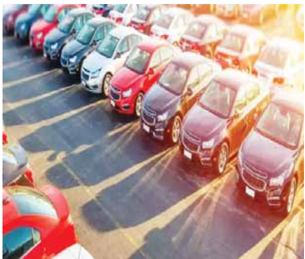
Factors such as extreme heat resulted in 13 per cent less walk-ins by probable customers in showrooms, Singhanian said. Stalled monsoon and

customer inquiries and postponed purchase decisions, he added. Singhanian also highlighted that inventory levels of passenger vehicles have reached an all-time high, ranging from 62 to 67 days.