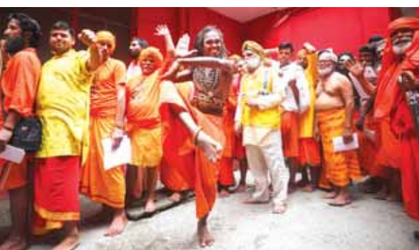
A sadhu poses while waiting to get registered for Amarnath Yatra at Ram Mandir base camp, in Jammu, on Friday