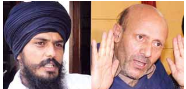
Sikh preacher Amritpal Singh and Kashmiri leader Sheikh Abdul Rashid

Jailed radical Sikh preacher Amritpal Singh and Kashmiri leader Sheikh Abdul Rashid, who were granted parole to take oath as members of the Lok Sabha, were sworn in as MPs on Friday, amid heavy deployment of security personnel in and around the Parliament complex. While Rashid, popularly known as Engineer Rashid, is in Delhi's Tihar jail in a terror-funding case registered under the Unlawful Activities (Prevention) Act, Singh is lodged in a prison in Assam's Dibrugarh district for offences under the National Security Act. They were brought to the Parliament complex by