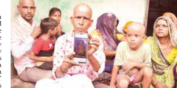
Family members sitting at a house after the Hathras stampede. Over 120 people were killed and several injured in the stampede, according to officials