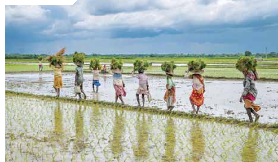
Farmers carry paddy saplings for plantation in an agricultural field, in Nadia