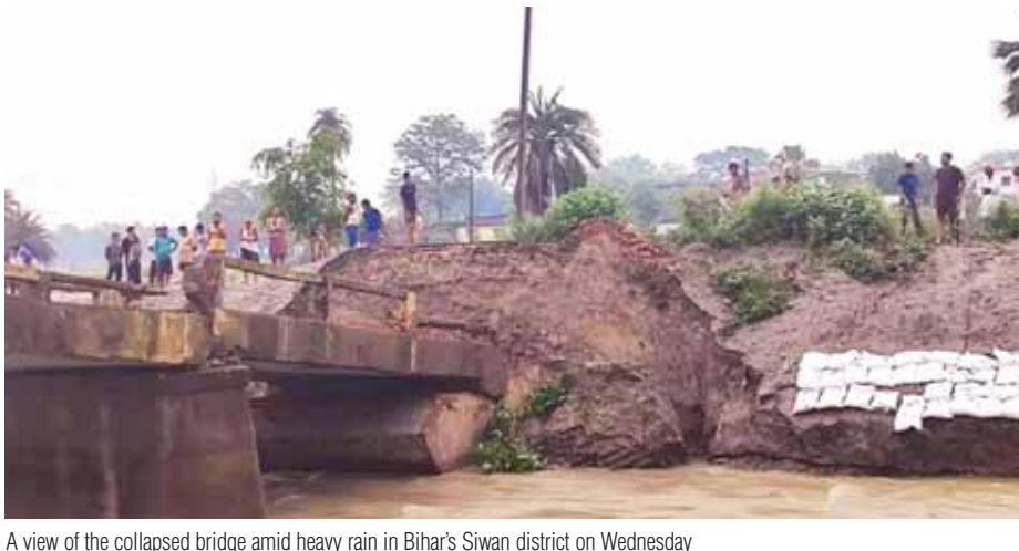
A view of the collapsed bridge amid heavy rain in Bihar's Siwan district on Wednesday

The troubling series of incidents began on June 19 with the collapse of an under-construction bridge in Araria, followed by collapses in Siwan on June 22, East Champaran on June 23, and Kishanganj on June 24. The collapse of the bridge over the Gandaki river in Deoria Block in Siwan district on