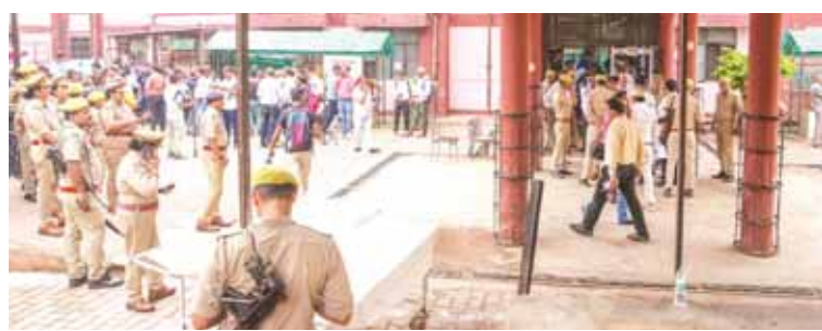
Police personnel keep vigil outside a hospital during Uttar Pradesh CM Yogi Adityanath's visit to meet the injured victims a day after the stampede that occurred during a 'satsang' (religious congregation), in Hathras district, on Wednesday