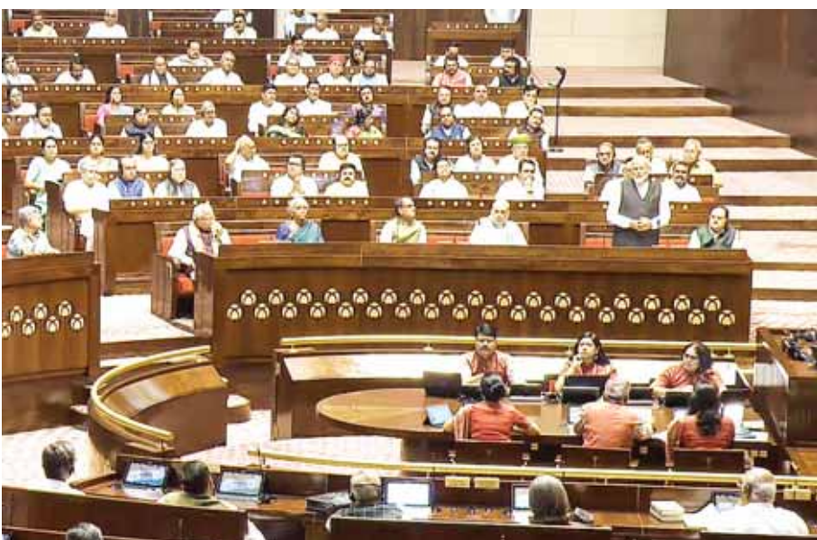
Prime Minister Narendra Modi replies to the Motion of Thanks on the President's Address in the Rajya Sabha during ongoing Parliament session, in New Delhi, on Wednesday