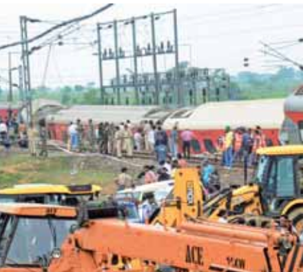
Rescue work underway after the Howrah-Mumbai Mail derailed near Badabambo, in Seraikela-Kharsawan district of Jharkhand, early Tuesday. At least two people were killed in the accident, according to officials

district. According to environmentalists, Tuesday's disaster is yet another proof that the State administration has not learnt anything from past mistakes. Wayanad has no representative in Parliament as Rahul Gandhi, the Leader of Opposition who was elected from the constituency, gave it up immediately after the 2024 Lok Sabha poll to retain Rae Bareilly. Besides the dead bodies, the rescue teams came across mutilated parts of human bodies which were crushed by huge rocks and stones spewed with force by the landslides. At the time of going to the Press, only less than half of the dead bodies have been identified.