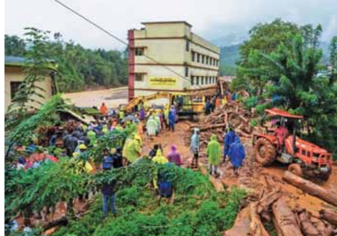
Rescue operation underway following landslides triggered by heavy rain at Chooralmala, in Wayanad district, Kerala, on Tuesday

ground reality of the ecology of the district. The committee found that deforestation, uncontrolled quarrying and mining in the district have played havoc with the environment, contributing to the frequent landslides. Within hours of the landslides, the Central Government deployed National Disaster Response Force of the Indian Army, Indian Navy and Coast Guard to save the people who were trapped by the flood waters, soil and rocks. In addition to the residents of Mundakkai atop the high ranges, many holiday makers staying in the hundreds of high-end resorts in the region too have been trapped in the landslides. Indian Air Force have deployed two choppers from its Sulur base