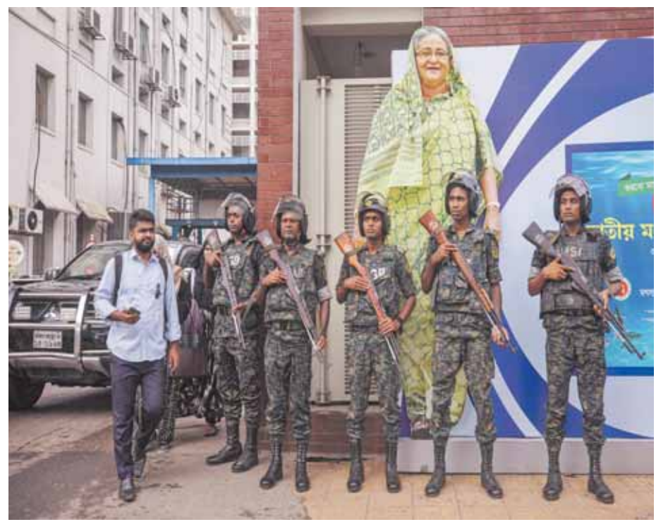
Military personnel stand guard in front of a large cutout portrait of Prime Minister Sheikh Hasina during the national mourning day, declared by the Bangladesh government to remember victims of the recent countrywide deadly clashes, in Dhaka, Bangladesh, on Tuesday, July 30

Prime Minister Sheikh Hasina's ruling Awami League's (AL) general secretary Obaidul Quader, meanwhile, said the government would thoroughly examine legal aspects before banning Jamaat-Shibir to block any possible legal loophole, which could be exploited by "this extremist group" to engage in politics in Bangladesh. For the sake of the country, the 14-party alliance has decided to ban Jamaat-Shibir to eliminate anti-national evil forces, Quader said. Quader, also the Road Transport Minister, said that Jamaat and BNP used students as "shields" during the movement while "the government is aware of the sources of their instructions, incitements, and funding." Violence gripped Bangladesh for almost the entire of July when the protests that had started in universities and colleges earlier this month, quickly turned into a widespread agitation against Prime Minister Sheikh Hasina and her government's policies. The government called in the army to quell protests against job quotas after the unrest left at least 150 dead and several thousand people, including policemen, wounded and major government installations damaged. Meanwhile, the ruling Prime Minister Sheikh Hasina's Awami League-led 14-party alliance leaders held a meeting with Hasina in the chair and