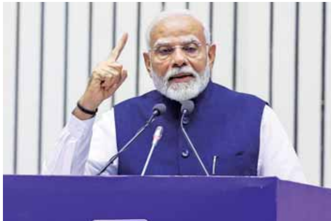
Prime Minister Narendra Modi speaks during CII post-Budget conference in New Delhi

this opportunity,” Modi said. Pointing towards the growing interest in India among global investors, the Prime Minister informed the industry about his call in the recent NITI Aayog meeting to State Chief Ministers for creating investor-friendly charters, bringing clarity in investment policies and creating a conducive atmosphere for investment. With high growth and low inflation, he said, India is a beacon of growth and stability in a world which is facing high inflation and low growth and other geopolitical challenges. India is growing at 8 per cent and the day is not far when the country will become the third-largest