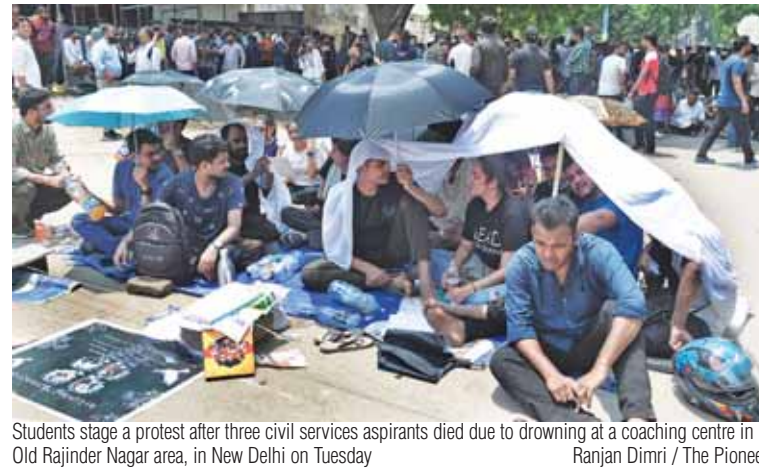
Students stage a protest after three civil services aspirants died due to drowning at a coaching centre in Old Rajinder Nagar area, in New Delhi on Tuesday