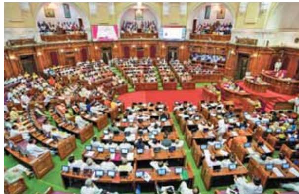
Uttar Pradesh Finance Minister Suresh Khanna presents a supplementary Budget in the presence of Chief Minister Yogi Adityanath and other members during the Monsoon Session of State Legislative Assembly at Vidhan Bhawan, in Lucknow, on Tuesday

The Uttar Pradesh Assembly on Tuesday passed the UP Prohibition of Unlawful Conversion of Religion (Amendment) Bill, 2024 that provides for a maximum punishment of life imprisonment, making the law stricter in cases of fraudulent or forced conversion. Parliamentary Affairs Minister Suresh Khanna introduced the Uttar Pradesh Prohibition of Unlawful Conversion of Religion (Amendment) Bill, 2024 in the House on Monday. The move, however, has drawn severe criticism from the Opposition. Earlier the maximum punishment provided for those found guilty of marrying a woman by deceiving and changing her religion was 10 years with a fine of ₹50,000. According to the new provisions, if any minor,