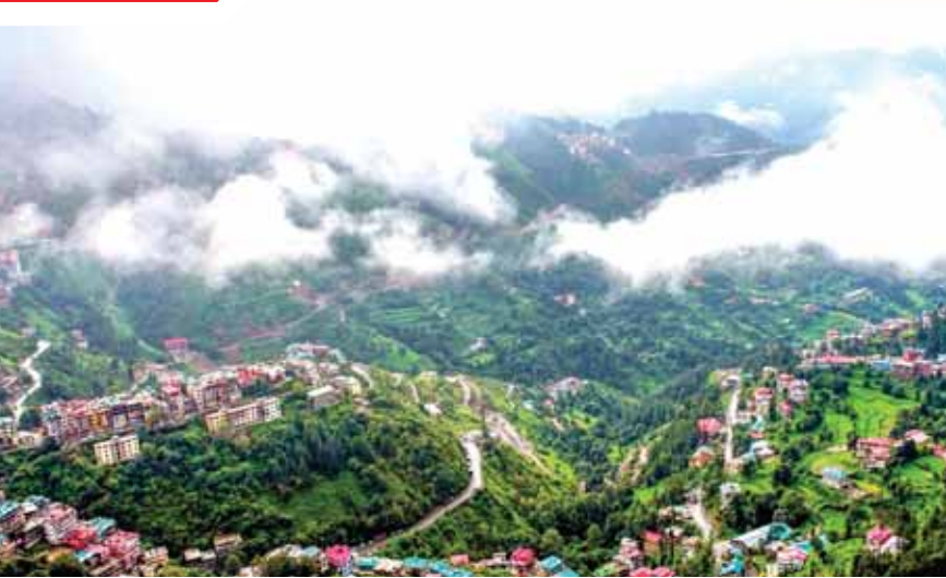
Clouds hover over the hill town of Shimla