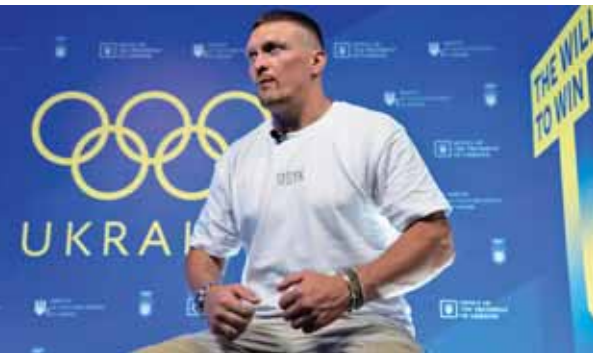
daily missile strikes, damaged sports infrastructure, and Russian occupation of regions that were home to many athletes. "We are at war. But our athletes still came," he said. "They are fighting." On both of his arms, he has tattoos of the Olympic rings. One of them is labeled "London 2012" where he won the gold medal in the heavyweight category. "We support all our Olympians

Heavyweight boxing champion Oleksandr Usyk has come to Paris to support Ukrainian athletes at the Olympics amid war at home. On Monday, he visited the Ukrainian House in Paris and from there he watched the fencing competition in which Ukrainian Olga Kharlan won the bronze medal in women's individual saber, marking the first medal for Ukraine at the 2024 Olympics. "My personal wish was, and I probably knew, that Olga is one of those people who would bring a medal for Ukraine," Usyk told the Associated Press minutes after Ukrainian fencer won the medal. Usyk expressed hope that there would be more medals as the competitions continue. He emphasized that the presence of the Ukrainian team is significant, considering the