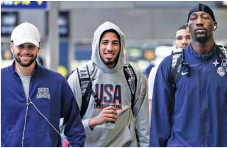
still figuring out how best to utilize its talent. "We're still trying to build identity around who we are with this 12-man group," Curry said. "It's important to stay focused on not just getting a win, but how we do it." Coach Steve Kerr said aside from it being almost impossible to give sufficient minutes to 12 players in a 40-

The question was apt, but at the same time a little flabbergasting for Stephen Curry to ponder. Could he envision a scenario in which Kevin Durant, who shined in the U.S. men's basketball team's Olympic-opening victory over Serbia, might continue to come off the bench? "We're talking about Kevin Durant as a sixth man," Curry replied. "That tells you how good this team can be." Highlights were plentiful for the U.S. in the Serbia win. LeBron James awed with his signature one-handed dunks and celebratory flexes. Durant had a nearly perfect shooting night in his first official basketball game in two months because of a calf strain. And everybody - who played that is - scored. That's because just as eye-popping was that Jayson Tatum - the newly minted highest-paid player in the NBA - and Tyrese Haliburton, who recently signed franchise record contract himself, didn't see the court. It illustrates the embarrassment of riches that exists for a team that says it's