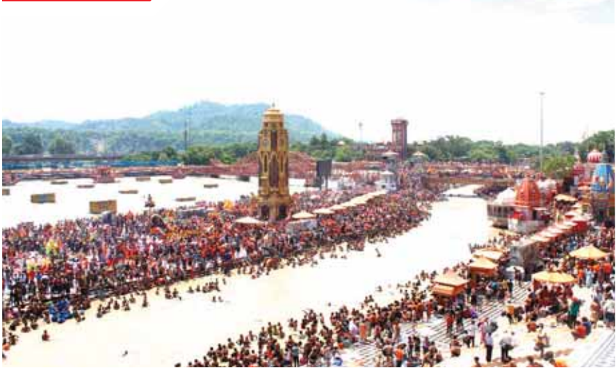
*Kanwariyas' gather at Har Ki Pauri ghat to collect 'Ganga jal', in Haridwar