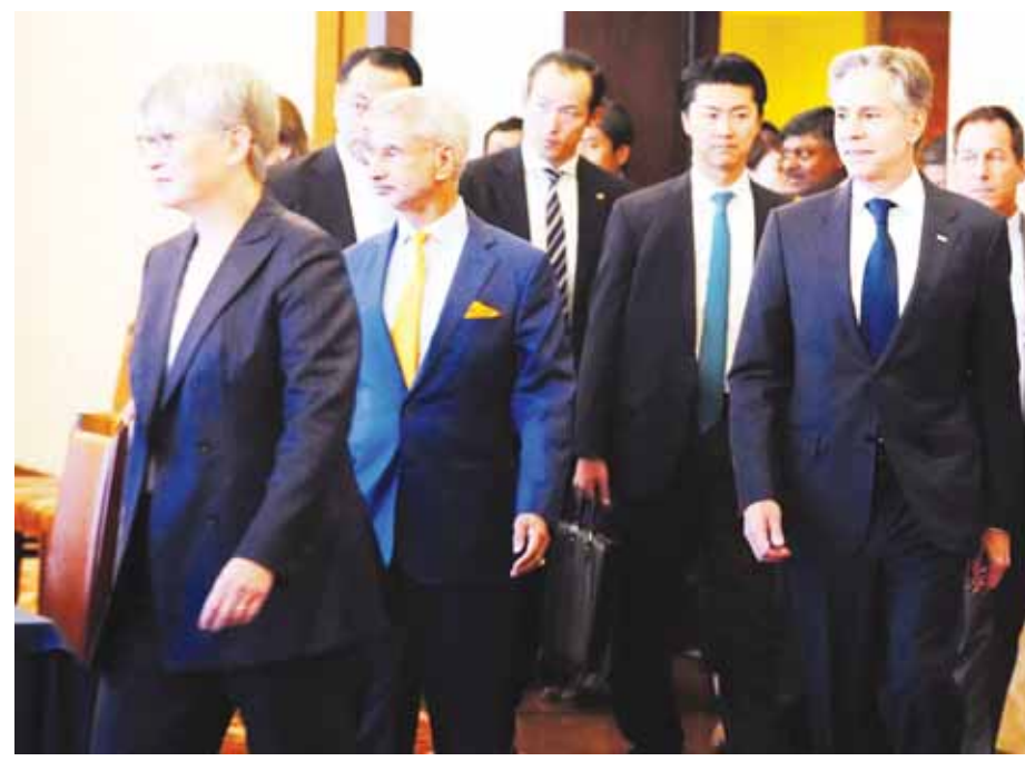
Australian Foreign Minister Penny Wong, left, Indian External Affairs Minister Subrahmanya Jaishankar, second left, and U.S. Secretary of State Antony Blinken, second right, arrive for the Quad Ministerial Meeting, at the Foreign Ministry's Iikura guesthouse in Tokyo, Monday.