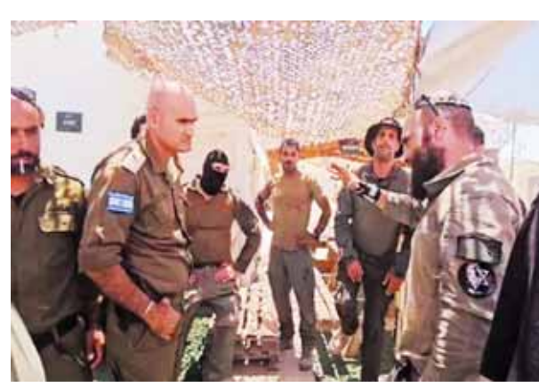
A heated argument erupts between soldiers at the Sde Teiman detention facility in southern Israel after Military Police investigators arrived to detain suspects for questioning.

The Israeli military said Monday it was holding nine soldiers for questioning following allegations of "substantial abuse" of a detainee at a shadowy facility where Israel has held Palestinian prisoners throughout the war in Gaza. The military did not disclose additional details surrounding the alleged abuse, saying only that its top legal official had launched a probe. An investigation by The Associated Press and reports by rights groups have exposed abysmal conditions at the Sde Teiman facility, the country's largest detention centre. A report by the United Nations agency for Palestinian refugees, UNRWA, earlier this year said that detainees alleged they were subjected to ill-treatment and abuse while in Israeli custody, without specifying the facility.