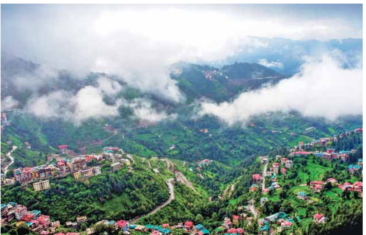
Shimla: Clouds hover over the hill town of Shimla on Monday