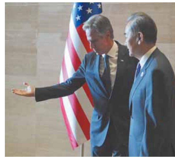
State Department spokesman Matthew Miller said Blinken and Wang had had "an open and productive" discussion but had not reached any significant agreements on the issues that divide them most in the Indo-Pacific, Europe and the Americas.

The United States and China on Saturday renewed their mutual grievances as Secretary of State Antony Blinken and his Chinese counterpart held their sixth meeting since last year amid an uncertain political situation in the US and growing concerns about China's increasing assertiveness in Asia and elsewhere.