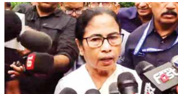
West Bengal Chief Minister Mamata Banerjee interacts with the media after walking out of a NITI Aayog meeting chaired by Prime Minister Narendra Modi, in New Delhi, on Saturday

To begin with, Mamata claimed that she was unfairly stopped midway through her speech, despite being the sole representative of the Opposition. She said her microphone was switched off after five minutes, while other Chief Ministers were allowed to speak for longer duration.