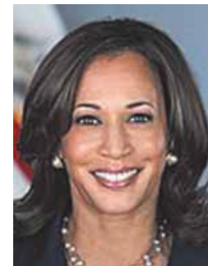
Democrats will officially nominate her for president during a virtual roll call vote early next month.

tial campaign last Sunday, hours after President Joe Biden, 81, withdrew from the race for a second term. She is, however, yet to be officially declared as the presidential candidate by the Democrats.