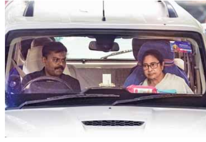
West Bengal Chief Minister Mamata Banerjee arrives at Banga Bhawan, in New Delhi, on Friday

The first meeting of NITI Aayog in the third tenure of Narendra Modi as Prime Minister is to see a "boycott call" by several non-BJP ruled Chief Ministers on Saturday. The meeting to be chaired by Modi will, however, be attended by West Bengal Chief Minister Mamata Banerjee who albeit has called for scrapping of the NITI Aayog and replace it by Planning Commission. Apart from Congress and its alliance-ruled States like Jharkhand, which are part of the INDIA Bloc, declining to attend the crucial meet in the national Capital, Delhi, Punjab, and Kerala have also announced they will not be part of the meeting. Karnataka CM Siddaramaiah, Himachal Pradesh CM Sukhvirinder Singh Sukhu and Telangana's Revanth Reddy have announced they will not attend the meeting over alleged bias against their States in the Union Budget. Tamil Nadu Chief Minister and DMK leader MK Stalin, Kerala's CM and CPI(M) leader Pinarayi Vijayan as well as Aam Aadmi Party (AAP)-led Delhi and Punjab Governments too called to boycott the meeting. "NITI Aayog should be scrapped and Planning Commission should be brought back. Thought it's my duty to raise our voice on common platform even though I know NITI Aayog has no financial power," Mamata said and confirmed to take part in the meeting. She said she will use the opportunity to register her protest against a "discriminatory Budget" and the