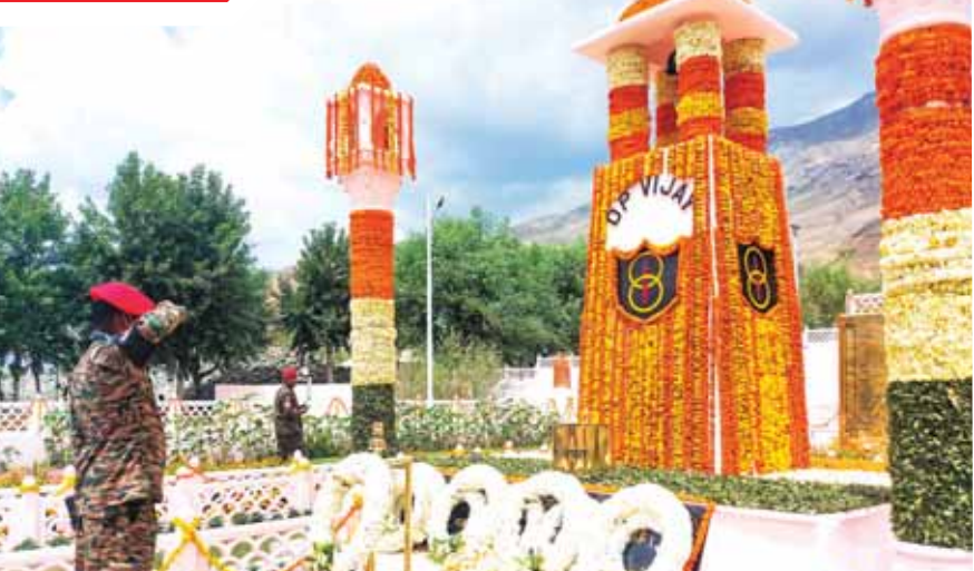
A soldier pays homage at the Kargil War Memorial on the 'Kargil Vijay Diwas', in Drass