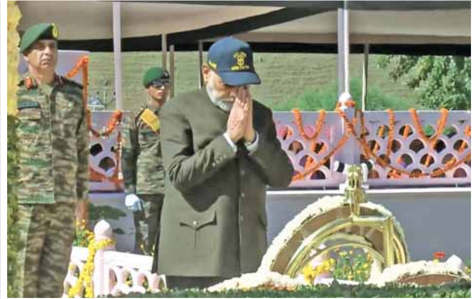
Prime Minister Narendra Modi pays homage at the Kargil War Memorial on the occasion of the 25th anniversary of the 'Kargil Vijay Diwas', in Dras, on Friday