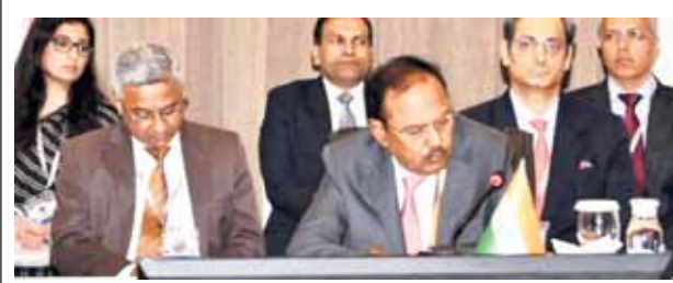
NSA Ajit Doval speaks at the BIMSTEC meet, in Myanmar on Friday