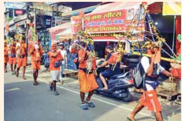
Kanwariyas walk past the shops on which banners with shopkeepers' name were put up on Kanwar Marg after an order issued by Uttar Pradesh Government, in Muzaffarnagar

homage to the bravehearts who made the supreme sacrifice in the line of duty the Prime Minister said, "Today I am speaking from a place where the masters of terror can hear my voice directly. I want to tell these patrons of terrorism that their nefarious intentions will never succeed. Our soldiers will crush terrorism with full force and the enemy will be given a befitting reply," he added. "India will overcome all challenges that come in the way of development, be it Ladakh or Jammu & Kashmir", the Prime Minister reiterated.