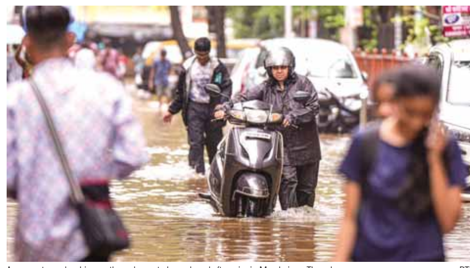
A commuter makes his way through a waterlogged road after rain, in Mumbai, on Thursday

At least three people were electrocuted in Pune and three others feared trapped under the debris of three collapsed villas in a hill slide at Lavasa, even as the heavy rains wreaked havoc in Pune, Mumbai and various parts of Maharashtra, prompting the Maharashtra Government to seek the assistance of the Army and Navy to deal with the monsoon-related incidents. Many parts of Pune lay thick sheets of water as the heavy rains ravaged the city since Wednesday night, while intense rains battered Mumbai, Thane, Palghar and other surrounding areas resulting in heavy flooding in low-lying areas and disruption in train and flight operations. As a precautionary measure, the authorities declared holidays for schools and colleges in Pune, Mumbai and Thane. Three mobile snacks stall owners were electrocuted when they tried to move their handcarts to safety through the flood waters near Z bridge at around 3.30 am in Pune, while three others were feared trapped nearby Lavasa city after a hill-slide buried three villas. A Nepali boy Shiv Jidbahadur Pariyar (18) was among three persons killed in Pune, while two others killed in an electrocution incident were identified Akash Mane (21) and Abhishek Ghanekar (25). The State's cultural, academic