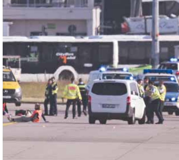
Emergency vehicles from the police, fire department and airport security are parked on the apron of Frankfurt Airport, where a few activists have taped themselves up, in Frankfurt, Germany, on Thursday

Germany's busiest airport canceled more than 100 flights Thursday as environmental activists launched a coordinated effort to disrupt air travel across Europe at the height of the summer holiday season to highlight the threat posed by climate change. Frankfurt Airport said flights were halted for safety reasons after climate activists breached security fences, triggering a response from police, firefighters and airport security officers. All runways were back in operation by 7:50 am local time, it said. About 140 flights have been cancelled so far, but further disruptions are expected throughout the day, the airport said.