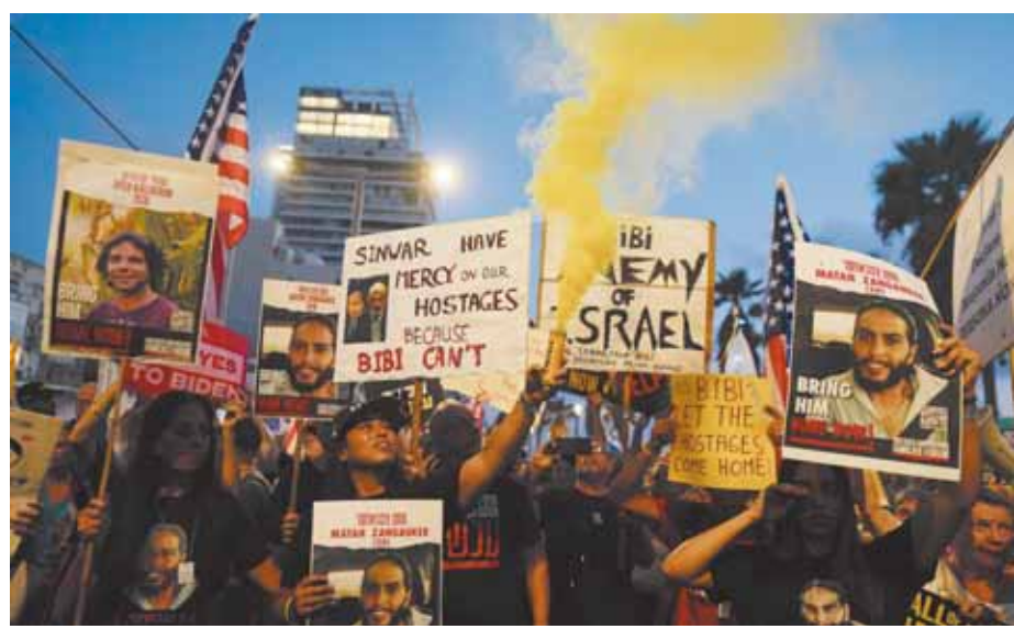
Relatives and supporters of the hostages held captive by Hamas in the Gaza Strip take part in a protest to demand their immediate release outside of the U.S. Embassy Branch Office in Tel Aviv, Israel, Wednesday.

Officials from Egypt, Israel, the United States and Qatar were expected to meet Thursday in Doha with the aim of resuming talks for a proposed three-phase cease-fire to end the war between Israel and Hamas and free the remaining hostages. But an Israeli official said Israel's negotiating team was delayed and would likely be dispatched next week. Israeli Prime Minister Benjamin Netanyahu addressed Congress in Washington on Wednesday as thousands of protesters gathered near the U.S. Capitol to denounce the war. Hamas slammed the speech Thursday and accused Netanyahu of obstructing efforts to end the war and return the hostages. Netanyahu has signaled that a cease-fire deal could be taking shape after nine months of war, but during his fiery speech to Congress, he vowed to press forward with Israel's war until he achieves "total victory." Palestinians displaced by the Israeli military's latest order to leave parts of the southern Gaza city of Khan Younis say