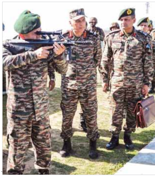
Army Chief General Upendra Dwivedi during his visit at the forward locations of Chinara Corps. Dwivedi also reviewed the security situation along the Line of Control during his visit

The security forces have been kept in a state of high alert ahead of the visit of Prime Minister Narendra Modi to attend the 25th Kargil Vijay Diwas on Friday in Drass. This will be the PM's first visit to the region after recent spate of terror attacks and also a few high-level review meetings in this regard held in the national Capital with two of them chaired by Modi himself. Army Chief General Upendra Dwivedi who landed in Srinagar early Thursday morning visited forward areas along the Line of Control in Kashmir valley to review the preparedness of the forces involved in counter-infiltration and counter-terror operations. The Army Chief later flew to Kargil to supervise the arrangements. Vital security installations were also kept on high-alert along the Jammu-Pathankot National Highway following the sighting of seven suspected terrorists in a village of the Pathankot district of the neighbouring State, Punjab. Several schools at Army installations in the Jammu region and along the highway