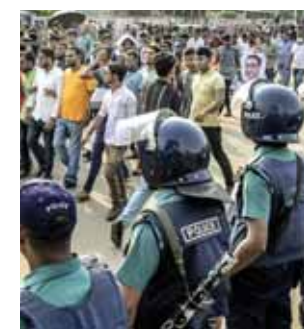
Protesters in Bangladesh

The Ministry of External Affairs (MEA) on Thursday confirmed receiving a note from Dhaka that conveyed its objection to West Bengal Chief Minister Mamata Banerjee's remarks offering shelter to people affected by violent-clashes in that country. Bangladesh Foreign Minister Hasan Mahmud has earlier objected to Mamata's recent remark of offering "shelter" to people from Bangladesh amid ongoing protests in the country. External Affairs Ministry spokesperson Randhir Jaiswal, appearing to disapprove of Mamata's comments, said matters that bring "the Union into relation with any foreign country, are the sole prerogative" of the Central Government. In an address at a public event in Kolkata, Mamata, referring to violence-hit Bangladesh, said she would keep the doors of West Bengal open for people in distress from the neighbouring country and offer them shelter. There were reports in the Bangladeshi media that said Dhaka has communicated to