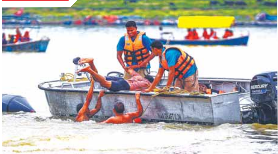
Members of the State Disaster Management Authority perform rescue operation during a mock drill, in Prayagraj PFI