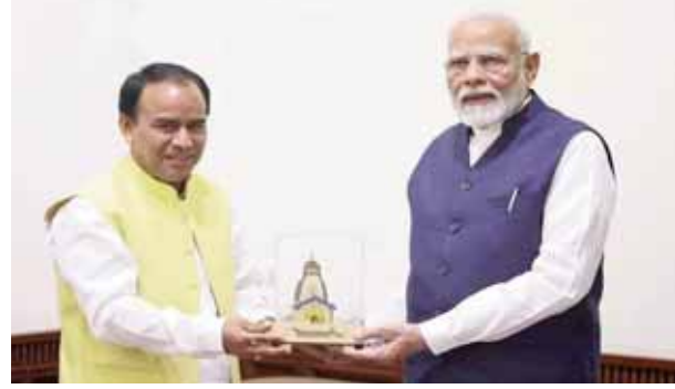
PM Modi for becoming the PM of the country for the third time and Kedarnath Dham to PM Modi on the occasion.