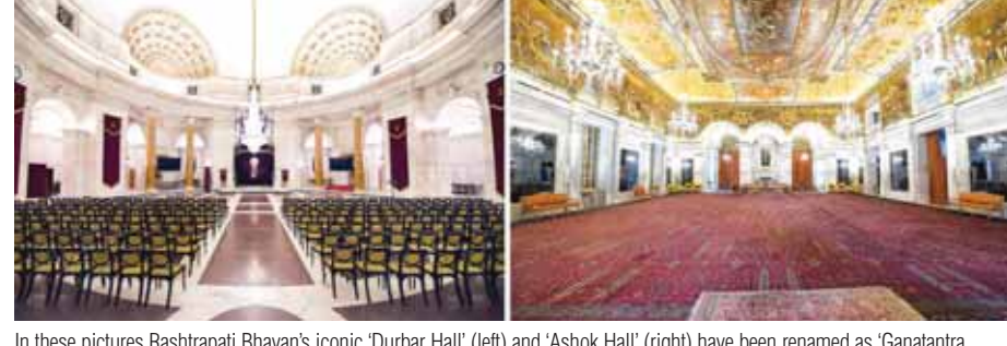
In these pictures Rashtrapati Bhawan's iconic 'Durbar Hall' (left) and 'Ashok Hall' (right) have been renamed as 'Ganantra Mandap' and 'Ashok Mandap' respectively, in New Delhi

A year after renaming the famous Mughal Gardens as "Amrit Udyan" on the premises of Rashtrapati Bhawan, efforts continue to align the iconic building with India's status as a Republic and underscore democratic principles deeply ingrained in Indian society since ancient times. On Thursday, 'Durbar Hall' and 'Ashok Hall', two historic halls of this historic residence and workplace of the President, have been rechristened as 'Ganantra Mandap' and 'Ashok Mandap' respectively. "Rashtrapati Bhawan, the office and the residence of the President of India, is a symbol of the nation, and an invaluable heritage of the people. Continuous efforts are being made to make it more accessible to people. There