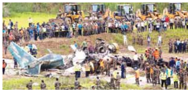
Rescue operations are underway at the site of a plane crash at Tribhuvan International Airport in Kathmandu, Nepal, on Wednesday

The top court directed the Punjab and Haryana Governments to suggest the names of suitable individuals for the committee and submit a proposal for removal of barricades on the National Highway while ordering a status quo on the border for a week. A three-judge bench headed by Justice Surya Kant said there is a need for a "neutral umpire" who can inspire confidence between farmers and the Government. "You have to take some steps to reach out to farmers. Why would they otherwise want to come to Delhi? You are sending Ministers from here and despite their best intentions there is