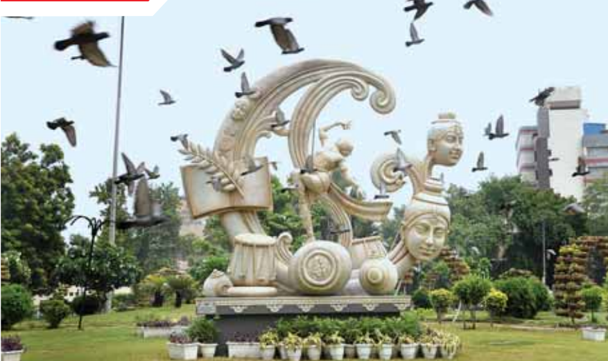
Pigeons fly past the new sculpture 'Natyashastra' installed at Mandi House, New Delhi