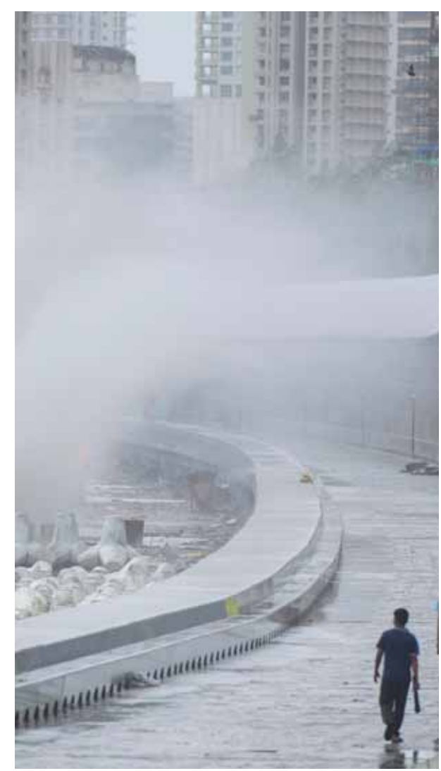
People walk past as sea waves crash against the promenade during high tide, at Marine drive, in Mumbai, on Wednesday

issues such as import duties on automobiles and scotch whisky and visas for business people. The British readout said Lammy will highlight the importance of a new partnership with India that focuses on economic, domestic and global security. Economic, domestic and global security will be at the heart of the Foreign Secretary's first visit to India as he travels to New Delhi to unlock the full potential of the UK-India partnership. He will tell his Indian counterpart that he wants to drive forward greater growth for both countries, it said. The Foreign Secretary will underscore the importance of the "living bridge" between the UK and India. It represents the 1.7 million people with Indian heritage that have made their home in the UK and make an exceptional contribution to British life, the readout released by the UK high commission in New Delhi said. "In a visit to India's third largest technology company, the Foreign Secretary will meet business leaders to highlight how the UK and India are working together on shared ambitions such as cutting-edge science to encourage innovation, boost trade, and improve the livelihoods of working people in both countries," it said.