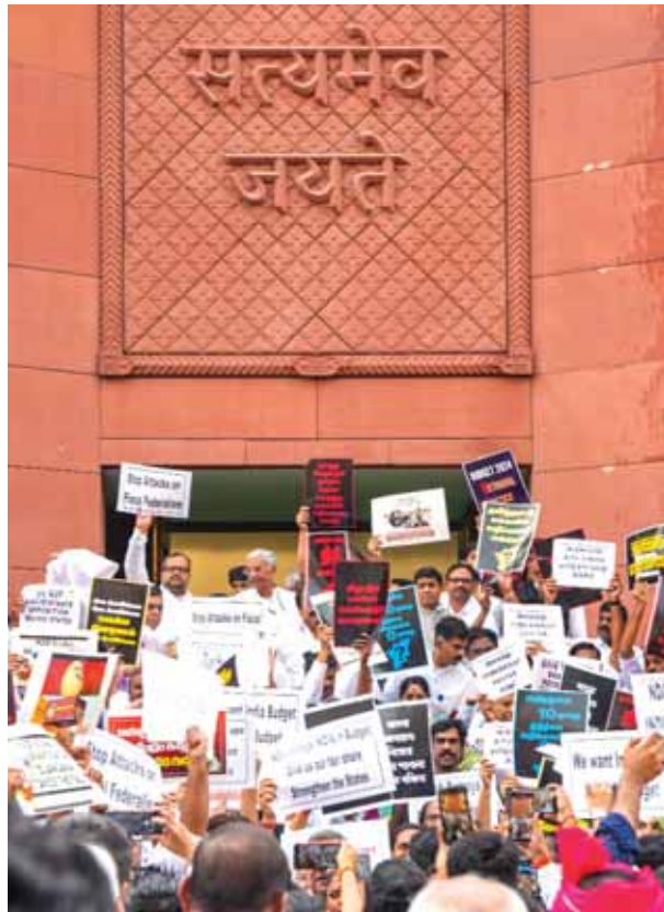
INDIA Bloc MPs stage a protest in Parliament premises over alleged discrimination in the Union Budget 2024, during the Monsoon Session, in New Delhi, on Wednesday

Opposition parties resorted to vehement protest in and out of Parliament on Wednesday over the alleged discrimination against Opposition-ruled States in the Union Budget. MPs belonging to the INDIA Bloc staged protest in Parliament premises during the day and also walked out from the Rajya Sabha while heated exchange of words between the ruling benches were noticed when issues like Article 356, Emergency cropped up. Finance Minister Nirmala Sitharaman termed the allegations by Opposition benches "outrageous" and said all the States never found a mention in any of the previous Budgets, including those presented by the Congress. Leader of the Opposition in the Lok Sabha Rahul Gandhi said the Budget is an "assault on the sanctity of India's federal structure". Ruling BJP dismissed the Congress charge of the Union Budget being "discriminatory" towards Opposition-ruled States and asserted that every State and section has been