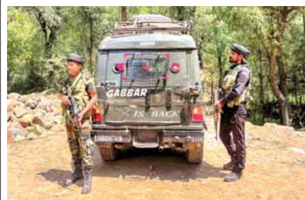
Security personnel stand guard during an encounter with terrorists in Trimukha area of Sopore in North Kashmir, on Wednesday