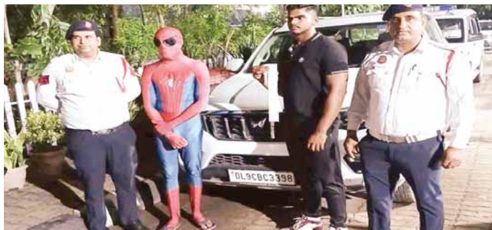
A 20-year-old man, sitting on a Scorpio car's bonnet and dressed as Spiderman landed in the police net on Wednesday

According to the police, they received a complaint on social media platform X about a Scorpio car seen on Dwarka road with a person dressed as