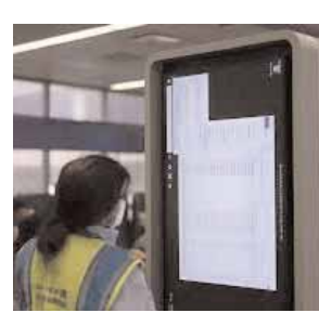
The company on Wednesday posted details online from its preliminary post incident review "of the outage, which caused chaos for the many businesses that pay for the cybersecurity firm's software services. The problem involved an "undetected error" in the

content configuration update for its Falcon platform affecting Windows machines, the Texas company said. A bug in the content validation system allowed "problematic content data" to be deployed to Crowdstrike's customers. That triggered an "unexpected exception" that caused a Windows operating system crash, the company said. As part of the new prevention measures, Crowdstrike said it's also beefing up internal testing as well as putting in place "a new check" to stop "this type of problematic content" from being deployed again. Crowdstrike has said a "signif-