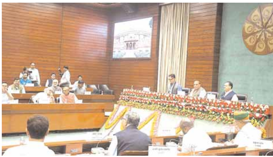
Defence Minister Rajnath Singh, Union Minister for Parliamentary Affairs Kiren Rijiju and Union Minister Jagat Prakash Nadda during the all-party meeting ahead of the Budget session of Parliament, in New Delhi on Sunday

The Monsoon Budget session will have 19 sittings till August 12 when the