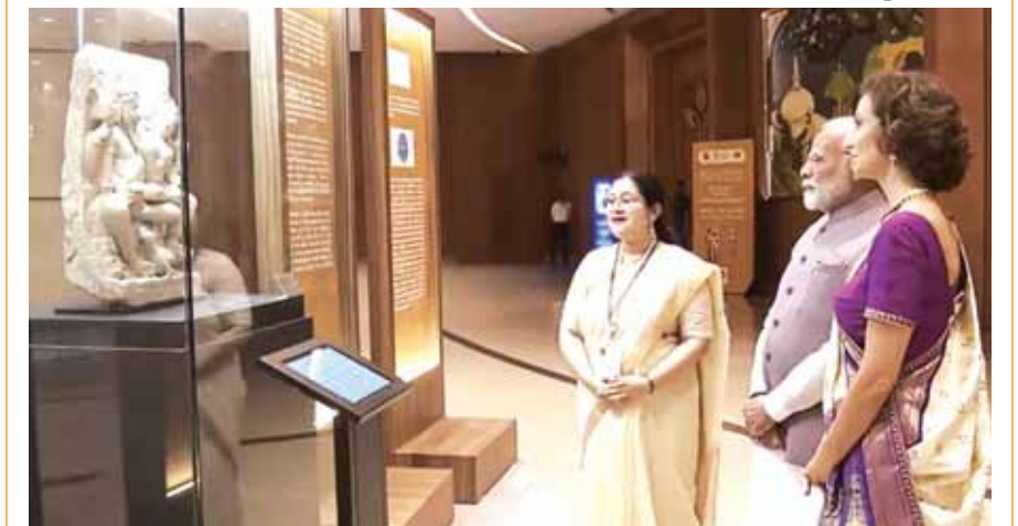
Prime Minister Narendra Modi watches exhibition during the inauguration of the 46th Session of World Heritage Committee, at Bharat Mandapam, in New Delhi, Sunday