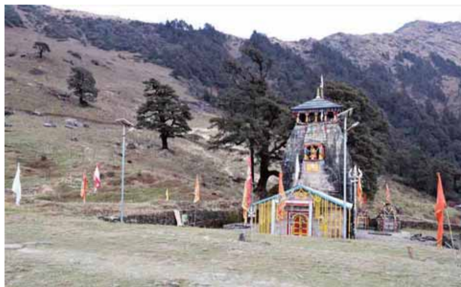
One of the Panch Kedars, the holy temple of Madhyamaheshwar

(The author is a writer, traveler and anthropologist who lives in the Himalayas; views expressed are personal)