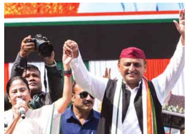
West Bengal Chief Minister and TMC chief Mamata Banerjee with Samajwadi Party (SP) National President Akhilesh Yadav during TMC 'Martyr's Day' rally in Kolkata, on Sunday

After major allies like JD (U) and LJP, BJP's another significant ally in the NDA --the Rashtriya Lok Dal -- on Sunday demanded the Uttar Pradesh Government roll back its order that eateries along the Kanwar route must display the names of their owners, saying the pilgrimage does not belong to any one religion or caste. Union Minister Jayant Chaudhary said kanwaris ask no-one their religion when they seek any service from them, neither should the matter (the pilgrimage) be linked to any religion. Chaudhary also wondered if one should wear a name tag on one's clothes to identify one's religion. "Where all one would be made to place these identifiers! Should we now wear name tags too? So that one knows who to shake hands with?" he said. "It seems that the order was taken without much thought and the Government is adamant on it because the decision has been taken," Rajya Sabha member Chaudhary told reporters here.