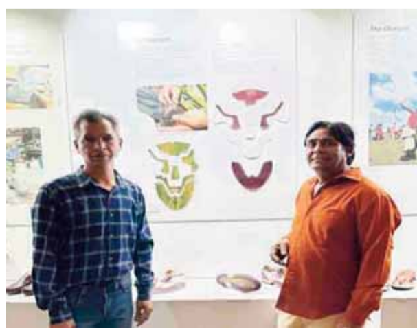
This exhibition has been curated with the intention of bringing more and more youth to the art and craft of

Shoemaking was once a flourishing trade in Dehradun and Mussoorie, given the large numbers of military and civil institutions. However, with the advent of mass-produced branded shoes in the market, clients have dwindled, and business is dull. Government apathy has further pushed the craftsmen to the margins. Despite the difficult times, the shoemaking craft of Uttarakhand supports 40 major craftsmen and their extended families. The exhibition organisers state that it is important to recognise the skill of shoemaking, which once flourished in these towns, so that custom made shoes regain their market.