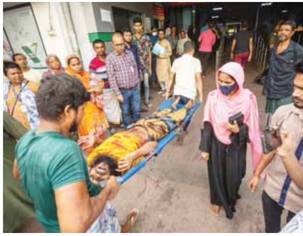
An injured student is carried on a stretcher as students clash with police over the quota system in public service brought to a hospital, in Dhaka, Bangladesh, on Saturday, July 20

The protests turned deadly on Tuesday, a day after students at Dhaka University began clashing with police. Violence continued to escalate as police fired tear gas and rubber bullets and hurled smoke grenades to scatter stone-throwing protesters. Bangladesh authorities haven't shared any official numbers of those killed and injured, but the Daily Prothom Alo newspaper reported