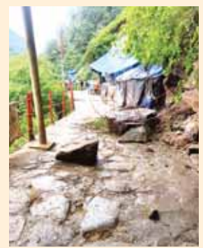
Debris lies on a road following a landslide on the Kedarnath trekking route, in Rudraprayag district, on Sunday. At least 3 pilgrims were killed and several others suffered injuries, according to officials.

Both the SP and TMC are important constituents of the INDIA bloc led by the Congress. Banerjee also attacked the CPM and Congress. "I want to thank Akhilesh ji, you have accepted my invitation. I want the relationship of Bengal to be better with the entire country. I want to say the 'Khel' that you showed in UP, they (BJP) should have resigned from their post but they are shameless. They have tried every agency and every means possible but they have still lost. In North Bengal, our results have not been good but I hope in the coming days we will be winning there," Mamata said at the rally where she found the opportunity to attack the Congress as well as the Left.