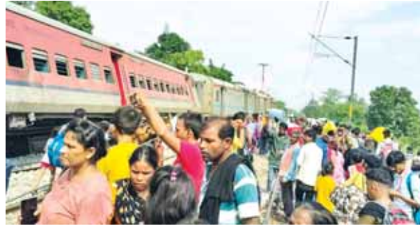
Local residents gather after Chandigarh-Dibrugarh Express derails in Uttar Pradesh on Thursday

It also said material collected by the Bihar Police and the report of its Economic Offences Wing (EOW), before the investigation was taken over by the CBI, shall be filed in the court by 5 pm on July 20. At the outset, the bench said it has prioritised the hearing on the pleas over other cases as these have "social ramifications" and lakhs of students are waiting for the outcome.