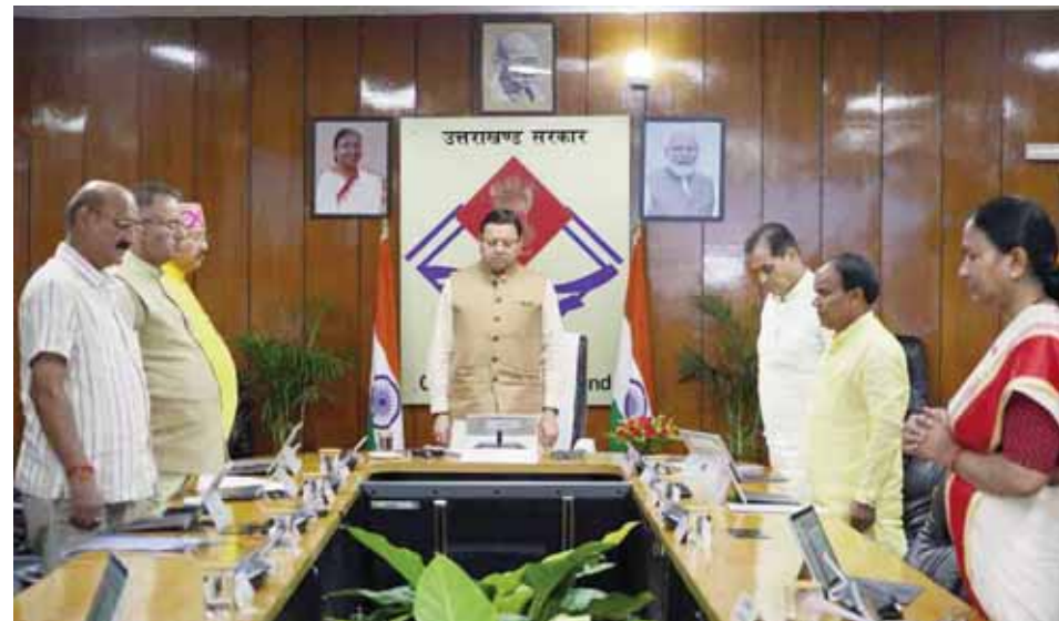
Cabinet members pay homage to martyrs and recently deceased Kedarnath MLA before start of their meeting on Thursday

The cabinet authorised Dhami to take decision on the venue and dates of the upcoming monsoon session of Uttarakhand Assembly.