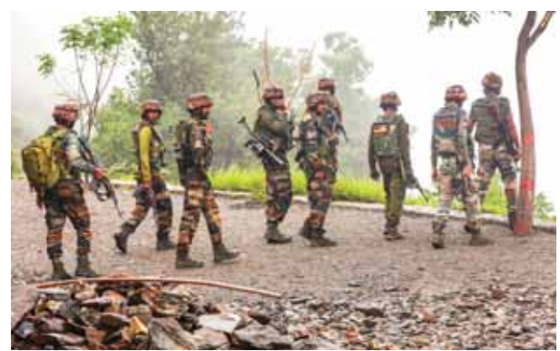
Army personnel during an encounter with terrorists in a forest village in Doda district on Thursday

Adopting offensive posturing the Indian Army has already rushed additional troops to be deployed along the higher reaches of the Kathua district bordering Himachal Pradesh to plug the gaps and block the escape routes of infiltrating terrorists. Troop deployment is also being reviewed across the frontier districts of Rajouri and Poonch as the region has witnessed repeated ambushes on army trucks and patrol parties since October 2021. The security forces are also contemplating setting up additional posts in the upper reaches of the Doda and Kishtwar districts to block the traditional routes of crossing into the Kashmir valley. As per the preliminary assessment made by the different agencies, part of the multi-layered security grid in Jammu and Kashmir, the involvement of ex-Pak army