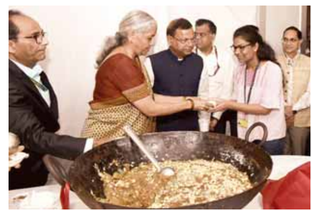
The Union Minister for Finance and Corporate Affairs, Nirmala Sitharaman commences final stage of Union Budget 2024 with halwa ceremony, in New Delhi,

financial year. Meanwhile, the Opposition parties under the INDIA Bloc too have convened a meeting of their Parliamentarians the same evening and another on July 22 morning ahead of the resumption of Parliament to discuss the strategy to raise the issues during the threeweeks-long Monsoon cum